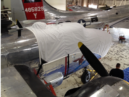
B25 Cockpit/Nose Cover

This cover type is made from Silver Acrylic Sunbrella canvas and is 100% lined with a soft and smooth microfiber. Bruce's Custom Covers developed this material combination especially for aircraft protection. The outer material is medium weight and treated for water resistance, UV resistance and anti-static buildup. The inner lining is a very soft and smooth microfiber to prevent scratching. The material is very reflective, and tests show that the cabin interior temperature can be reduced to near-ambient temperature on the hottest of days. It is water, ice and snow repellent, yet breathable to allow moisture to escape from between the cover and the aircraft surface.