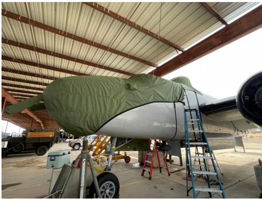
Mitchell B25 Cockpit/Nose Cover, & Turret Cover