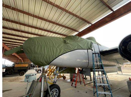
Mitchell B25 Cockpit/Nose Cover, & Turret Cover