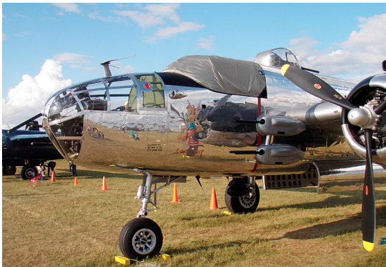
Mitchell B25 Cockpit Cover (Snap-On Type)