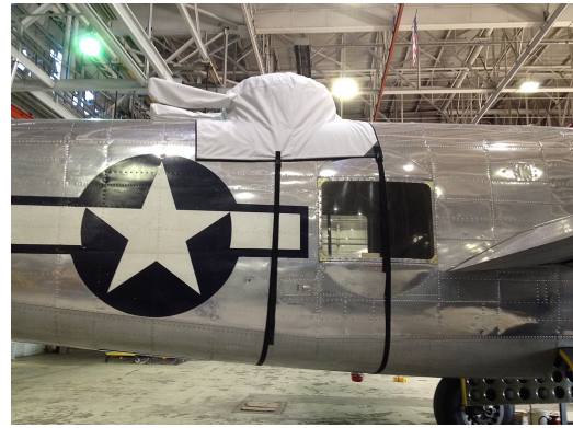
B25 Gun Turret Cover