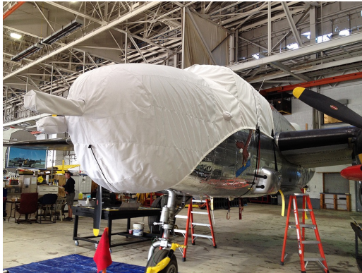
B25 Cockpit/Nose Cover

This cover type is made from Silver Acrylic Sunbrella canvas and is 100% lined with a soft and smooth microfiber. Bruce's Custom Covers developed this material combination especially for aircraft protection. The outer material is medium weight and treated for water resistance, UV resistance and anti-static buildup. The inner lining is a very soft and smooth microfiber to prevent scratching. The material is very reflective, and tests show that the cabin interior temperature can be reduced to near-ambient temperature on the hottest of days. It is water, ice and snow repellent, yet breathable to allow moisture to escape from between the cover and the aircraft surface.