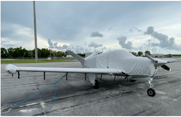
Beech P35 Bonanza Extended Canopy/Engine/Empennage Cover, Wing Covers