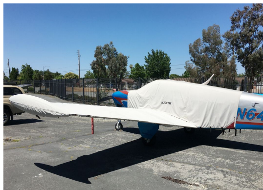
Beech Bonanza A36 Extended Canopy, Wing Covers with D'Shannon Tip Tanks