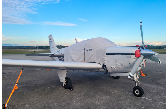
Beech F33A Bonanza Extended Canopy Cover