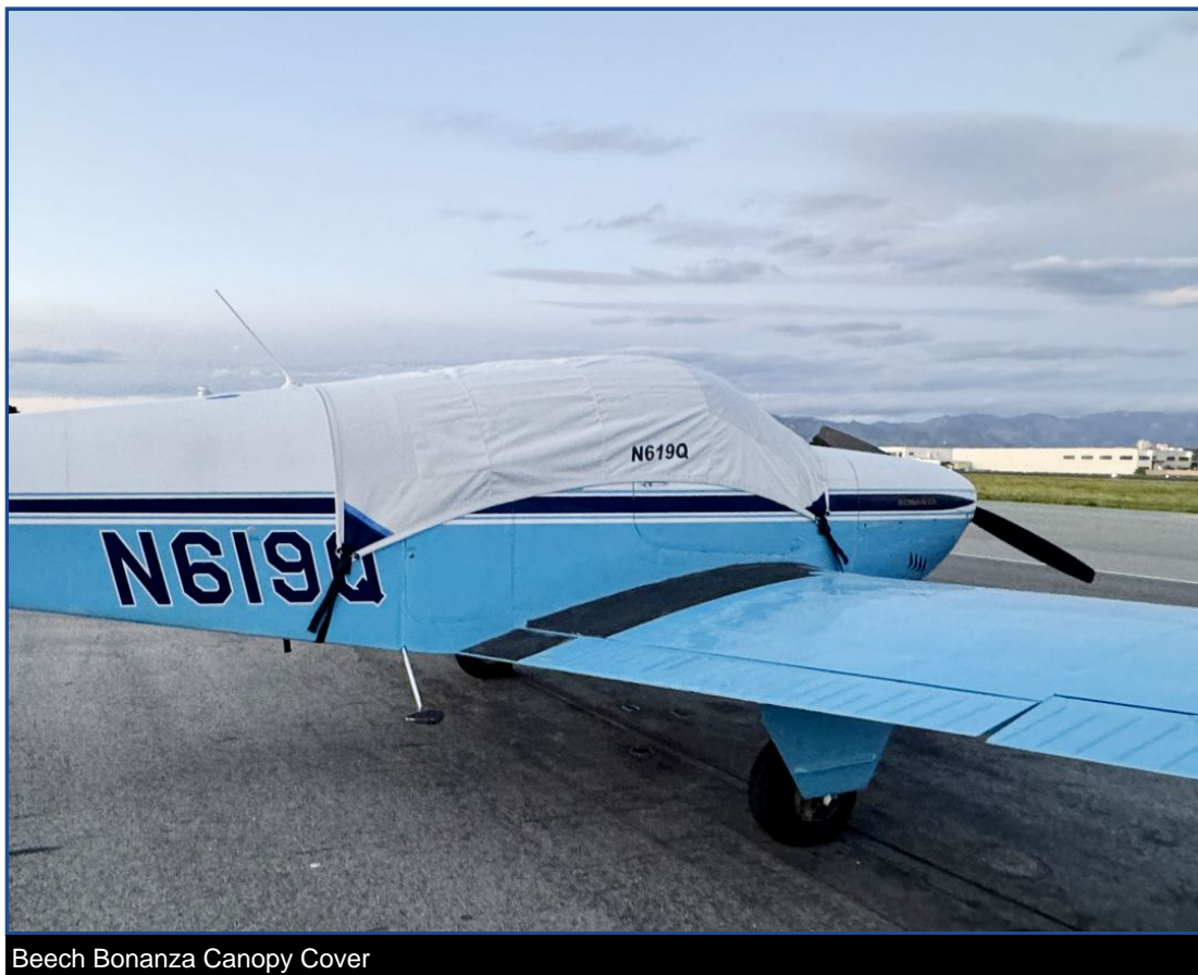
Beech Bonanza Canopy Cover