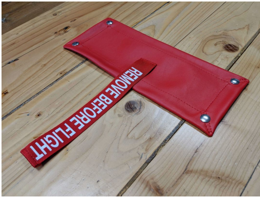
Beech Bonanza/Debonair Induction Air Filter Inlet Cover