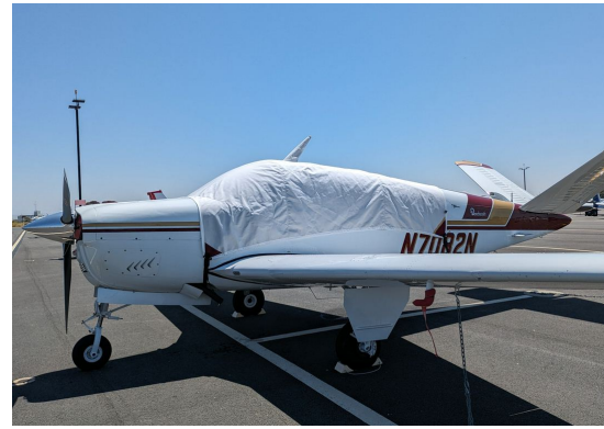
Beech Bonanza V35A Canopy Cover