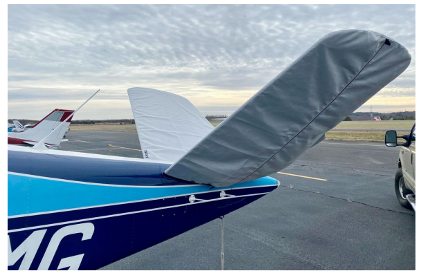
Beech S35 Horizontal Stabilizer Covers (V-Tail Model)