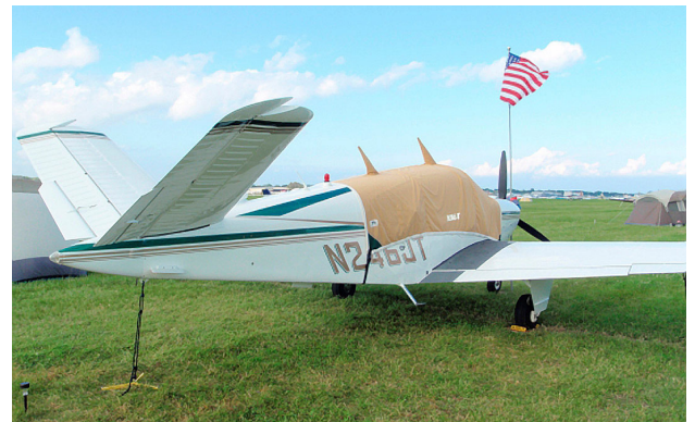
Beech Bonanza V35B Canopy Cover