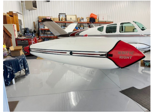
Beech Bonanza Tip Tank Safety Pads