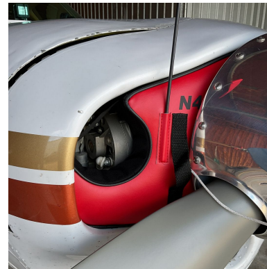
Beech A36 Engine Inlet Plugs (285HP-300HP) Large Bonanza, not for "hot prop" (set of 2), WITH HEATER HOSE INLET