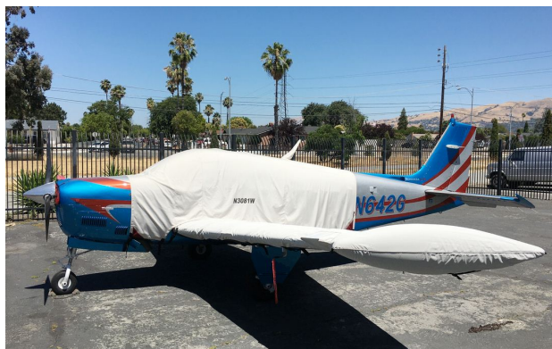
Beech Bonanza A36 Extended Canopy, Wing Covers with D'Shannon Tip Tanks

Designed to prevent damage to the aircraft extremities in crowded hangars, these products are made of bright red Naugahyde and thickly padded with a sandwich of closed cell foam. Nowadays they are also made using bright read Neoprene padded laminted (think: wetsuit material).