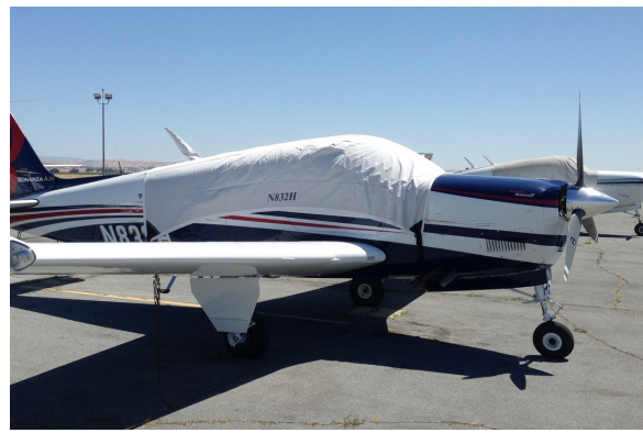
Beech Bonanza Canopy Cover doing its job on a beautiful summer day!