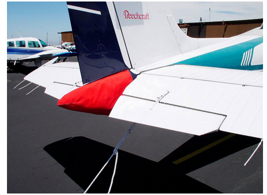
Beech Bonanza Tailcone Cover