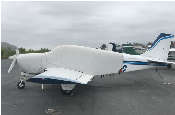
FOR INTERIOR USE. Beech Bonanza Insulated Hangar Blanket, available in Red or Silver Beech Debonair Extended Canopy/Engine Cover, 3-Blade Prop Cover