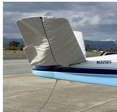
Beech V-Tail Bonanza Horizontal Stabilizer Covers