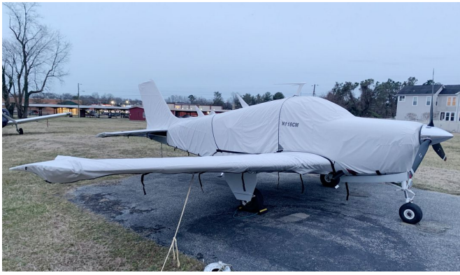
Beech Bonanza F33A Complete Cover Set