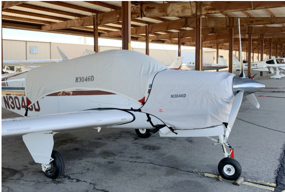
Beech Bonanza Engine Cover, Canopy Cover

This cover type is made from Silver Acrylic Sunbrella canvas and is 100% lined with a soft and smooth microfiber. Bruce's Custom Covers developed this material combination especially for aircraft protection. The outer material is medium weight and treated for water resistance, UV resistance and anti-static buildup. The inner lining is a very soft and smooth microfiber to prevent scratching. The material is very reflective, and tests show that the cabin interior temperature can be reduced to near-ambient temperature on the hottest of days. It is water, ice and snow repellent, yet breathable to allow moisture to escape from between the cover and the aircraft surface.