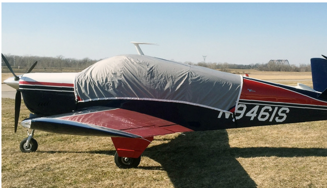
Beech Bonanza/Debonair Travel Cover

Travel Covers are made with Silver Solution-Dyed Polyester fabric and only lined over the windshield to save weight. The material is lightweight and more compact for easy stowage in the aircraft. The polyester material is water resistant, but only intended for occasional use outside. We also have an ultra lightweight material available for fitted hangar dust covers. For daily outdoor use, the non-travel Sunbrella Cover is the best choice.