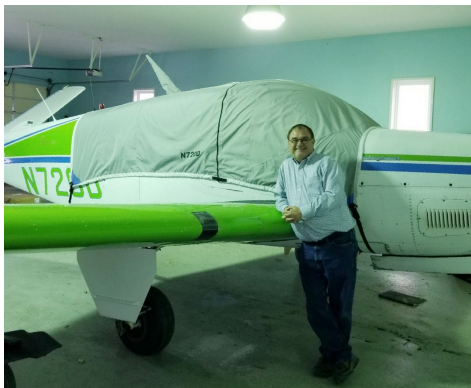
Beech Bonanza Light Weight Travel Cover

Travel Covers are made with Silver Solution-Dyed Polyester fabric and only lined over the windshield to save weight. The material is lightweight and more compact for easy stowage in the aircraft. The polyester material is water resistant, but only intended for occasional use outside. We also have an ultra lightweight material available for fitted hangar dust covers. For daily outdoor use, the non-travel Sunbrella Cover is the best choice.