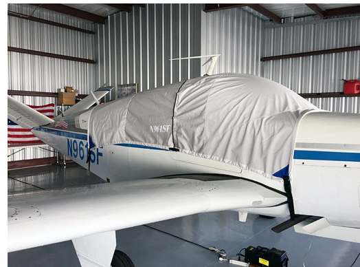
Beech Bonanza/Debonair Canopy Cover