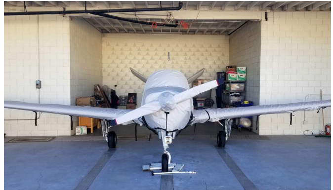
Beech Bonanza N35 Complete Cover Set