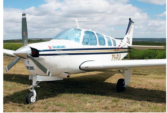
Bonanza A36 HeatShield Set