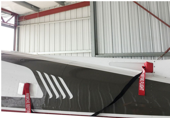
Beech Bonanza/Baron Fresh Air Intake & Exhaust Plugs

Engine Inlet Plugs are custom fit for your Beech Bonanza/Debonair intakes, made with heavy-duty vinyl material, and stuffed with a single block of sculpted urethane foam. Each plug has a zipper that allows the foam to be removed and dried if necessary. Engine plugs have warning flags that are visible from the cockpit or 'remove before flight' streamers sewn onto the face of the plugs. Most plugs are imprinted with the aircraft registration number in black for an extra charge. Storage bag NOT included. Engine plugs may be inserted after flight when the engine is still warm. Engine Inlet Plugs are commonly referred to as Cowl Plugs, Intake Plugs, Cowl Blocks, Engine Blocks, and Engine Bungs. Designed to prevent damage to the aircraft extremities in crowded hangars, these products are made of bright red Naugahyde and thickly padded with a sandwich of closed cell foam. Nowadays they are also made using bright red Neoprene padded laminted (think: wetsuit material).