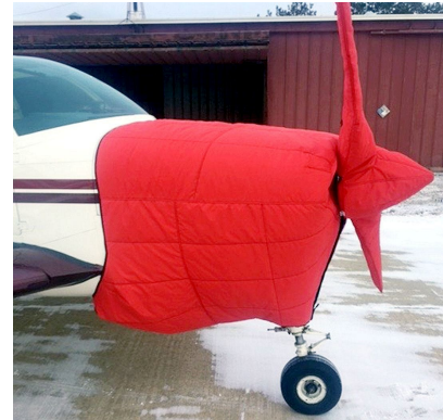
Bonanza Insulated Engine and Prop Cover