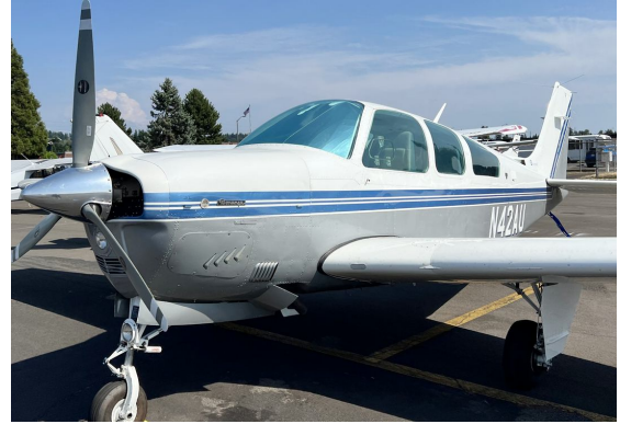
Beech Bonanza F33A Windshield HeatShield