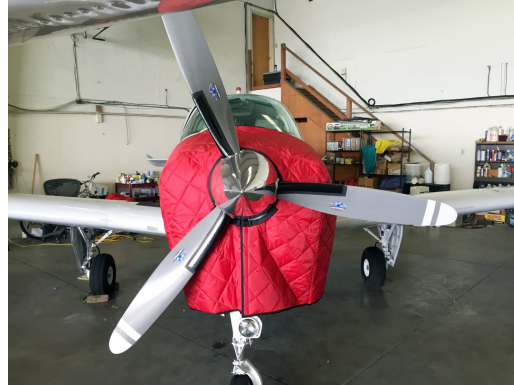
FOR INTERIOR USE. Beech Bonanza Insulated Hangar Blanket, available in Red or Silver