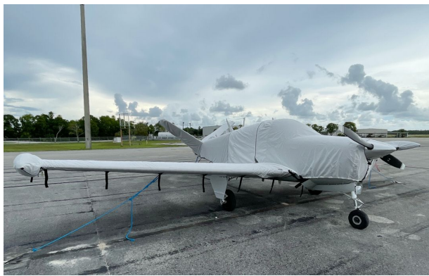
Beech P35 Bonanza Extended Canopy/Engine/Empennage Cover, Wing Covers