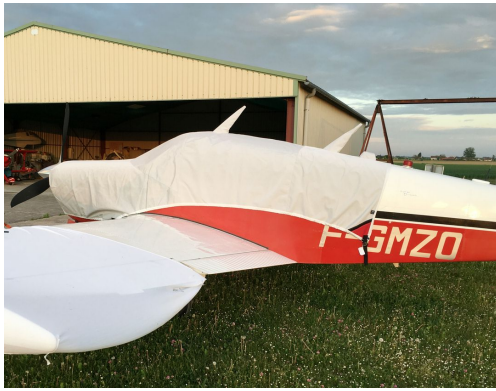
Beech Bonanza/Debonair Canopy/Engine Cover