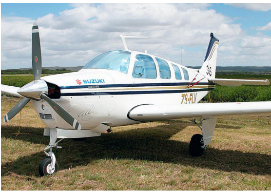
Bonanza A36 HeatShield Set