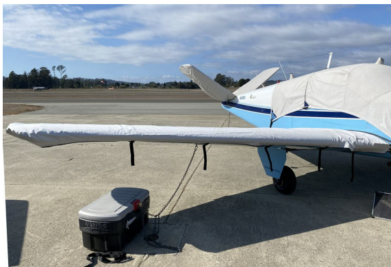
BEECH J35 WING COVERS