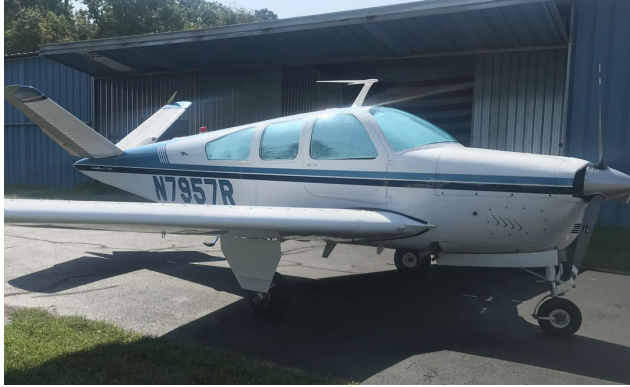
Beechcraft V35A Bonanza Heatshield Set

Windshield Heatshields are interior sunshades for an aircraft's front windshield. The product is a unique composite of closed-cell foam with a silver mylar finish. The semi-rigid design is stiff enough to stand along the inside of the windshield using sun visors or window framing. It folds up flat and easily stores in the included storage sleeve. Some designs may require velcro and suction cups or split right and left sides. A Heatshield is an excellent short-term remedy for cockpit overheating. An external fabric cover is far more effective and practical for long-term protection.