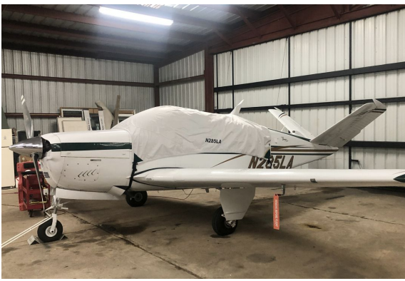
Beech Bonanza V35B Canopy Cover