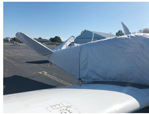
Beech Bonanza V35S Extended Canopy/Engine/Empennage Cover