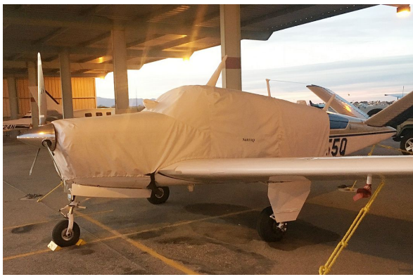
Beech Bonanza Extended Canopy/Engine Cover