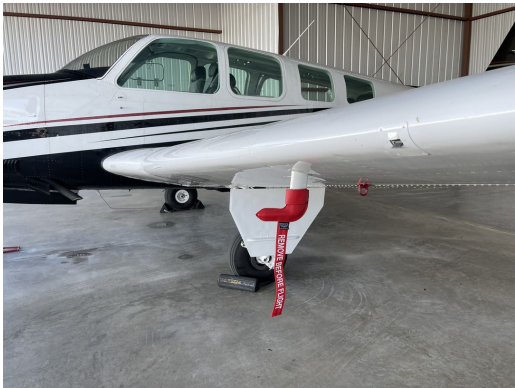
Beech Bonanza Pitot Cover