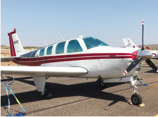
Beech A-36 Bonanza Cabin HeatShields

Windshield Heatshields are interior sunshades for an aircraft's front windshield. The product is a unique composite of closed-cell foam with a silver mylar finish. The semi-rigid design is stiff enough to stand along the inside of the windshield using sun visors or window framing. It folds up flat and easily stores in the included storage sleeve. Some designs may require velcro and suction cups or split right and left sides. A Heatshield is an excellent short-term remedy for cockpit overheating. An external fabric cover is far more effective and practical for long-term protection.