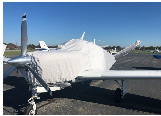
Beech Bonanza V35S Extended Canopy/Engine/Empennage Cover