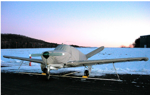
Extended Canopy/Engine Cover, Wing Covers and V-tail Empennage cover

Travel Covers are made with Silver Solution-Dyed Polyester fabric and only lined over the windshield to save weight. The material is lightweight and more compact for easy stowage in the aircraft. The polyester material is water resistant, but only intended for occasional use outside. We also have an ultra lightweight material available for fitted hangar dust covers. For daily outdoor use, the non-travel Sunbrella Cover is the best choice.