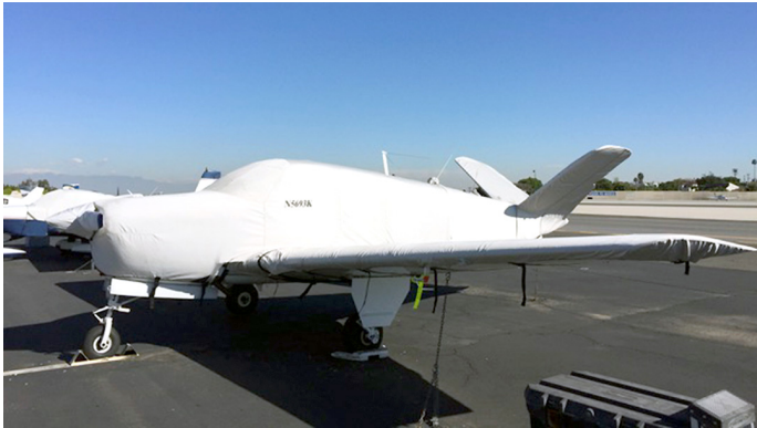
Fully Covered Bonanza S35

This cover type is made from Silver Acrylic Sunbrella canvas and is 100% lined with a soft and smooth microfiber. Bruce's Custom Covers developed this material combination especially for aircraft protection. The outer material is medium weight and treated for water resistance, UV resistance and anti-static buildup. The inner lining is a very soft and smooth microfiber to prevent scratching. The material is very reflective, and tests show that the cabin interior temperature can be reduced to near-ambient temperature on the hottest of days. It is water, ice and snow repellent, yet breathable to allow moisture to escape from between the cover and the aircraft surface.