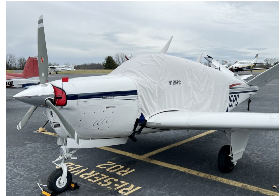
Beech V35B Extended Canopy Cover, Engine Plugs