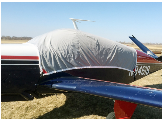
Beech Bonanza/Debonair Travel Cover