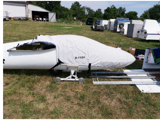
Pilatus B-4 Canopy/Nose Cover