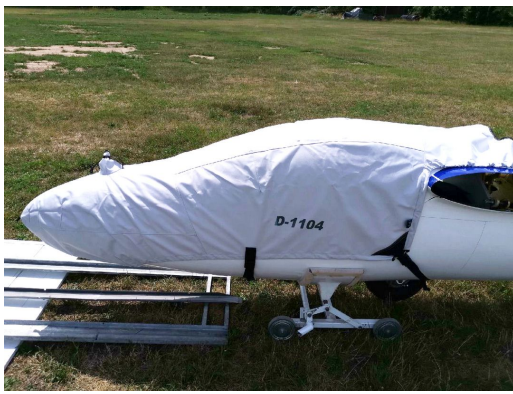
Pilatus B-4 Canopy/Nose Cover