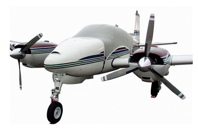
Twin Bonanza Standard Canopy Cover