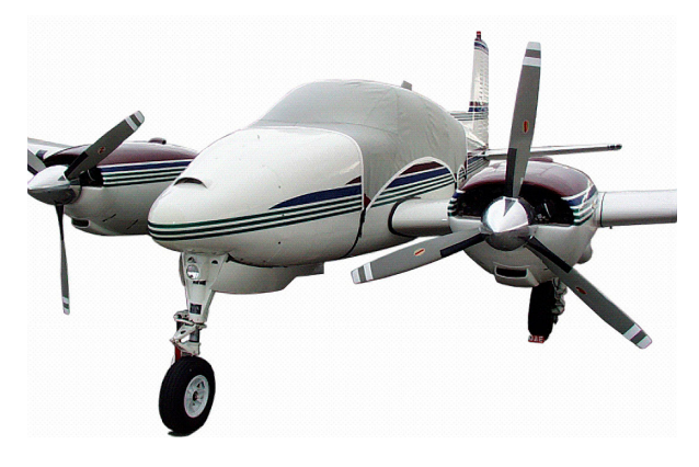
Twin Bonanza Standard Canopy Cover