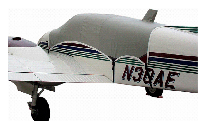
Twin Bonanza Standard Canopy Cover

Travel Covers are made with Silver Solution-Dyed Polyester fabric and only lined over the windshield to save weight. The material is lightweight and more compact for easy stowage in the aircraft. The polyester material is water resistant, but only intended for occasional use outside. We also have an ultra lightweight material available for fitted hangar dust covers. For daily outdoor use, the non-travel Sunbrella Cover is the best choice.