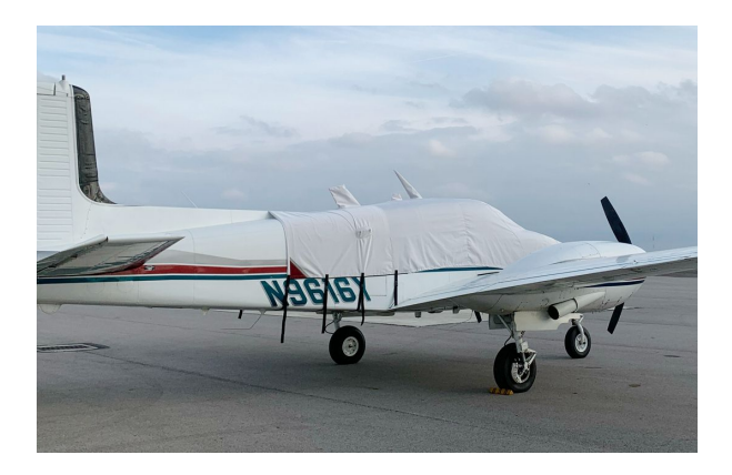
Beech Twin Bonanza Canopy/Nose Cover

This cover type is made from Silver Acrylic Sunbrella canvas and is 100% lined with a soft and smooth microfiber. Bruce's Custom Covers developed this material combination especially for aircraft protection. The outer material is medium weight and treated for water resistance, UV resistance and anti-static buildup. The inner lining is a very soft and smooth microfiber to prevent scratching. The material is very reflective, and tests show that the cabin interior temperature can be reduced to near-ambient temperature on the hottest of days. It is water, ice and snow repellent, yet breathable to allow moisture to escape from between the cover and the aircraft surface.