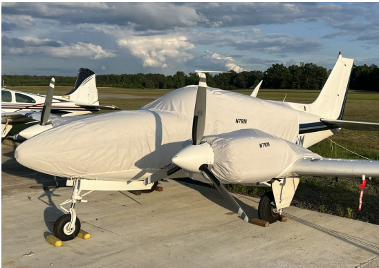
Beech C55 Baron Extended Canopy/Nose Cover, Engine Covers