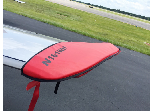
Cirrus SR-20/22 Wingtip Pads