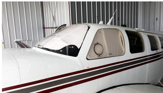
Beech Baron 58P Cockpit Heatshield Set