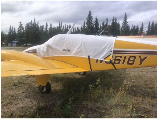
Beech A55 Baron Canopy Cover

water resistance, UV resistance and anti-static buildup. The inner lining is a very soft and smooth microfiber to prevent scratching. The material is very reflective, and tests show that the cabin interior temperature can be reduced to near-ambient temperature on the hottest of days. It is water, ice and snow repellent, yet breathable to allow moisture to escape from between the cover and the aircraft surface.