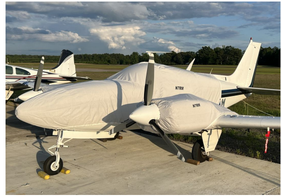
Beech Baron 58, G58 Canopy Cover, Insulated Engine Covers Beech C55 Baron Extended Canopy/Nose Cover, Engine Covers