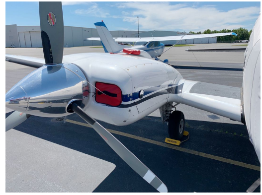
Beech Baron 58 Engine Plugs