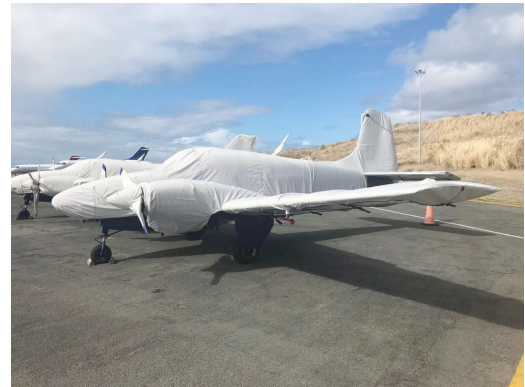
Beech Travel Air Full Cover Set