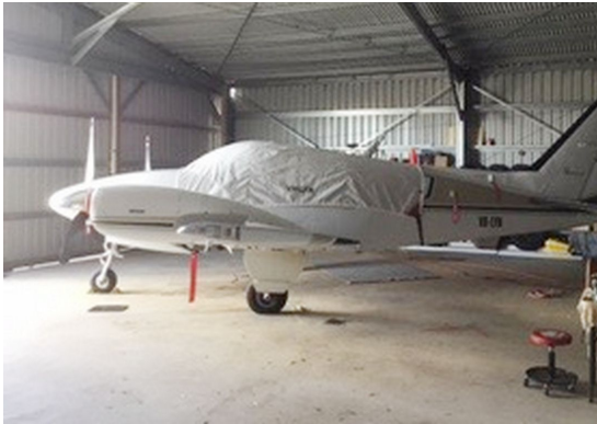
Beech Baron B-55 Canopy Cover