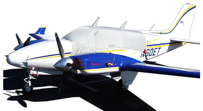
Standard Canopy Cover & Engine Plugs