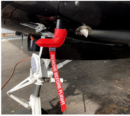
Baron 58 Pitot Cover