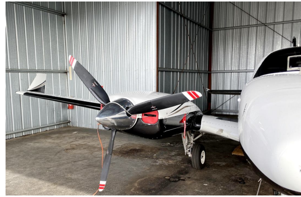
Baron 58 Engine Plugs