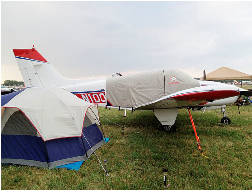
Beech Baron Standard Extended Canopy Cover