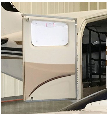
Beech Baron 58 Cabin HeatShield

Windshield Heatshields are interior sunshades for an aircraft's front windshield. The product is a unique composite of closed-cell foam with a silver mylar finish. The semi-rigid design is stiff enough to stand along the inside of the windshield using sun visors or window framing. It folds up flat and easily stores in the included storage sleeve. Some designs may require velcro and suction cups or split right and left sides. A Heatshield is an excellent short-term remedy for cockpit overheating. An external fabric cover is far more effective and practical for long-term protection.