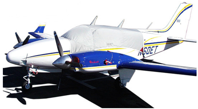
Standard Canopy Cover & Engine Plugs