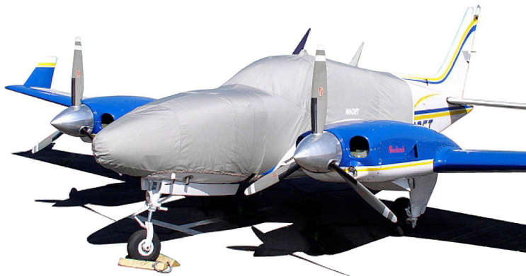
Baron Canopy/Nose Cover

Travel Covers are made with Silver Solution-Dyed Polyester fabric and only lined over the windshield to save weight. The material is lightweight and more compact for easy stowage in the aircraft. The polyester material is water resistant, but only intended for occasional use outside. We also have an ultra lightweight material available for fitted hangar dust covers. For daily outdoor use, the non-travel Sunbrella Cover is the best choice.