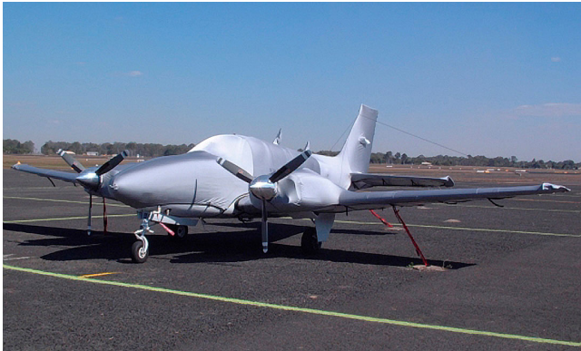
Baron FULL COVER SET, Light Weight Travel &/or Fitted Dust Cover Set

water resistance, UV resistance and anti-static buildup. The inner lining is a very soft and smooth microfiber to prevent scratching. The material is very reflective, and tests show that the cabin interior temperature can be reduced to near-ambient temperature on the hottest of days. It is water, ice and snow repellent, yet breathable to allow moisture to escape from between the cover and the aircraft surface.