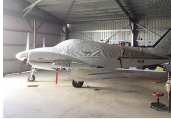
Beech Baron B-55 Canopy Cover