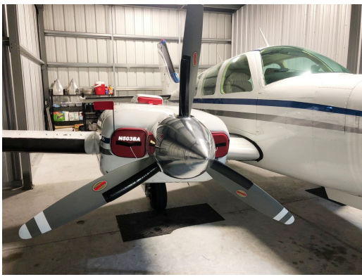
Beech Baron Engine Plugs