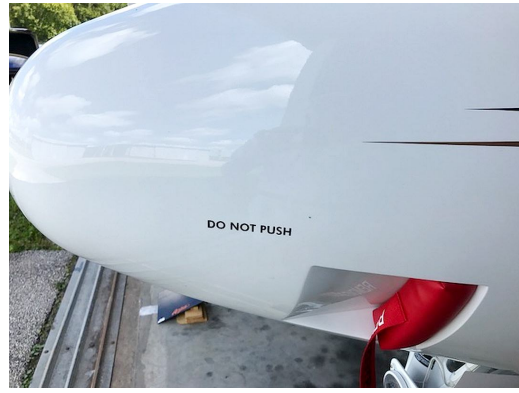
Beech Baron Nose Air Inlet Plugs, set of 2