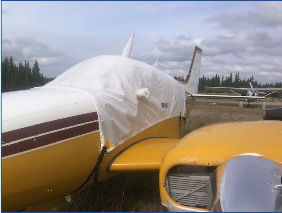
Beech A55 Baron Canopy Cover