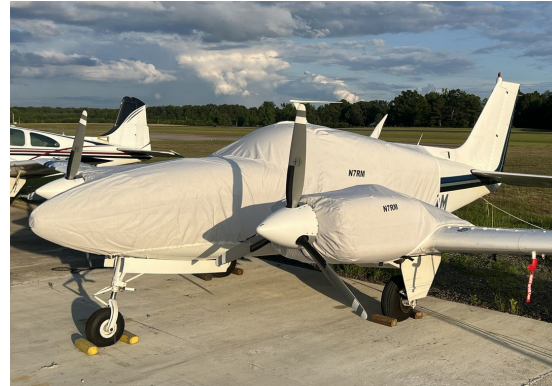
Beech C55 Baron Extended Canopy/Nose Cover, Engine Covers