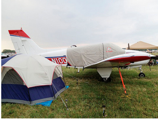
Beech Baron Standard Extended Canopy Cover

water resistance, UV resistance and anti-static buildup. The inner lining is a very soft and smooth microfiber to prevent scratching. The material is very reflective, and tests show that the cabin interior temperature can be reduced to near-ambient temperature on the hottest of days. It is water, ice and snow repellent, yet breathable to allow moisture to escape from between the cover and the aircraft surface.