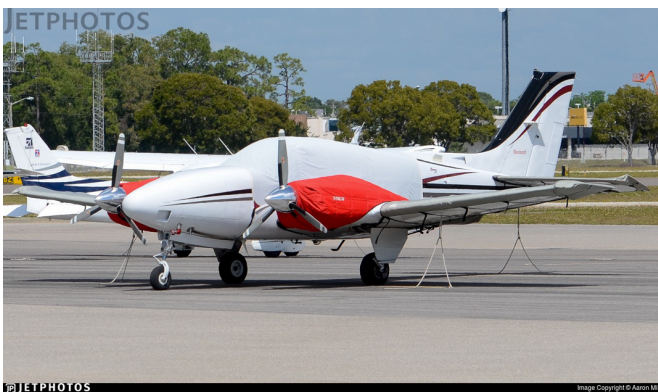
Beech Baron 58, G58 Canopy Cover, Insulated Engine Covers