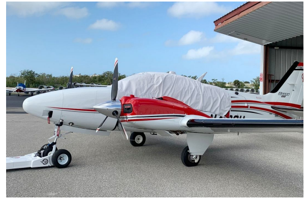
Beech Baron G58 Canopy Cover