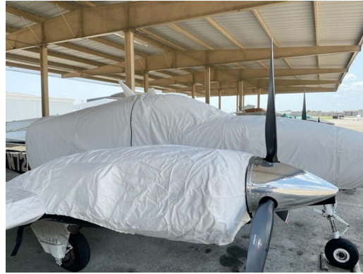
Beech Baron 58P Extended Canopy/Nose Cover, Wing/Engine Covers (test fit)