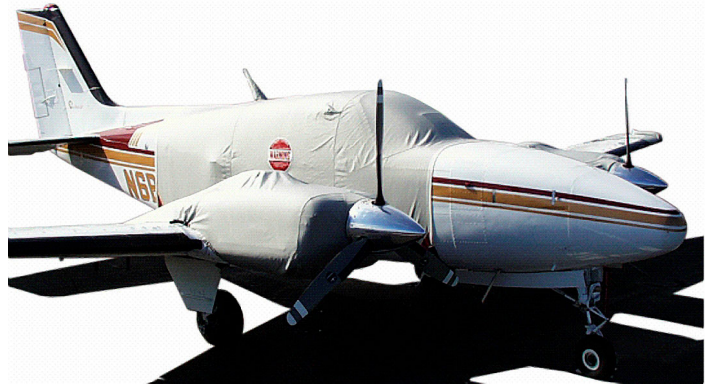
Beech Baron Insulated Engine Cover (3D Model)