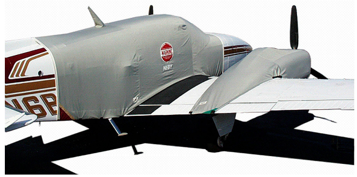
Baron Extended Canopy Cover & Engine Covers