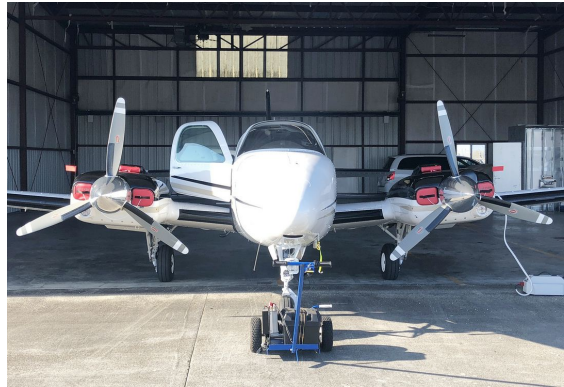
Beech Baron 58 Engine Inlet Plugs