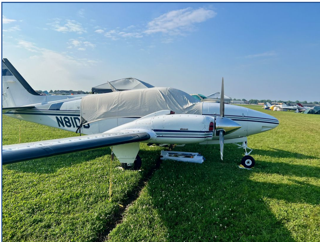
Beech Baron 58 Canopy Cover