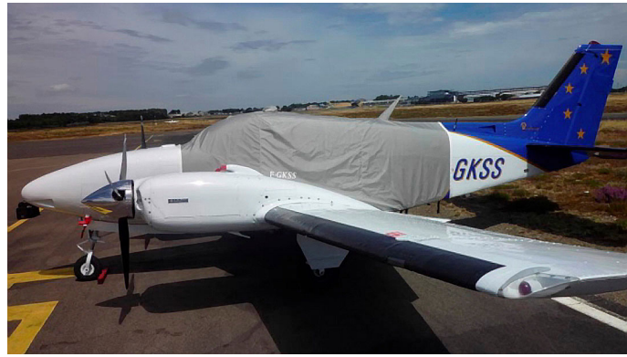
Baron Extended Canopy Cover, Pitot Cover and Cowl Top Plugs