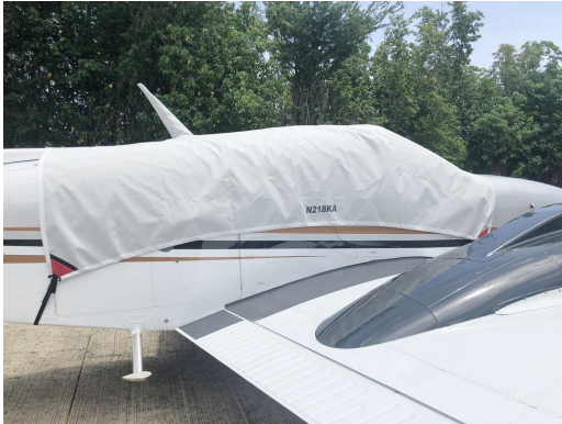
Baron G58 Travel Cover

Travel Covers are made with Silver Solution-Dyed Polyester fabric and only lined over the windshield to save weight. The material is lightweight and more compact for easy stowage in the aircraft. The polyester material is water resistant, but only intended for occasional use outside. We also have an ultra lightweight material available for fitted hangar dust covers. For daily outdoor use, the non-travel Sunbrella Cover is the best choice.