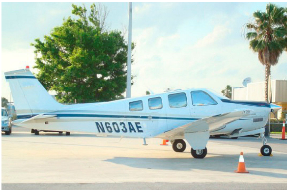
Beech Bonanza Heatshield Set

Windshield Heatshields are interior sunshades for an aircraft's front windshield. The product is a unique composite of closed-cell foam with a silver mylar finish. The semi-rigid design is stiff enough to stand along the inside of the windshield using sun visors or window framing. It folds up flat and easily stores in the included storage sleeve. Some designs may require velcro and suction cups or split right and left sides. A Heatshield is an excellent short-term remedy for cockpit overheating. An external fabric cover is far more effective and practical for long-term protection.