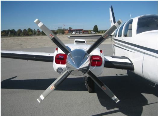
Baron 58 Engine Plugs

Engine Inlet Plugs are custom fit for your Beech Baron 58, G58 intakes, made with heavy-duty vinyl material, and stuffed with a single block of sculpted urethane foam. Each plug has a zipper that allows the foam to be removed and dried if necessary. Engine plugs have warning flags that are visible from the cockpit or 'remove before flight' streamers sewn onto the face of the plugs. Most plugs are imprinted with the aircraft registration number in black for an extra charge. Storage bag NOT included. Engine plugs may be inserted after flight when the engine is still warm. Engine Inlet Plugs are commonly referred to as Cowl Plugs, Intake Plugs, Cowl Blocks, Engine Blocks, and Engine Bungs.