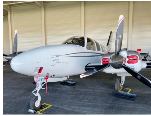
Baron G58 Fresh Air Inlet Plug (on dorsal)