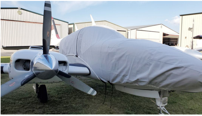
Beech Baron 58 Canopy/Nose Cover