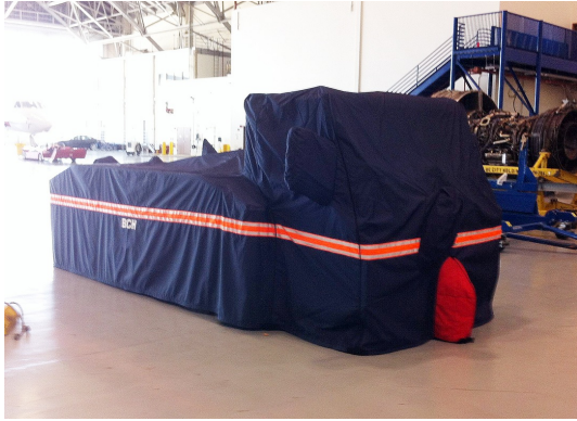
Complete Cover for Eagle Tug