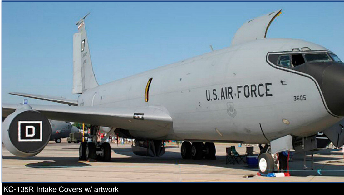
KC-135R Intake Covers w/ artwork