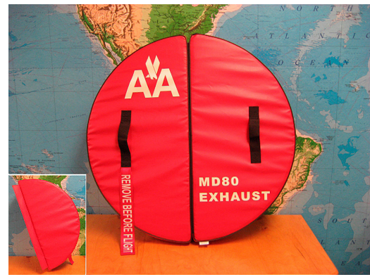
MD-80 Exhaust Plug, folding type