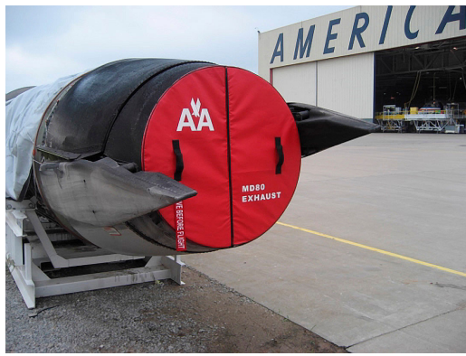
MD80 JT8D Exhaust Plug, Folding Type