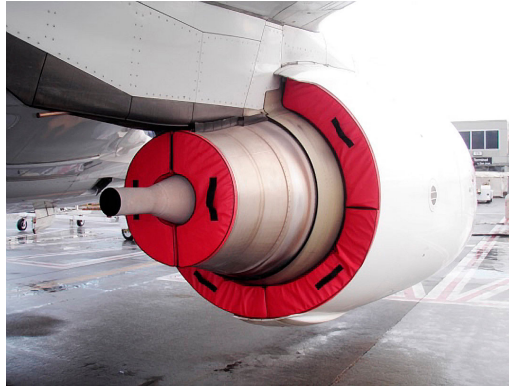
Boeing 737 NG Exhaust Plug Set, Folding Donut Ring Type

warm. Engine Inlet Plugs are commonly referred to as Cowl Plugs, Intake Plugs, Cowl Blocks, Engine Blocks, and Engine Bungs.