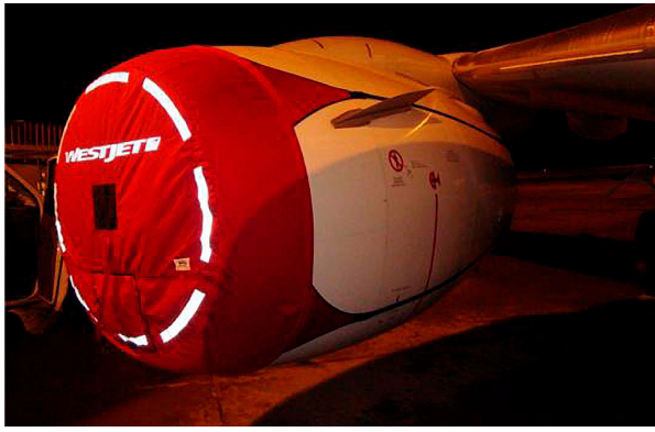
Boeing 737 CFM-56 Universal-fit Classic & NG Intake Cover