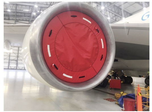
Boeing 747 Intake Plug