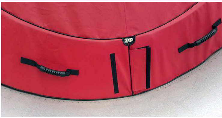
Boeing 747 Intake Plugs, Genx Engines, Framed Bi-Fold Type