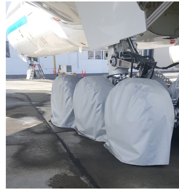
Boeing 777 Main & Nose Gear Tire Covers