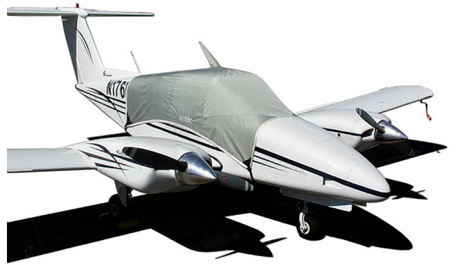
Duchess Standard Canopy Cover