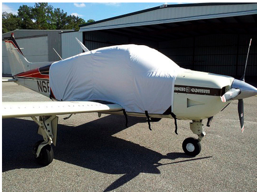
Beech Sport Extended Canopy Cover

This cover type is made from Silver Acrylic Sunbrella canvas and is 100% lined with a soft and smooth microfiber. Bruce's Custom Covers developed this material combination especially for aircraft protection. The outer material is medium weight and treated for water resistance, UV resistance and anti-static buildup. The inner lining is a very soft and smooth microfiber to prevent scratching. The material is very reflective, and tests show that the cabin interior temperature can be reduced to near-ambient temperature on the hottest of days. It is water, ice and snow repellent, yet breathable to allow moisture to escape from between the cover and the aircraft surface.