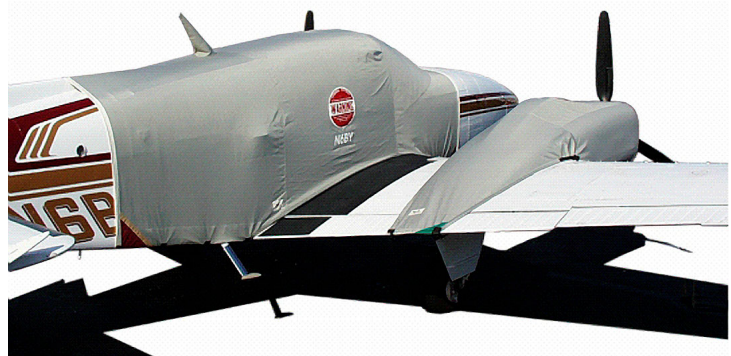
Baron Extended Canopy Cover & Engine Covers