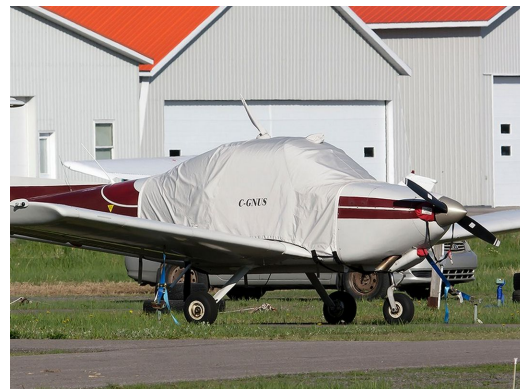
Beech B77 Skipper Extended Canopy Cover