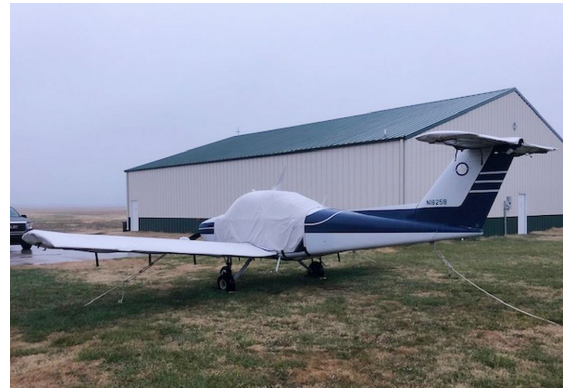
Beech Skipper Extended Canopy Cover, Wing & Horiz. Stab. Covers