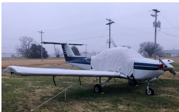
Beech Skipper Extended Canopy Cover, Wing & Horiz. Stab. Covers

WINTER USE MATERIAL - Made with Solution-Dyed Polyester fabric, this option is intended for seasonal use to aid in deicing, rain mitigation, or for occasional travel. The material is lighter and more compact, but more susceptible to UV damage and may have a shorter useful life if used continuously outside than the all-year use material.