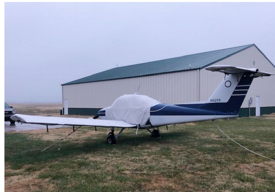
Beech Skipper Extended Canopy Cover, Wing & Horiz. Stab. Covers