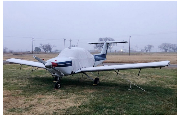
Beech Skipper Extended Canopy Cover, Wing & Horiz. Stab. Covers