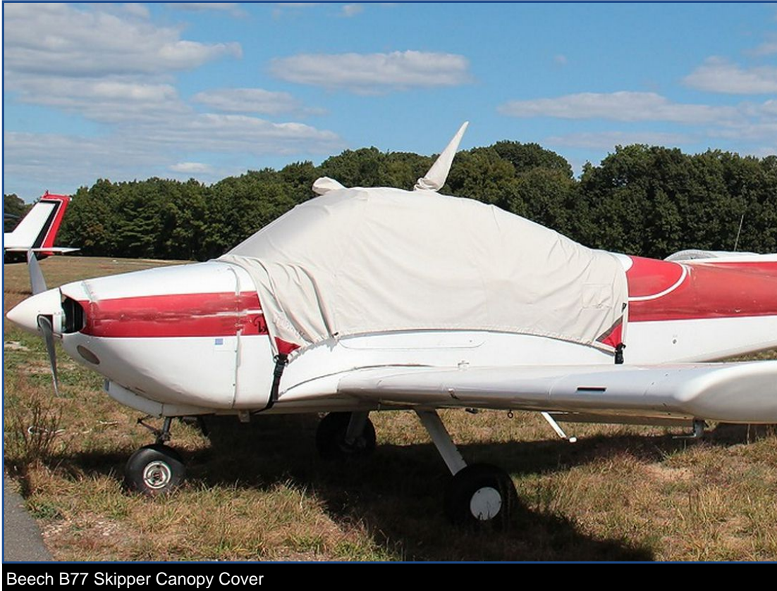
Beech B77 Skipper Canopy Cover