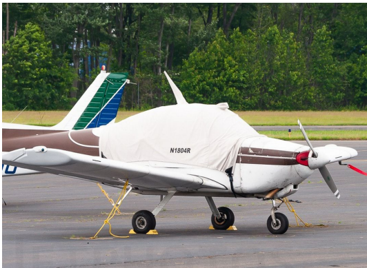
Beech B77 Skipper Canopy Cover

This cover type is made from Silver Acrylic Sunbrella canvas and is 100% lined with a soft and smooth microfiber. Bruce's Custom Covers developed this material combination especially for aircraft protection. The outer material is medium weight and treated for water resistance, UV resistance and anti-static buildup. The inner lining is a very soft and smooth microfiber to prevent scratching. The material is very reflective, and tests show that the cabin interior temperature can be reduced to near-ambient temperature on the hottest of days. It is water, ice and snow repellent, yet breathable to allow moisture to escape from between the cover and the aircraft surface.