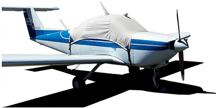
Canopy Cover for Beech Skipper

Travel Covers are made with Silver Solution-Dyed Polyester fabric and only lined over the windshield to save weight. The material is lightweight and more compact for easy stowage in the aircraft. The polyester material is water resistant, but only intended for occasional use outside. We also have an ultra lightweight material available for fitted hangar dust covers. For daily outdoor use, the non-travel Sunbrella Cover is the best choice.