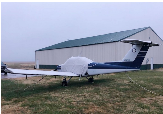
Beech Skipper Extended Canopy Cover, Wing & Horiz. Stab. Covers

This cover type is made from Silver Acrylic Sunbrella canvas and is 100% lined with a soft and smooth microfiber. Bruce's Custom Covers developed this material combination especially for aircraft protection. The outer material is medium weight and treated for water resistance, UV resistance and anti-static buildup. The inner lining is a very soft and smooth microfiber to prevent scratching. The material is very reflective, and tests show that the cabin interior temperature can be reduced to near-ambient temperature on the hottest of days. It is water, ice and snow repellent, yet breathable to allow moisture to escape from between the cover and the aircraft surface.