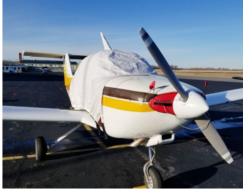
Beech Skipper Extended Canopy Cover and Inlet Plugs

plugs are imprinted with the aircraft registration number in black for an extra charge. Storage bag NOT included. Engine plugs may be inserted after flight when the engine is still warm. Engine Inlet Plugs are commonly referred to as Cowl Plugs, Intake Plugs, Cowl Blocks, Engine Blocks, and Engine Bungs.