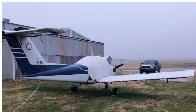
Beech Skipper Extended Canopy Cover, Wing & Horiz. Stab. Covers