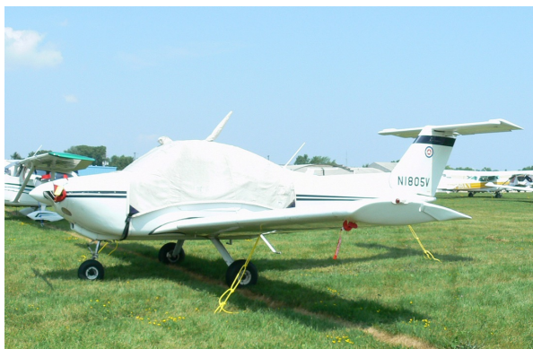
Beech Skipper Canopy Cover, Engine Plugs

Travel Covers are made with Silver Solution-Dyed Polyester fabric and only lined over the windshield to save weight. The material is lightweight and more compact for easy stowage in the aircraft. The polyester material is water resistant, but only intended for occasional use outside. We also have an ultra lightweight material available for fitted hangar dust covers. For daily outdoor use, the non-travel Sunbrella Cover is the best choice.