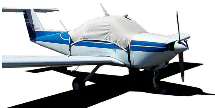
Canopy Cover for Beech Skipper