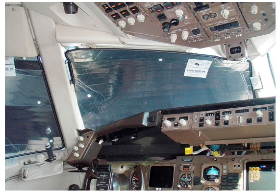
Boeing 767 Cockpit HeatShield set