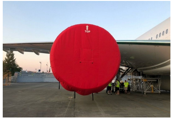
Boeing 777 Intake Covers, GE9X Engine