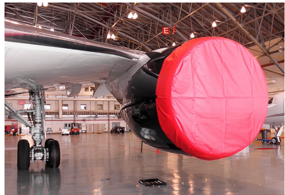
Boeing 767 Intake Covers, P/N: B767-105