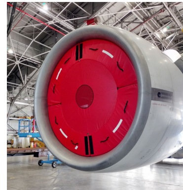
Boeing 777 Intake Plugs, Folding Type