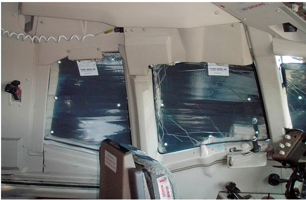
Boeing 767 Cockpit HeatShield set

Cockpit Heatshields are interior sunshades for the aircraft's cockpit. The product is a unique composite of closed-cell foam with a silver mylar finish. The semi-rigid design is stiff enough to stand inside the window framing. The set folds up flat and is easily stored in the included storage sleeve. Some designs may require velcro and suction cups. Our Heatshields for jets are offered white side out because some aircraft manufacturers have issued advisories against reflective window inserts due to potential heat damage. A Heatshield is an excellent short-term remedy for cockpit overheating, but an external fabric cover is more effective for long-term protection.