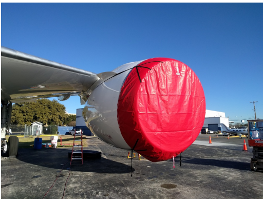
Boeing 787 Intake Cover