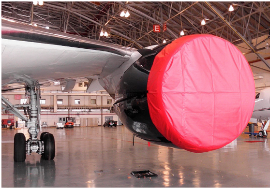
Boeing 767 Intake Covers, P/N: B767-105