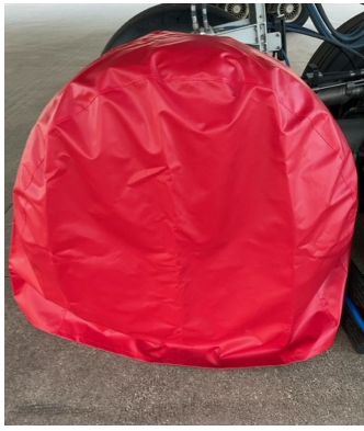
Boeing 777 Main Gear Tire Covers