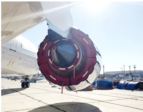
Boeing 787 Dreamliner Bypass Vent, Turbine Exhaust, & Exhaust Nozzle Plugs, Genx Engines