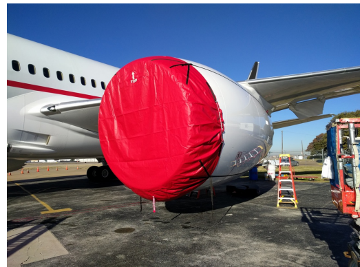
Boeing 787 Intake Cover