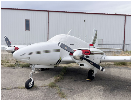
Beech B95 Extended Canopy Cover, Engine Plugs

Engine Inlet Plugs are custom fit for your Beech Travel Air B95 intakes, made with heavy-duty vinyl material, and stuffed with a single block of sculpted urethane foam. Each plug has a zipper that allows the foam to be removed and dried if necessary. Engine plugs have warning flags that are visible from the cockpit or 'remove before flight' streamers sewn onto the face of the plugs. Most plugs are imprinted with the aircraft registration number in black for an extra charge. Storage bag NOT included. Engine plugs may be inserted after flight when the engine is still warm. Engine Inlet Plugs are commonly referred to as Cowl Plugs, Intake Plugs, Cowl Blocks, Engine Blocks, and Engine Bungs.