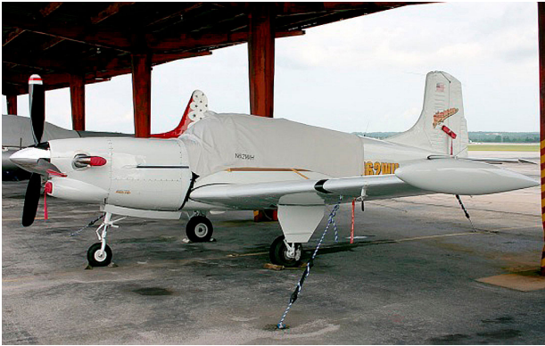
Beech B95 Travel Air Canopy Cover (Turbine Model)