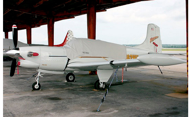
Beech B95 Travel Air Canopy Cover (Turbine Model)