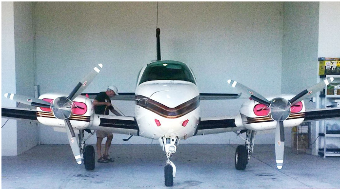
Beech Baron 58 Engine Inlet Plugs, Heater Inlet Plugs