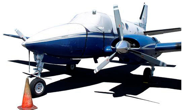
King Air Cockpit Cover, belly-strap type