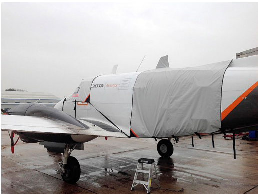
King Air Cargo/Jump Door Rain Cover

This cover type is made from Silver Acrylic Sunbrella canvas and is 100% lined with a soft and smooth microfiber. Bruce's Custom Covers developed this material combination especially for aircraft protection. The outer material is medium weight and treated for water resistance, UV resistance and anti-static buildup. The inner lining is a very soft and smooth microfiber to prevent scratching. The material is very reflective, and tests show that the cabin interior temperature can be reduced to near-ambient temperature on the hottest of days. It is water, ice and snow repellent, yet breathable to allow moisture to escape from between the cover and the aircraft surface.