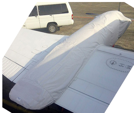
King Air 350 Engine Cover