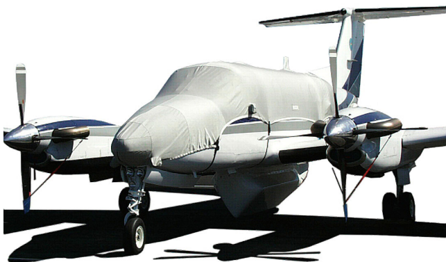
King Air Canopy/Nose Cover

This cover type is made from Silver Acrylic Sunbrella canvas and is 100% lined with a soft and smooth microfiber. Bruce's Custom Covers developed this material combination especially for aircraft protection. The outer material is medium weight and treated for water resistance, UV resistance and anti-static buildup. The inner lining is a very soft and smooth microfiber to prevent scratching. The material is very reflective, and tests show that the cabin interior temperature can be reduced to near-ambient temperature on the hottest of days. It is water, ice and snow repellent, yet breathable to allow moisture to escape from between the cover and the aircraft surface.