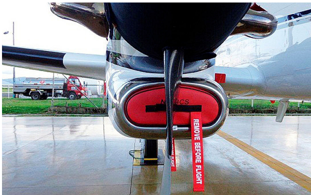
Beech King Air C90B Main Engine Inlet Plug

Engine Inlet Plugs are custom fit for your Beech 99 Airliner intakes, made with heavy-duty vinyl material, and stuffed with a single block of sculpted urethane foam. Each plug has a zipper that allows the foam to be removed and dried if necessary. Engine plugs have warning flags that are visible from the cockpit or 'remove before flight' streamers sewn onto the face of the plugs. Most plugs are imprinted with the aircraft registration number in black for an extra charge. Storage bag NOT included. Engine plugs may be inserted after flight when the engine is still warm. Engine Inlet Plugs are commonly referred to as Cowl Plugs, Intake Plugs, Cowl Blocks, Engine Blocks, and Engine Bungs.