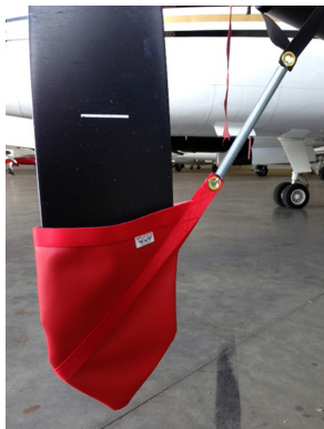
King Air Prop Tie

This cover type is made from Silver Acrylic Sunbrella canvas and is 100% lined with a soft and smooth microfiber. Bruce's Custom Covers developed this material combination especially for aircraft protection. The outer material is medium weight and treated for water resistance, UV resistance and anti-static buildup. The inner lining is a very soft and smooth microfiber to prevent scratching. The material is very reflective, and tests show that the cabin interior temperature can be reduced to near-ambient temperature on the hottest of days. It is water, ice and snow repellent, yet breathable to allow moisture to escape from between the cover and the aircraft surface.