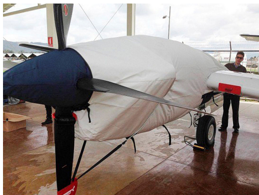
King Air C90 Engine Cover

This cover type is made from Silver Acrylic Sunbrella canvas and is 100% lined with a soft and smooth microfiber. Bruce's Custom Covers developed this material combination especially for aircraft protection. The outer material is medium weight and treated for water resistance, UV resistance and anti-static buildup. The inner lining is a very soft and smooth microfiber to prevent scratching. The material is very reflective, and tests show that the cabin interior temperature can be reduced to near-ambient temperature on the hottest of days. It is water, ice and snow repellent, yet breathable to allow moisture to escape from between the cover and the aircraft surface.