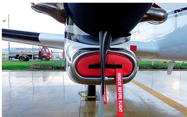
Beech King Air C90B Main Engine Inlet Plug