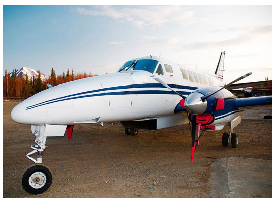
Beech 99 Engine Plugs & Prop Ties

Engine Inlet Plugs are custom fit for your Beech 99 Airliner intakes, made with heavy-duty vinyl material, and stuffed with a single block of sculpted urethane foam. Each plug has a zipper that allows the foam to be removed and dried if necessary. Engine plugs have warning flags that are visible from the cockpit or 'remove before flight' streamers sewn onto the face of the plugs. Most plugs are imprinted with the aircraft registration number in black for an extra charge. Storage bag NOT included. Engine plugs may be inserted after flight when the engine is still warm. Engine Inlet Plugs are commonly referred to as Cowl Plugs, Intake Plugs, Cowl Blocks, Engine Blocks, and Engine Bungs.