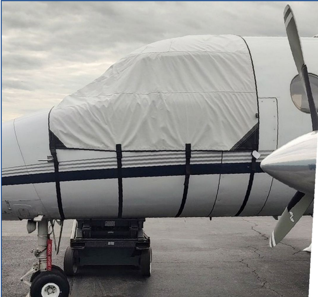
British Aerospace Jetstream 31 Cockpit Cover