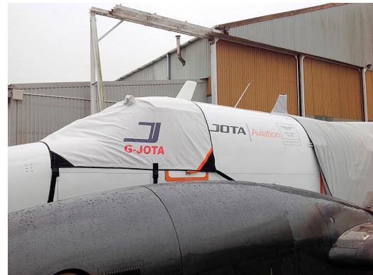
King Air Windshield/Cockpit Cover