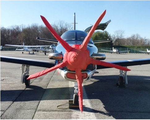
Socata TBM Insulated 5-Blade Prop/Spinner Cover

This cover type is made from Silver Acrylic Sunbrella canvas and is 100% lined with a soft and smooth microfiber. Bruce's Custom Covers developed this material combination especially for aircraft protection. The outer material is medium weight and treated for water resistance, UV resistance and anti-static buildup. The inner lining is a very soft and smooth microfiber to prevent scratching. The material is very reflective, and tests show that the cabin interior temperature can be reduced to near-ambient temperature on the hottest of days. It is water, ice and snow repellent, yet breathable to allow moisture to escape from between the cover and the aircraft surface.