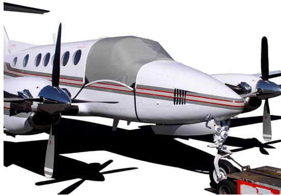
King Air 200/300 Snap-On Windshield Cover

This cover type is made from Silver Acrylic Sunbrella canvas and is 100% lined with a soft and smooth microfiber. Bruce's Custom Covers developed this material combination especially for aircraft protection. The outer material is medium weight and treated for water resistance, UV resistance and anti-static buildup. The inner lining is a very soft and smooth microfiber to prevent scratching. The material is very reflective, and tests show that the cabin interior temperature can be reduced to near-ambient temperature on the hottest of days. It is water, ice and snow repellent, yet breathable to allow moisture to escape from between the cover and the aircraft surface.