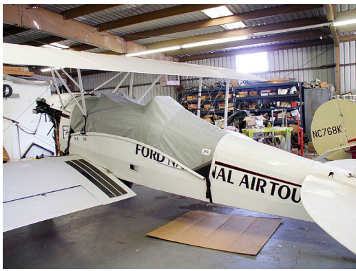
Fairchild KR-34 Canopy Cover