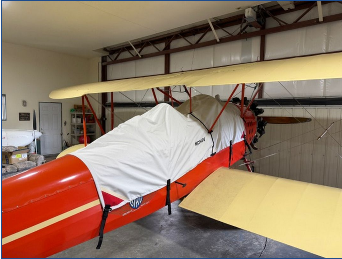
Perth Amboy Brunner Winkle Bird Canopy Cover