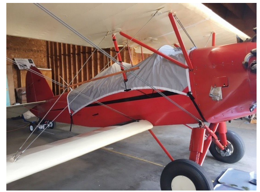
Bird BK Travel Canopy Cover