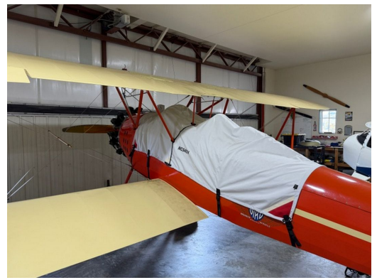
Perth Amboy Brunner Winkle Bird Canopy Cover