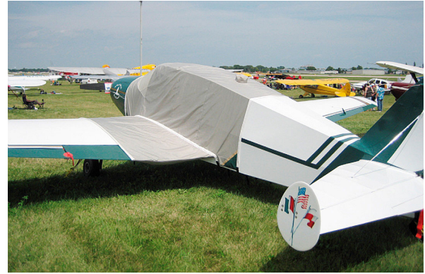
Extended Canopy Cover with Wing Extensions