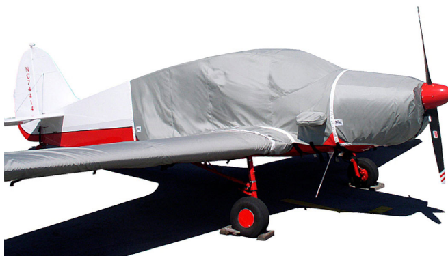
Bellanca Cruisemaster Insulated Engine Cover