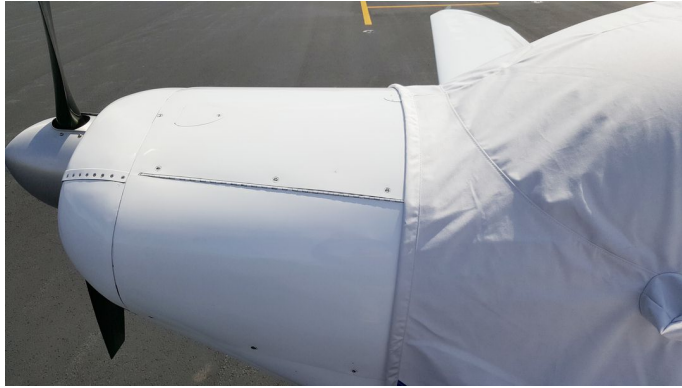
Bellanca Cruisemaster Extended Canopy Cover with 36" Wing Extensions.

This cover type is made from Silver Acrylic Sunbrella canvas and is 100% lined with a soft and smooth microfiber. Bruce's Custom Covers developed this material combination especially for aircraft protection. The outer material is medium weight and treated for water resistance, UV resistance and anti-static buildup. The inner lining is a very soft and smooth microfiber to prevent scratching. The material is very reflective, and tests show that the cabin interior temperature can be reduced to near-ambient temperature on the hottest of days. It is water, ice and snow repellent, yet breathable to allow moisture to escape from between the cover and the aircraft surface.