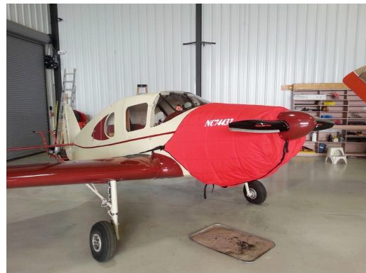
Bellanca Cruisemaster Insulated Engine Cover