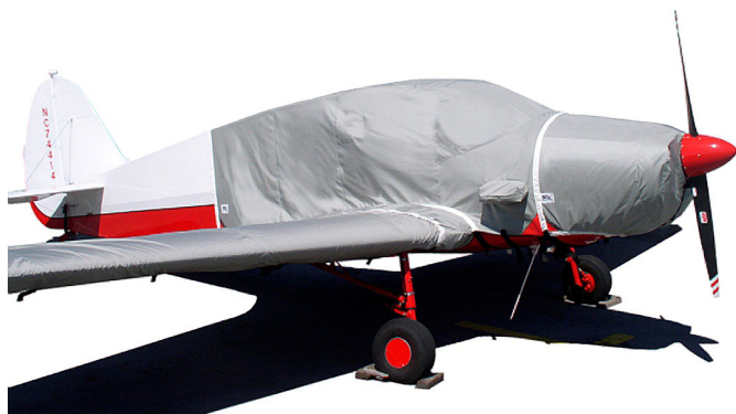
Extended Canopy Cover w/12" Wing Extensions, Engine & Wing Covers

This cover type is made from Silver Acrylic Sunbrella canvas and is 100% lined with a soft and smooth microfiber. Bruce's Custom Covers developed this material combination especially for aircraft protection. The outer material is medium weight and treated for water resistance, UV resistance and anti-static buildup. The inner lining is a very soft and smooth microfiber to prevent scratching. The material is very reflective, and tests show that the cabin interior temperature can be reduced to near-ambient temperature on the hottest of days. It is water, ice and snow repellent, yet breathable to allow moisture to escape from between the cover and the aircraft surface.