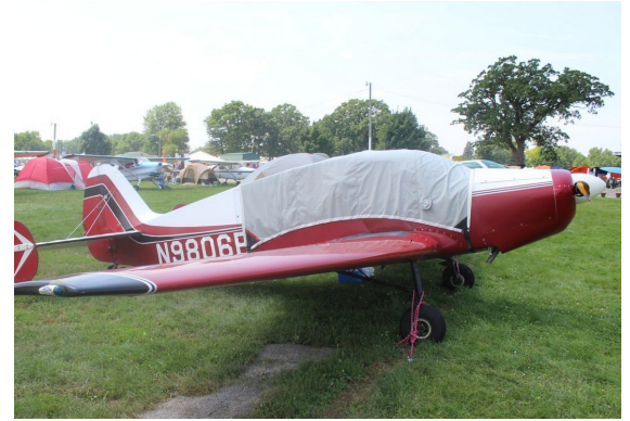
Bellanca Cruisemaster Canopy Cover