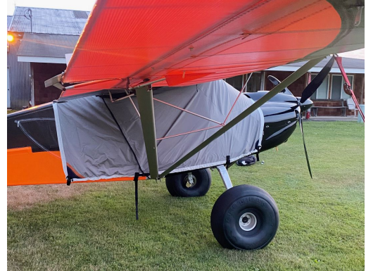
Skyreach Bushcat Travel Weight Canopy Cover