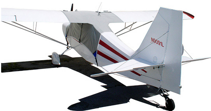
Bellanca Citabria Over-Top Canopy, extended to cover gas caps

This cover type is made from Silver Acrylic Sunbrella canvas and is 100% lined with a soft and smooth microfiber. Bruce's Custom Covers developed this material combination especially for aircraft protection. The outer material is medium weight and treated for water resistance, UV resistance and anti-static buildup. The inner lining is a very soft and smooth microfiber to prevent scratching. The material is very reflective, and tests show that the cabin interior temperature can be reduced to near-ambient temperature on the hottest of days. It is water, ice and snow repellent, yet breathable to allow moisture to escape from between the cover and the aircraft surface.