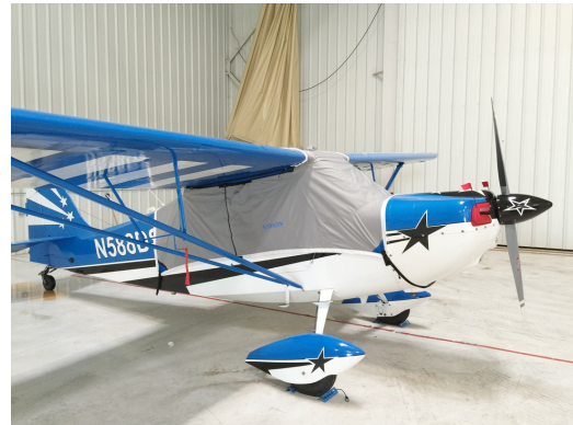
Bellanca Citabria Light Weight Travel Cover, Engine Plugs