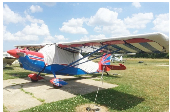
Bellanca Decathlon Canopy Cover (Over-Top, Extended to tail), Wing Covers, Engine Plugs