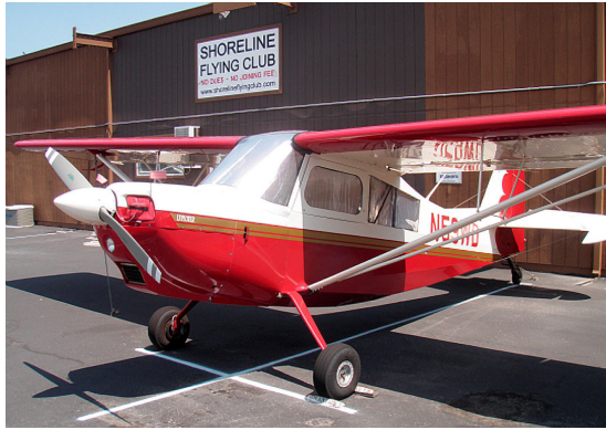
Bellanca Citabria Cabin HeatShield Set

foam with a silver mylar finish. The semi-rigid design is stiff enough to stand along the inside of the windshield using sun visors or window framing. It folds up flat and easily stores in the included storage sleeve. Some designs may require velcro and suction cups or split right and left sides. A Heatshield is an excellent short-term remedy for cockpit overheating. An external fabric cover is far more effective and practical for long-term protection.