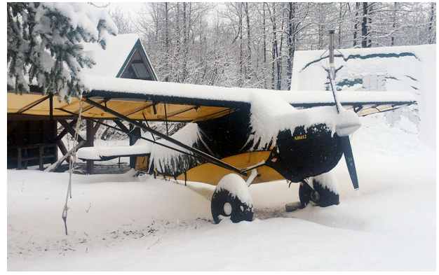
Bellanca 7GCBC Winter Use Cover Set