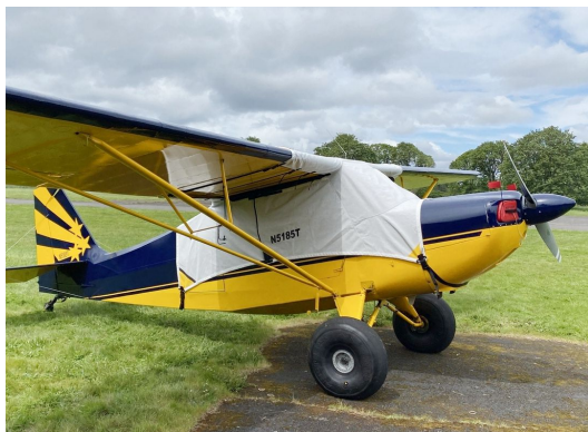
American Champion Citabria canopy cover over the top style, extends to cover gas caps, Engine Plugs

Engine Inlet Plugs are custom fit for your Bellanca (American Champion) Decathlon intakes, made with heavy-duty vinyl material, and stuffed with a single block of sculpted urethane foam. Each plug has a zipper that allows the foam to be removed and dried if necessary. Engine plugs have warning flags that are visible from the cockpit or 'remove before flight' streamers sewn onto the face of the plugs. Most plugs are imprinted with the aircraft registration number in black for an extra charge. Storage bag NOT included. Engine plugs may be inserted after flight when the engine is still warm. Engine Inlet Plugs are commonly referred to as Cowl Plugs, Intake Plugs, Cowl Blocks, Engine Blocks, and Engine Bungs.