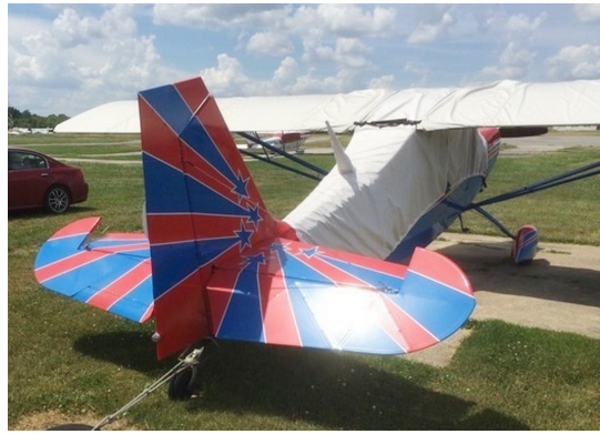
Bellanca Decathlon Canopy Cover (extended aft), Engine & Wing Covers