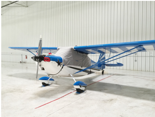
Bellanca Citabria Light Weight Travel Cover, Engine Plugs

This cover type is made from Silver Acrylic Sunbrella canvas and is 100% lined with a soft and smooth microfiber. Bruce's Custom Covers developed this material combination especially for aircraft protection. The outer material is medium weight and treated for water resistance, UV resistance and anti-static buildup. The inner lining is a very soft and smooth microfiber to prevent scratching. The material is very reflective, and tests show that the cabin interior temperature can be reduced to near-ambient temperature on the hottest of days. It is water, ice and snow repellent, yet breathable to allow moisture to escape from between the cover and the aircraft surface.