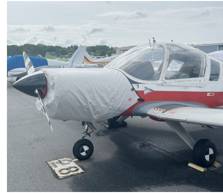
Scottish Aviation Bulldog Engine Cover