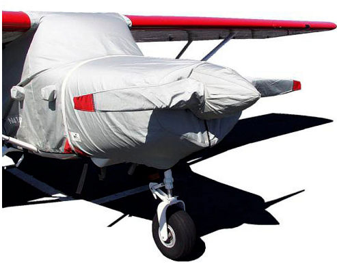
Maule M-7 Prop, Engine, Extended Canopy Covers