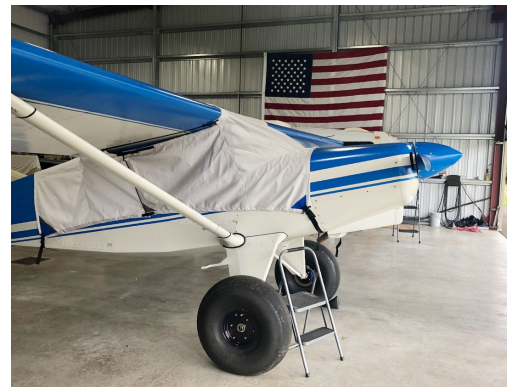
Bearhawk 2-Place Model Canopy Cover