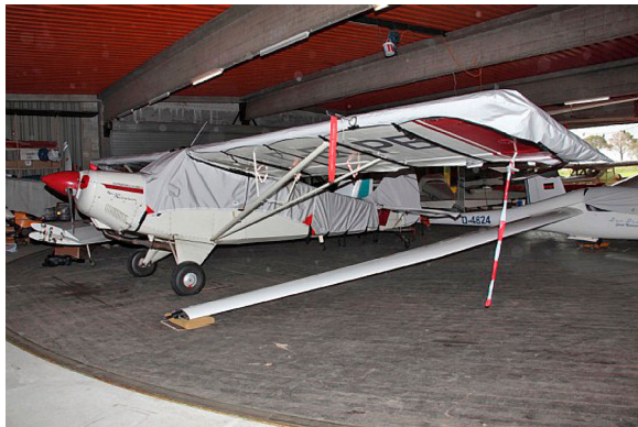
Aviat Husky Engine Plugs, Canopy, Wing & Empennage Covers

WINTER USE MATERIAL - Made with Solution-Dyed Polyester fabric, this option is intended for seasonal use to aid in deicing, rain mitigation, or for occasional travel. The material is lighter and more compact, but more susceptible to UV damage and may have a shorter useful life if used continuously outside than the all-year use material.