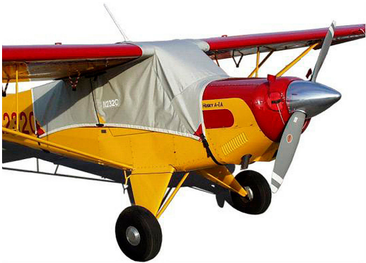
Aviat Husky Canopy Cover & Engine Plugs

This cover type is made from Silver Acrylic Sunbrella canvas and is 100% lined with a soft and smooth microfiber. Bruce's Custom Covers developed this material combination especially for aircraft protection. The outer material is medium weight and treated for water resistance, UV resistance and anti-static buildup. The inner lining is a very soft and smooth microfiber to prevent scratching. The material is very reflective, and tests show that the cabin interior temperature can be reduced to near-ambient temperature on the hottest of days. It is water, ice and snow repellent, yet breathable to allow moisture to escape from between the cover and the aircraft surface.