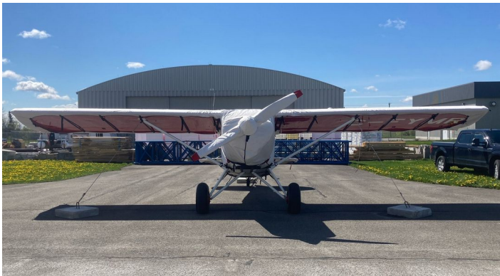
Bearhawk 4-Place Complete Cover Set