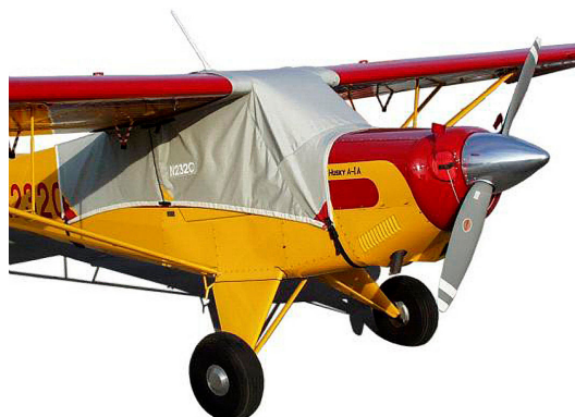
Aviat Husky Canopy Cover & Engine Plugs