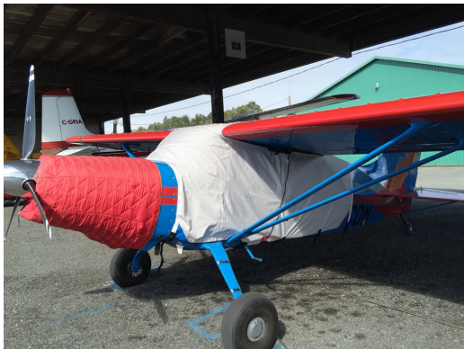
Maule Over-Top Extended Canopy Cover