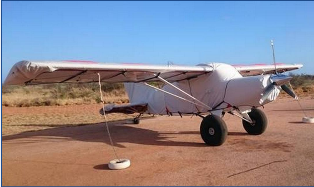
Maule M7-235 Extended Canopy, Wing, Engine &amp; Empennage Covers