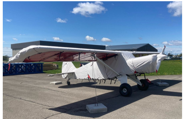
Bearhawk 4-Place Complete Cover Set, AFTER