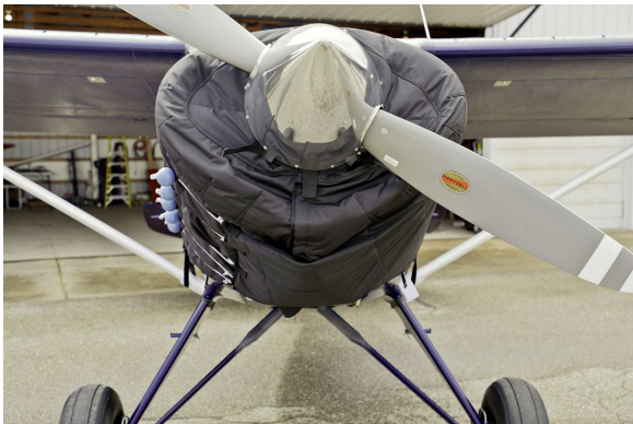
Bearhawk Insulated Engine Cover