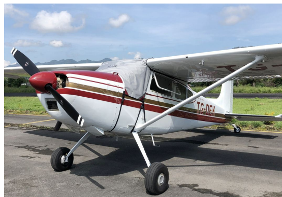
Cessna 180 Windshield Cover