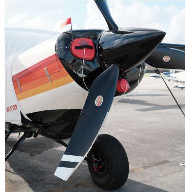
Bearhawk Model 5 Engine Inlet Plugs