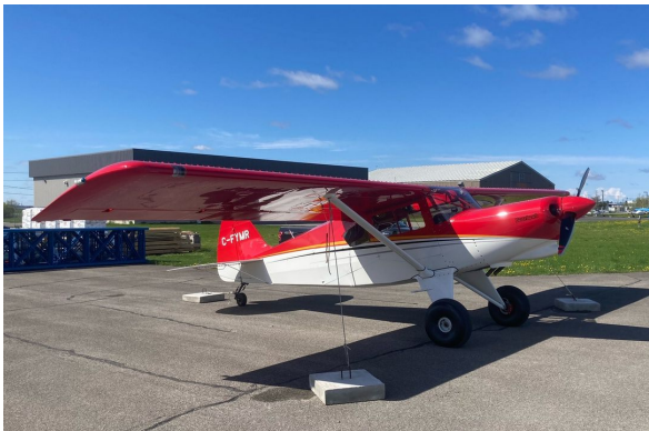
Bearhawk 4-Place Complete Cover Set, BEFORE

This cover type is made from Silver Acrylic Sunbrella canvas and is 100% lined with a soft and smooth microfiber. Bruce's Custom Covers developed this material combination especially for aircraft protection. The outer material is medium weight and treated for water resistance, UV resistance and anti-static buildup. The inner lining is a very soft and smooth microfiber to prevent scratching. The material is very reflective, and tests show that the cabin interior temperature can be reduced to near-ambient temperature on the hottest of days. It is water, ice and snow repellent, yet breathable to allow moisture to escape from between the cover and the aircraft surface.