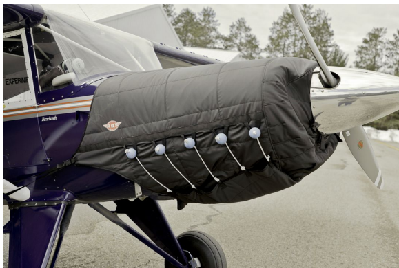
Bearhawk Insulated Engine Cover

This cover type is made from Silver Acrylic Sunbrella canvas and is 100% lined with a soft and smooth microfiber. Bruce's Custom Covers developed this material combination especially for aircraft protection. The outer material is medium weight and treated for water resistance, UV resistance and anti-static buildup. The inner lining is a very soft and smooth microfiber to prevent scratching. The material is very reflective, and tests show that the cabin interior temperature can be reduced to near-ambient temperature on the hottest of days. It is water, ice and snow repellent, yet breathable to allow moisture to escape from between the cover and the aircraft surface.