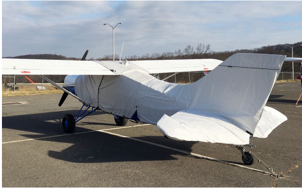
Maule M-5-235C Extended Canopy Cover, Empennage Cover

This cover type is made from Silver Acrylic Sunbrella canvas and is 100% lined with a soft and smooth microfiber. Bruce's Custom Covers developed this material combination especially for aircraft protection. The outer material is medium weight and treated for water resistance, UV resistance and anti-static buildup. The inner lining is a very soft and smooth microfiber to prevent scratching. The material is very reflective, and tests show that the cabin interior temperature can be reduced to near-ambient temperature on the hottest of days. It is water, ice and snow repellent, yet breathable to allow moisture to escape from between the cover and the aircraft surface.