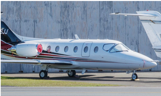
Beechjet Engine Plugs and Cockpit Heatshields

Cockpit Heatshields are interior sunshades for the aircraft's cockpit. The product is a unique composite of closed-cell foam with a silver mylar finish. The semi-rigid design is stiff enough to stand inside the window framing. The set folds up flat and is easily stored in the included storage sleeve. Some designs may require velcro and suction cups. Our Heatshields for jets are offered white side out because some aircraft manufacturers have issued advisories against reflective window inserts due to potential heat damage. A Heatshield is an excellent short-term remedy for cockpit overheating, but an external fabric cover is more effective for long-term protection.