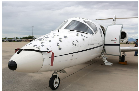
Raytheon Beechjet Hail Damage, and Pitot Covers