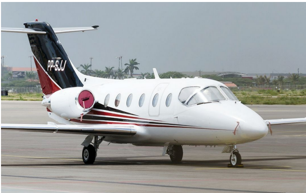
Beechjet Engine Plugs and Cockpit Heatshields