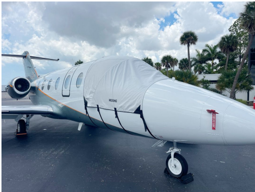
Beechjet 400A Cockpit Cover

This cover type is made from Silver Acrylic Sunbrella canvas and is 100% lined with a soft and smooth microfiber. Bruce's Custom Covers developed this material combination especially for aircraft protection. The outer material is medium weight and treated for water resistance, UV resistance and anti-static buildup. The inner lining is a very soft and smooth microfiber to prevent scratching. The material is very reflective, and tests show that the cabin interior temperature can be reduced to near-ambient temperature on the hottest of days. It is water, ice and snow repellent, yet breathable to allow moisture to escape from between the cover and the aircraft surface.