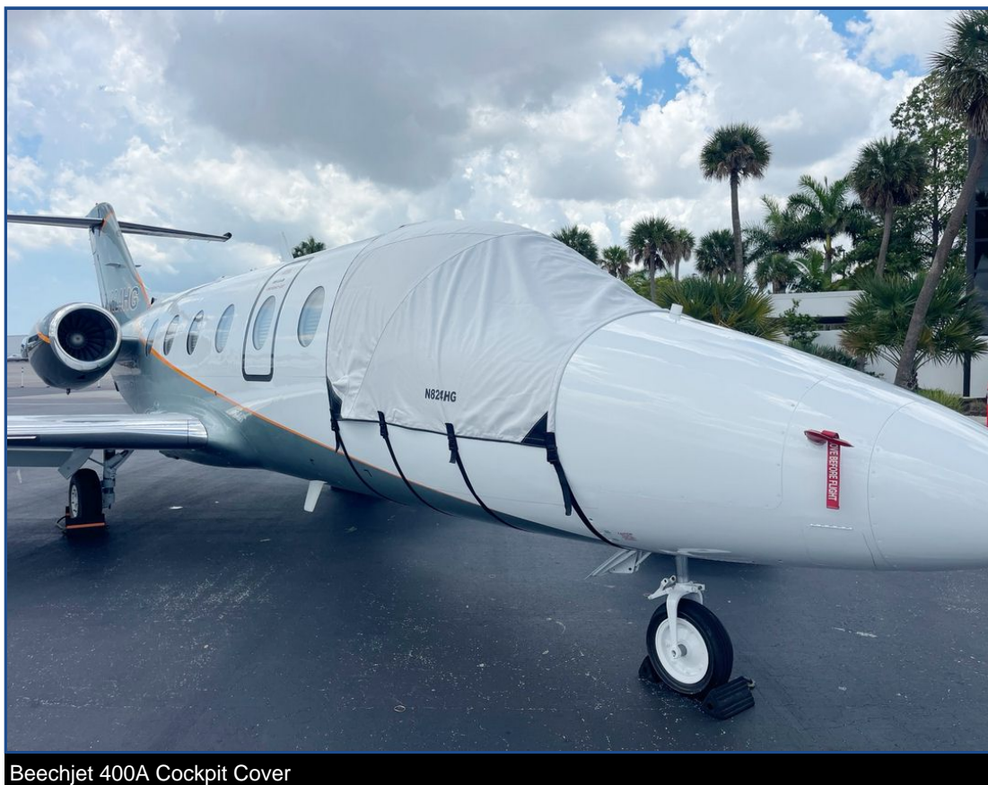
Beechjet 400A Cockpit Cover