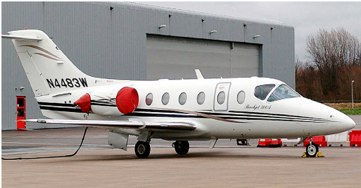
Beechjet 400 Engine Covers