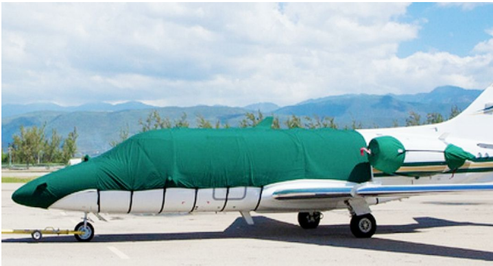
Raytheon Beechjet 400 Fuselage/Nose Cover, Engine Covers