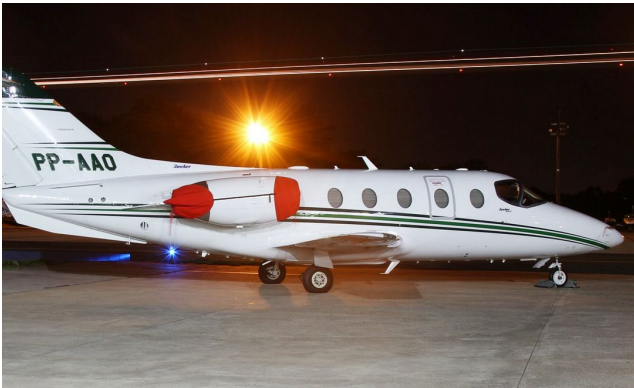
Beechjet 400 Engine Covers

The Hawker Beechcraft Beechjet 400, Hawker 400XP (T1A, T400 Jayhawk) Intake Covers are designed to install easily yet be completely storable. A spring steel hoop is sewn into the hem of each cover, allowing them to be installed without climbing onto the wing or using a stepladder. To store the covers the spring steel hoop folds like a band-saw blade into three nesting rings. Each cover folds into a compact circular bundle which is stored in the included duffle bag, yet they unfold quickly for use. The Tri-Fold Ring cover is made of medium weight nylon which is available in a variety of colors to match the paint trim. Each cover set comes complete with installation and folding instructions. The aircraft's registration number can be silkscreened onto the cover for an extra charge.