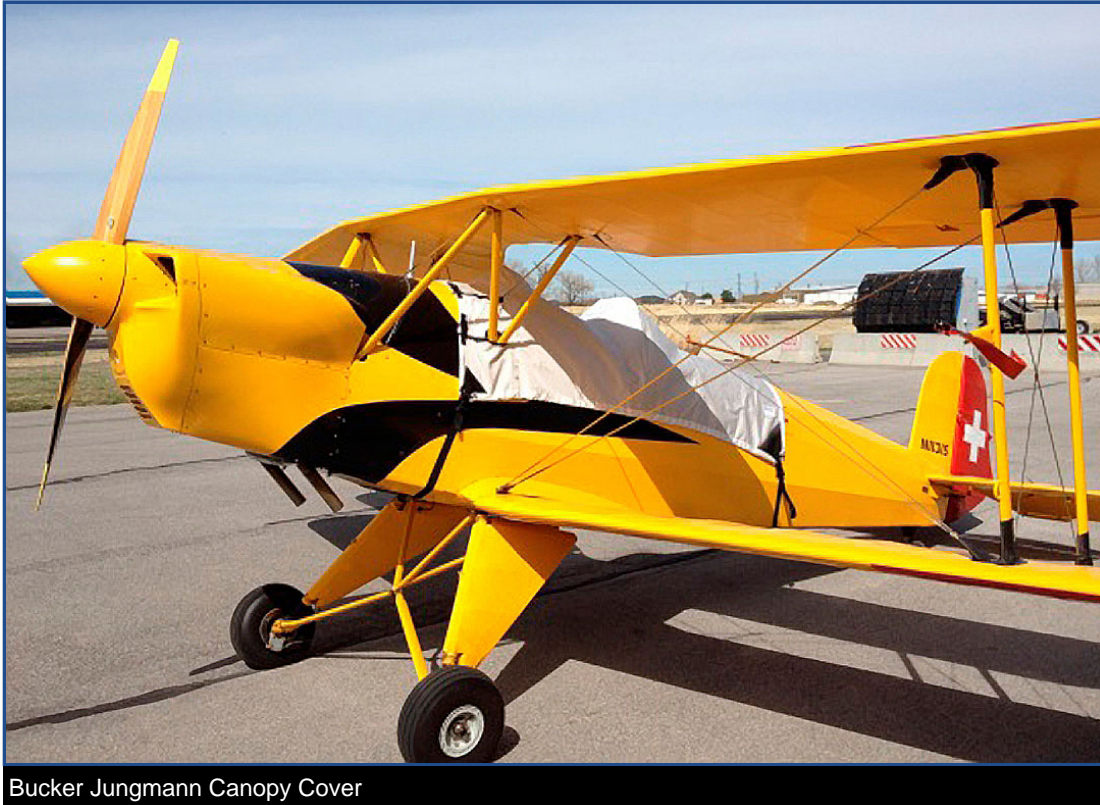
Bucker Jungmann Canopy Cover