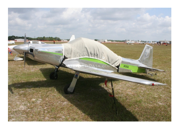
Bushby Mustang Canopy Cover