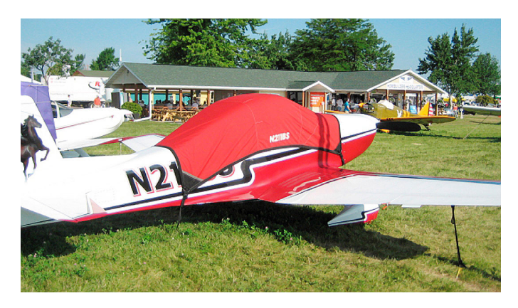
Bushby Mustang Canopy Cover

Travel Covers are made with Silver Solution-Dyed Polyester fabric and only lined over the windshield to save weight. The material is lightweight and more compact for easy stowage in the aircraft. The polyester material is water resistant, but only intended for occasional use outside. We also have an ultra lightweight material available for fitted hangar dust covers. For daily outdoor use, the non-travel Sunbrella Cover is the best choice.