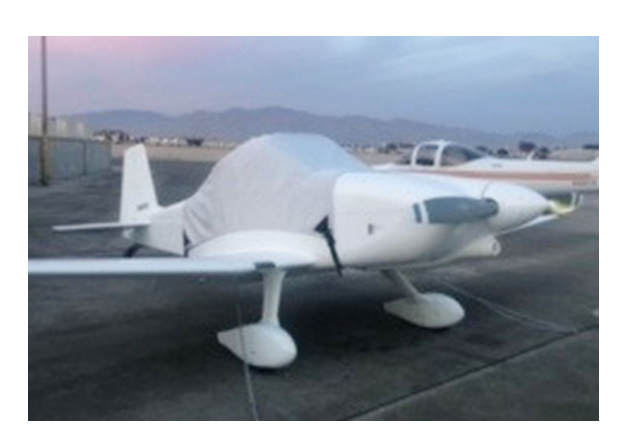
Thorp T-18 Canopy Cover