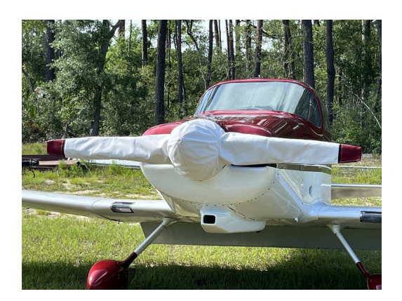
Mustang 2 Prop/Spinner Cover