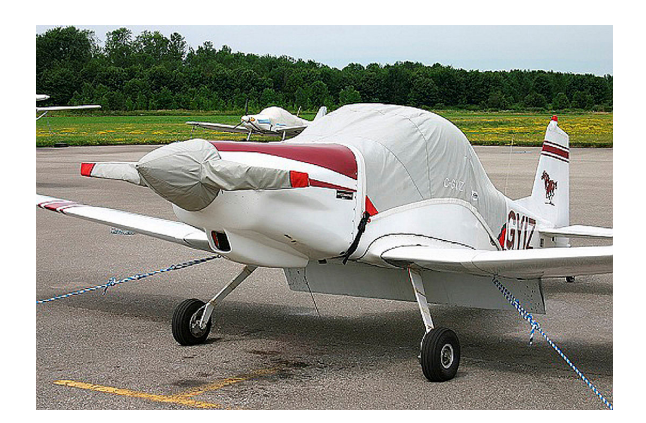
Bushby Mustang Canopy cover and Propellor/Spinner cover

This cover type is made from Silver Acrylic Sunbrella canvas and is 100% lined with a soft and smooth microfiber. Bruce's Custom Covers developed this material combination especially for aircraft protection. The outer material is medium weight and treated for water resistance, UV resistance and anti-static buildup. The inner lining is a very soft and smooth microfiber to prevent scratching. The material is very reflective, and tests show that the cabin interior temperature can be reduced to near-ambient temperature on the hottest of days. It is water, ice and snow repellent, yet breathable to allow moisture to escape from between the cover and the aircraft surface.