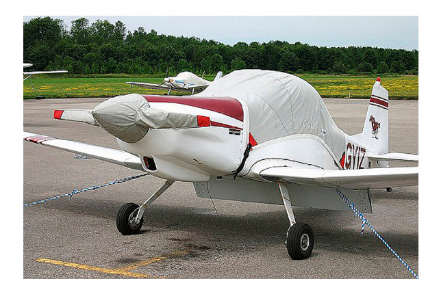
Bushby Mustang Canopy cover and Propellor/Spinner cover

This cover type is made from Silver Acrylic Sunbrella canvas and is 100% lined with a soft and smooth microfiber. Bruce's Custom Covers developed this material combination especially for aircraft protection. The outer material is medium weight and treated for water resistance, UV resistance and anti-static buildup. The inner lining is a very soft and smooth microfiber to prevent scratching. The material is very reflective, and tests show that the cabin interior temperature can be reduced to near-ambient temperature on the hottest of days. It is water, ice and snow repellent, yet breathable to allow moisture to escape from between the cover and the aircraft surface.