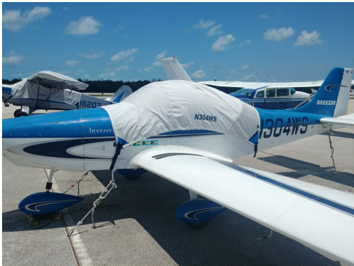
Ikarus Breezer Canopy Cover