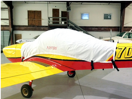
Ikarus Breezer Canopy Cover

This cover type is made from Silver Acrylic Sunbrella canvas and is 100% lined with a soft and smooth microfiber. Bruce's Custom Covers developed this material combination especially for aircraft protection. The outer material is medium weight and treated for water resistance, UV resistance and anti-static buildup. The inner lining is a very soft and smooth microfiber to prevent scratching. The material is very reflective, and tests show that the cabin interior temperature can be reduced to near-ambient temperature on the hottest of days. It is water, ice and snow repellent, yet breathable to allow moisture to escape from between the cover and the aircraft surface.