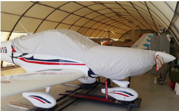
BRM Aero Bristell S-LSA Canopy/Engine Cover

This cover type is made from Silver Acrylic Sunbrella canvas and is 100% lined with a soft and smooth microfiber. Bruce's Custom Covers developed this material combination especially for aircraft protection. The outer material is medium weight and treated for water resistance, UV resistance and anti-static buildup. The inner lining is a very soft and smooth microfiber to prevent scratching. The material is very reflective, and tests show that the cabin interior temperature can be reduced to near-ambient temperature on the hottest of days. It is water, ice and snow repellent, yet breathable to allow moisture to escape from between the cover and the aircraft surface.