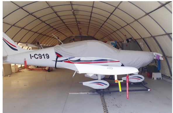
BRM Aero Bristell S-LSA Canopy/Engine Cover