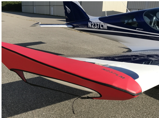
BRM Aero Bristell S-LSA Wingtip Pads

Designed to prevent damage to the aircraft extremities in crowded hangars, these products are made of bright red Naugahyde and thickly padded with a sandwich of closed cell foam. Nowadays they are also made using bright red Neoprene padded laminated (think: wetsuit material).