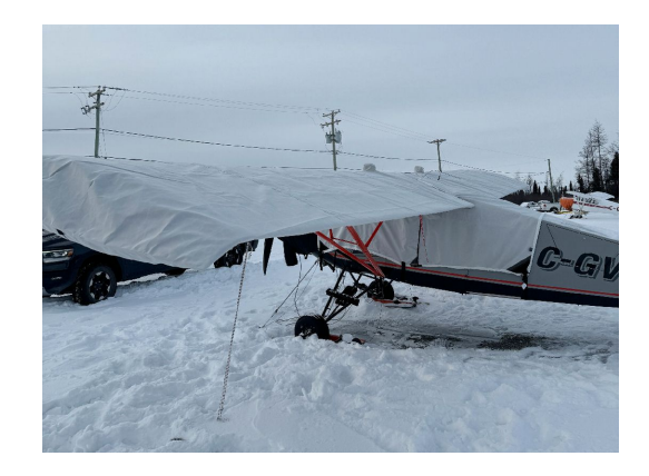
Bushmaster Wing Covers, Canopy Cover

WINTER USE MATERIAL - Made with Solution-Dyed Polyester fabric, this option is intended for seasonal use to aid in deicing, rain mitigation, or for occasional travel. The material is lighter and more compact, but more susceptible to UV damage and may have a shorter useful life if used continuously outside than the all-year use material.