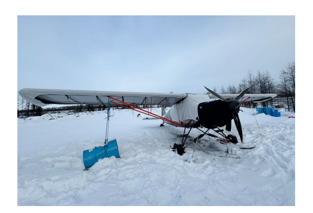
Bushmaster Wing, Canopy & Insulated Engine Covers