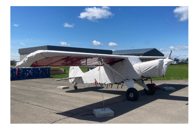
Bearhawk 4-Place Complete Cover Set, AFTER