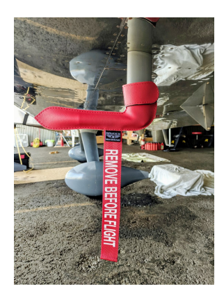
Van's RV-14 Pitot Cover

Engine Inlet Plugs are custom fit for your Bushmaster Bushmaster 4-Place intakes, made with heavy-duty vinyl material, and stuffed with a single block of sculpted urethane foam. Each plug has a zipper that allows the foam to be removed and dried if necessary. Engine plugs have warning flags that are visible from the cockpit or 'remove before flight' streamers sewn onto the face of the plugs. Most plugs are imprinted with the aircraft registration number in black for an extra charge. Storage bag NOT included. Engine plugs may be inserted after flight when the engine is still warm. Engine Inlet Plugs are commonly referred to as Cowl Plugs, Intake Plugs, Cowl Blocks, Engine Blocks, and Engine Bungs.