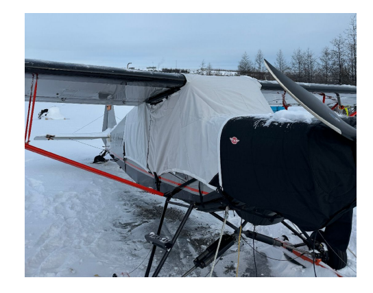
Bushmaster Canopy & Insulated Engine Covers

This cover type is made from Silver Acrylic Sunbrella canvas and is 100% lined with a soft and smooth microfiber. Bruce's Custom Covers developed this material combination especially for aircraft protection. The outer material is medium weight and treated for water resistance, UV resistance and anti-static buildup. The inner lining is a very soft and smooth microfiber to prevent scratching. The material is very reflective, and tests show that the cabin interior temperature can be reduced to near-ambient temperature on the hottest of days. It is water, ice and snow repellent, yet breathable to allow moisture to escape from between the cover and the aircraft surface.