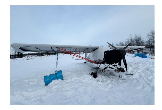
Bushmaster Wing, Canopy & Insulated Engine Covers