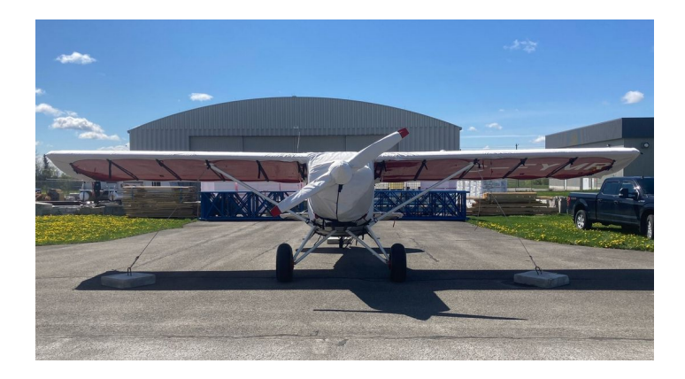
Bearhawk 4-Place Complete Cover Set

This cover type is made from Silver Acrylic Sunbrella canvas and is 100% lined with a soft and smooth microfiber. Bruce's Custom Covers developed this material combination especially for aircraft protection. The outer material is medium weight and treated for water resistance, UV resistance and anti-static buildup. The inner lining is a very soft and smooth microfiber to prevent scratching. The material is very reflective, and tests show that the cabin interior temperature can be reduced to near-ambient temperature on the hottest of days. It is water, ice and snow repellent, yet breathable to allow moisture to escape from between the cover and the aircraft surface.