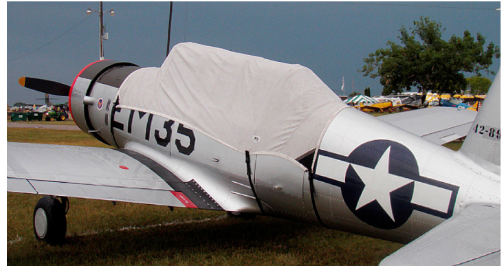
BT-13 Canopy Cover