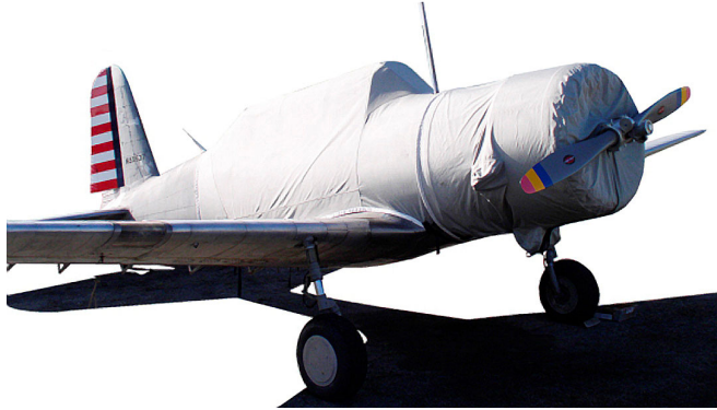
BT-13 Extended Canopy & Engine Covers

This cover type is made from Silver Acrylic Sunbrella canvas and is 100% lined with a soft and smooth microfiber. Bruce's Custom Covers developed this material combination especially for aircraft protection. The outer material is medium weight and treated for water resistance, UV resistance and anti-static buildup. The inner lining is a very soft and smooth microfiber to prevent scratching. The material is very reflective, and tests show that the cabin interior temperature can be reduced to near-ambient temperature on the hottest of days. It is water, ice and snow repellent, yet breathable to allow moisture to escape from between the cover and the aircraft surface.