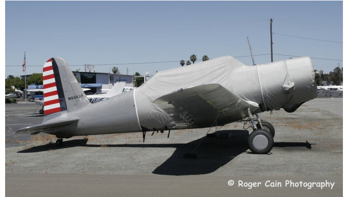
BT-13 Extended Canopy & Engine Covers