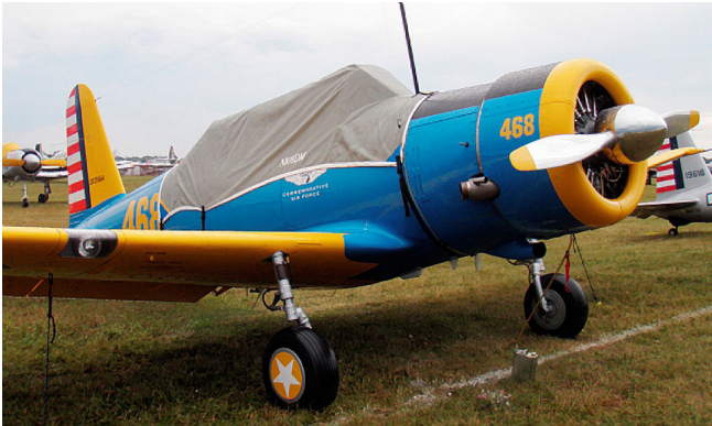
BT-13 Canopy Cover

This cover type is made from Silver Acrylic Sunbrella canvas and is 100% lined with a soft and smooth microfiber. Bruce's Custom Covers developed this material combination especially for aircraft protection. The outer material is medium weight and treated for water resistance, UV resistance and anti-static buildup. The inner lining is a very soft and smooth microfiber to prevent scratching. The material is very reflective, and tests show that the cabin interior temperature can be reduced to near-ambient temperature on the hottest of days. It is water, ice and snow repellent, yet breathable to allow moisture to escape from between the cover and the aircraft surface.