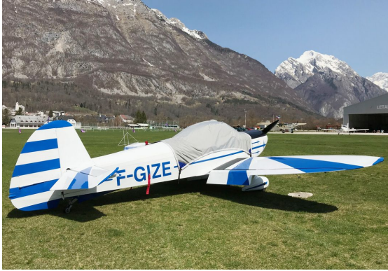
Mudry Cap 10 Canopy Cover

water resistance, UV resistance and anti-static buildup. The inner lining is a very soft and smooth microfiber to prevent scratching. The material is very reflective, and tests show that the cabin interior temperature can be reduced to near-ambient temperature on the hottest of days. It is water, ice and snow repellent, yet breathable to allow moisture to escape from between the cover and the aircraft surface.