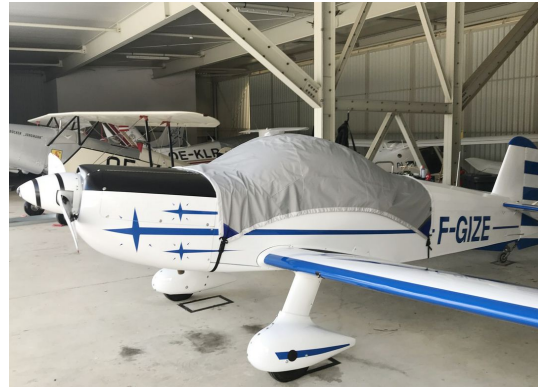
Mudry Cap 10 Travel Cover, Light Weight Travel Canopy Cover