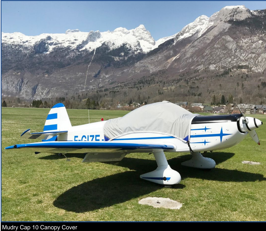
Mudry Cap 10 Canopy Cover