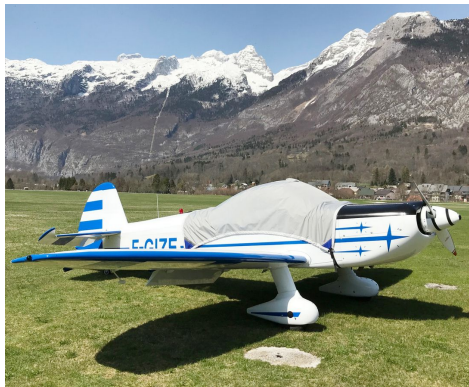
Mudry Cap 10 Canopy Cover

water resistance, UV resistance and anti-static buildup. The inner lining is a very soft and smooth microfiber to prevent scratching. The material is very reflective, and tests show that the cabin interior temperature can be reduced to near-ambient temperature on the hottest of days. It is water, ice and snow repellent, yet breathable to allow moisture to escape from between the cover and the aircraft surface.