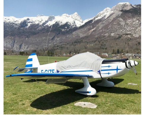
Mudry Cap 10 Canopy Cover