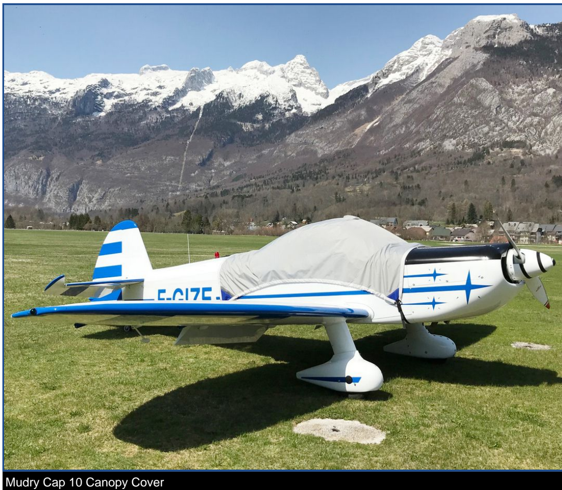
Mudry Cap 10 Canopy Cover