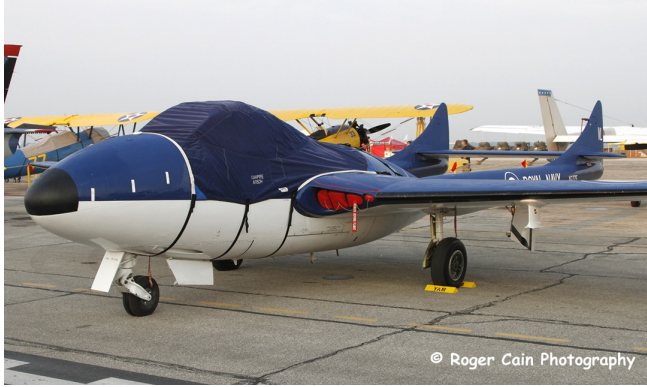
DeHavilland Vampire Canopy Cover, Engine Plugs

This cover type is made from Silver Acrylic Sunbrella canvas and is 100% lined with a soft and smooth microfiber. Bruce's Custom Covers developed this material combination especially for aircraft protection. The outer material is medium weight and treated for water resistance, UV resistance and anti-static buildup. The inner lining is a very soft and smooth microfiber to prevent scratching. The material is very reflective, and tests show that the cabin interior temperature can be reduced to near-ambient temperature on the hottest of days. It is water, ice and snow repellent, yet breathable to allow moisture to escape from between the cover and the aircraft surface.