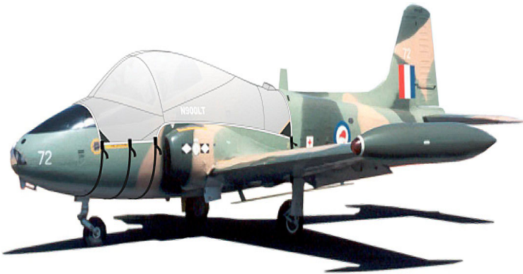
Jet Provost Canopy Cover (Illustration)