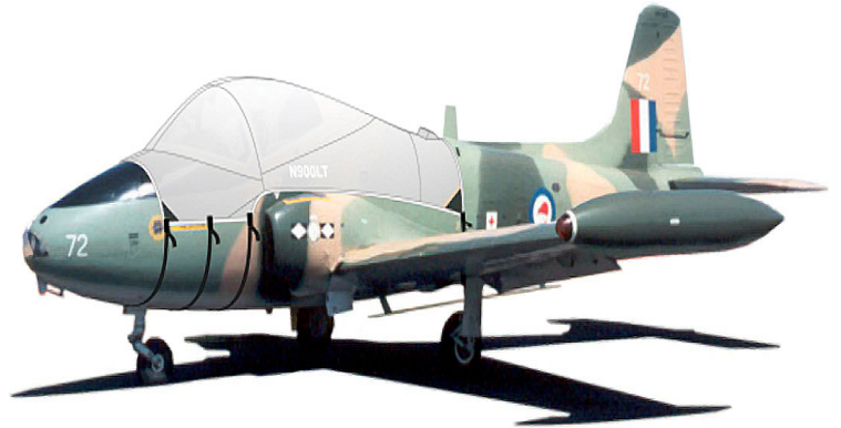
Jet Provost Canopy Cover (Illustration)