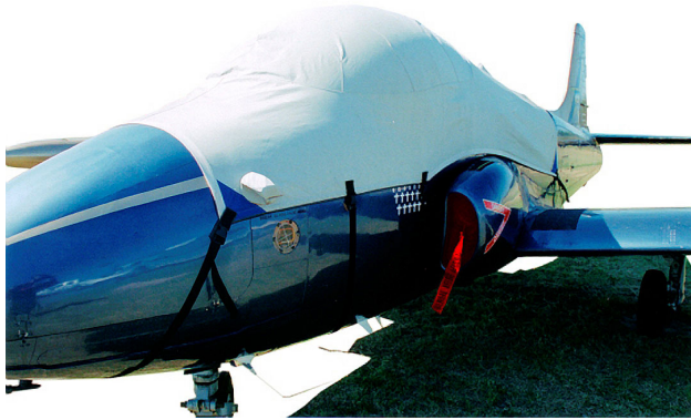
Covers & Plugs for the Jet Provost

Travel Covers are made with Silver Solution-Dyed Polyester fabric and only lined over the windshield to save weight. The material is lightweight and more compact for easy stowage in the aircraft. The polyester material is water resistant, but only intended for occasional use outside. We also have an ultra lightweight material available for fitted hangar dust covers. For daily outdoor use, the non-travel Sunbrella Cover is the best choice.