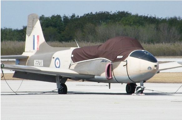
Jet Provost Canopy Cover

Travel Covers are made with Silver Solution-Dyed Polyester fabric and only lined over the windshield to save weight. The material is lightweight and more compact for easy stowage in the aircraft. The polyester material is water resistant, but only intended for occasional use outside. We also have an ultra lightweight material available for fitted hangar dust covers. For daily outdoor use, the non-travel Sunbrella Cover is the best choice.