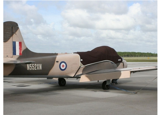
Jet Provost Canopy Cover