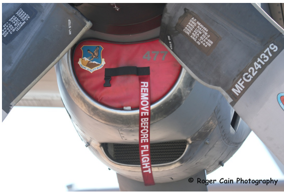
Lockheed C-130 Main Engine Inlet Plugs