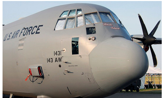
C-130 Cockpit HeatShields