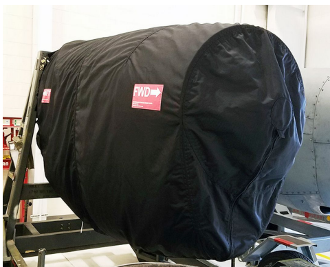
C-130 QEC / Maintenance Cover Set

This cover type is made from Silver Acrylic Sunbrella canvas and is 100% lined with a soft and smooth microfiber. Bruce's Custom Covers developed this material combination especially for aircraft protection. The outer material is medium weight and treated for water resistance, UV resistance and anti-static buildup. The inner lining is a very soft and smooth microfiber to prevent scratching. The material is very reflective, and tests show that the cabin interior temperature can be reduced to near-ambient temperature on the hottest of days. It is water, ice and snow repellent, yet breathable to allow moisture to escape from between the cover and the aircraft surface.