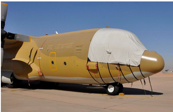
C-130 Cockpit Cover (Windshield/Flight Deck)

This cover type is made from Silver Acrylic Sunbrella canvas and is 100% lined with a soft and smooth microfiber. Bruce's Custom Covers developed this material combination especially for aircraft protection. The outer material is medium weight and treated for water resistance, UV resistance and anti-static buildup. The inner lining is a very soft and smooth microfiber to prevent scratching. The material is very reflective, and tests show that the cabin interior temperature can be reduced to near-ambient temperature on the hottest of days. It is water, ice and snow repellent, yet breathable to allow moisture to escape from between the cover and the aircraft surface.