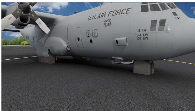
C-130 Tire Covers

ALL-YEAR USE MATERIAL - Made with Silver Acrylic Sunbrella canvas, the all-year use material is the best option for sun protection and cover longevity. This heavier more durable material is intended for all weather conditions, such as rain and snow or lots of sun.