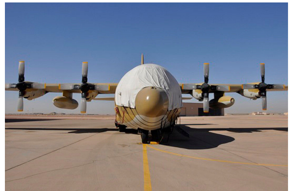
C-130 Cockpit Cover (Windshield/Flight Deck)