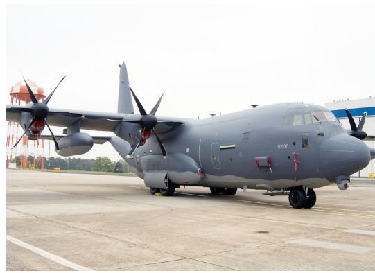
Various plugs and covers for MC-130J(Pitot Covers, Air Conditioning Plugs, Engine Plugs)