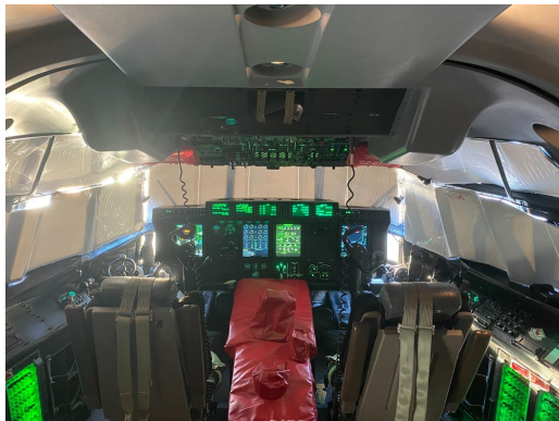
Lockheed C-130 Hercules Flight Deck Heatshield Set

Windshield and Skylight Heatshields are interior sunshades for an aircraft's front windshield and overhead window. The product is a unique composite of closed-cell foam with a silver mylar finish. The semi-rigid design is stiff enough to stand along the inside of the windshield using sun visors or window framing. It folds up flat and easily stores in the included storage sleeve. Some designs may require velcro and suction cups or split right and left sides. A Heatshield is an excellent short-term remedy for cockpit overheating. An external fabric cover is far more effective and practical for long-term protection.