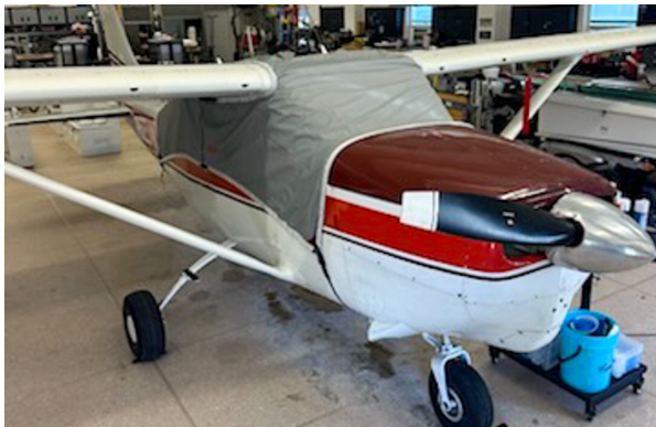
Cessna 205 Stationair Canopy Cover, Over Top Type

This cover type is made from Silver Acrylic Sunbrella canvas and is 100% lined with a soft and smooth microfiber. Bruce's Custom Covers developed this material combination especially for aircraft protection. The outer material is medium weight and treated for water resistance, UV resistance and anti-static buildup. The inner lining is a very soft and smooth microfiber to prevent scratching. The material is very reflective, and tests show that the cabin interior temperature can be reduced to near-ambient temperature on the hottest of days. It is water, ice and snow repellent, yet breathable to allow moisture to escape from between the cover and the aircraft surface.