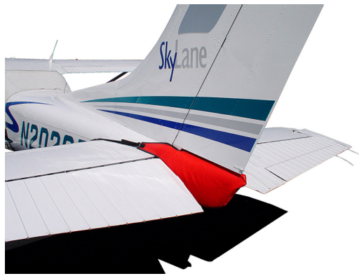
Cessna 182 Tailcone Cover