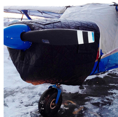
Cessna 205 Insulated Engine Cover