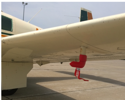
Mooney Pitot Cover

Engine Inlet Plugs are custom fit for your Cessna 205 Stationair intakes, made with heavy-duty vinyl material, and stuffed with a single block of sculpted urethane foam. Each plug has a zipper that allows the foam to be removed and dried if necessary. Engine plugs have warning flags that are visible from the cockpit or 'remove before flight' streamers sewn onto the face of the plugs. Most plugs are imprinted with the aircraft registration number in black for an extra charge. Storage bag NOT included. Engine plugs may be inserted after flight when the engine is still warm. Engine Inlet Plugs are commonly referred to as Cowl Plugs, Intake Plugs, Cowl Blocks, Engine Blocks, and Engine Bungs.