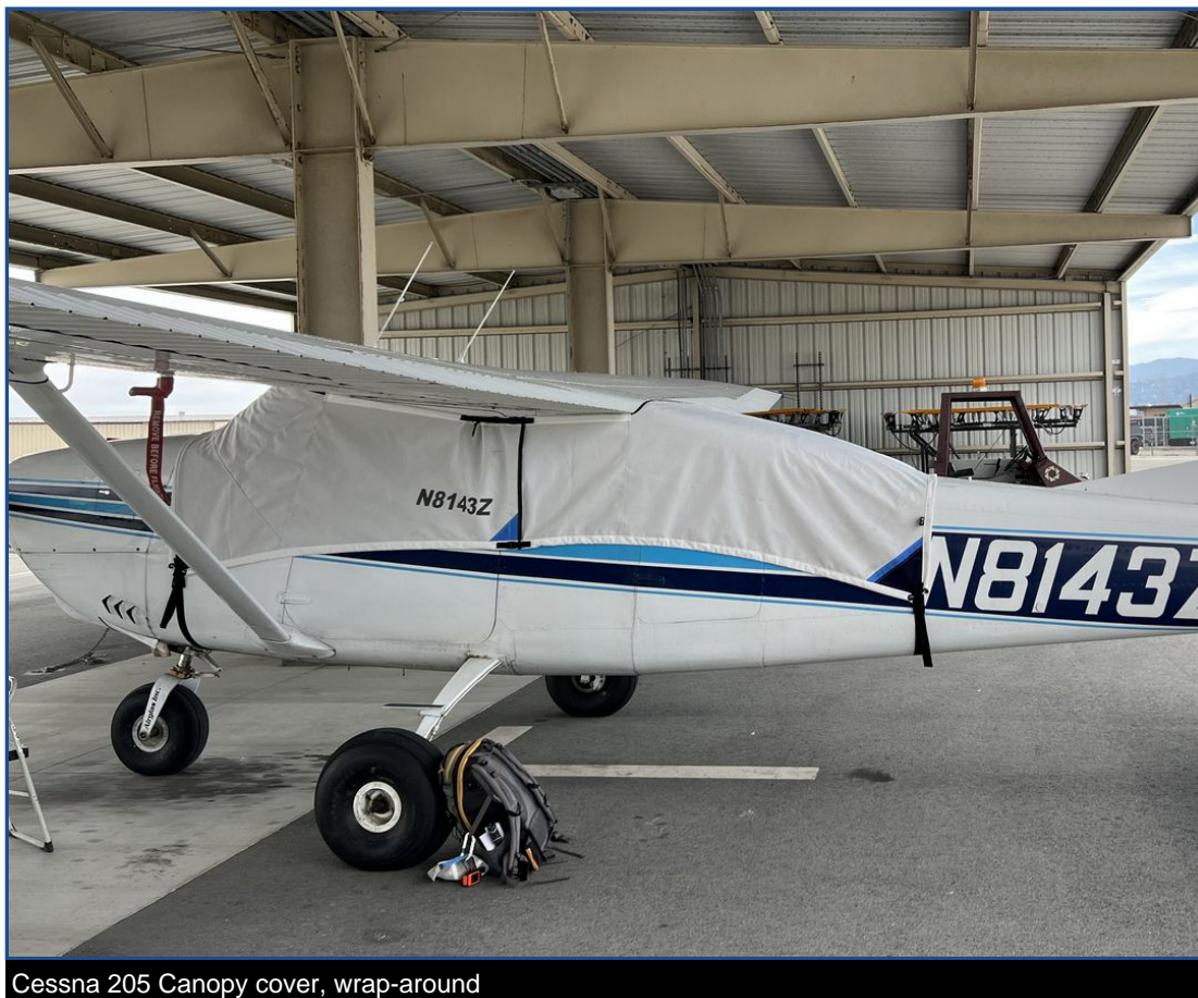
Cessna 205 Canopy cover, wrap-around