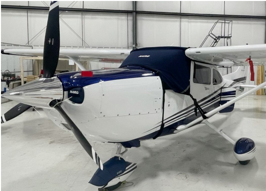
Cessna 182 Windshield Cover, Engine Plugs

This cover type is made from Silver Acrylic Sunbrella canvas and is 100% lined with a soft and smooth microfiber. Bruce's Custom Covers developed this material combination especially for aircraft protection. The outer material is medium weight and treated for water resistance, UV resistance and anti-static buildup. The inner lining is a very soft and smooth microfiber to prevent scratching. The material is very reflective, and tests show that the cabin interior temperature can be reduced to near-ambient temperature on the hottest of days. It is water, ice and snow repellent, yet breathable to allow moisture to escape from between the cover and the aircraft surface.