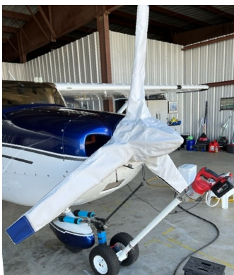
Cessna 182 Skylane 3-Blade Prop Cover

This cover type is made from Silver Acrylic Sunbrella canvas and is 100% lined with a soft and smooth microfiber. Bruce's Custom Covers developed this material combination especially for aircraft protection. The outer material is medium weight and treated for water resistance, UV resistance and anti-static buildup. The inner lining is a very soft and smooth microfiber to prevent scratching. The material is very reflective, and tests show that the cabin interior temperature can be reduced to near-ambient temperature on the hottest of days. It is water, ice and snow repellent, yet breathable to allow moisture to escape from between the cover and the aircraft surface.