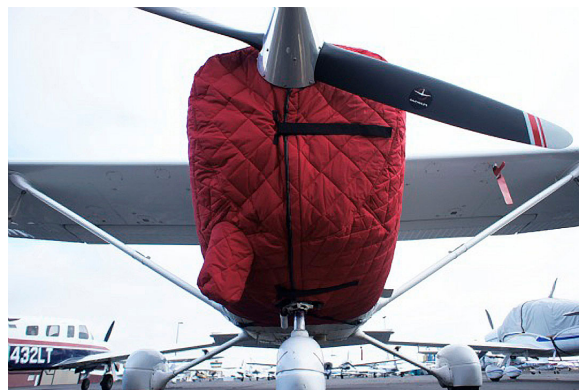
Cessna 172 Insulated Engine Cover, fully enclosed around bottom