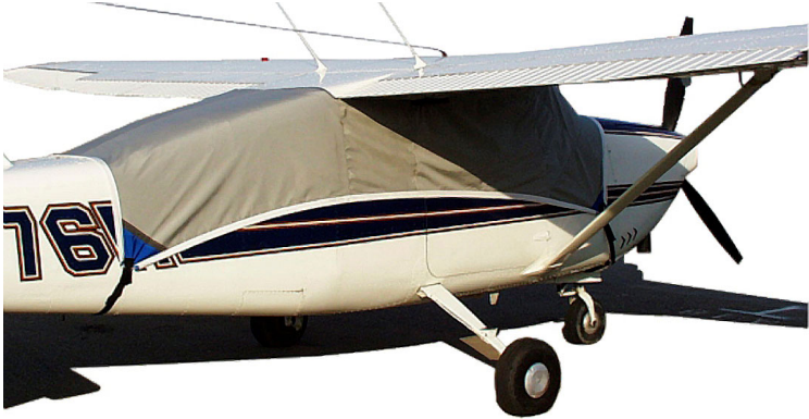
Cessna 206 Wrap-Around Canopy Cover