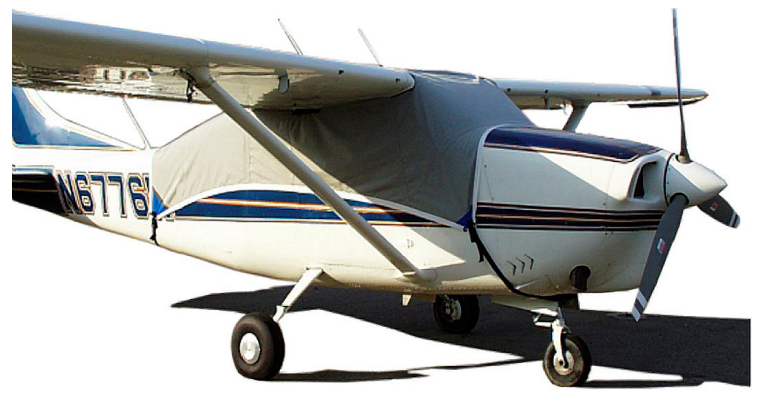
Canopy covers are available in belly strap, snap-on or Over-the-Top Styles