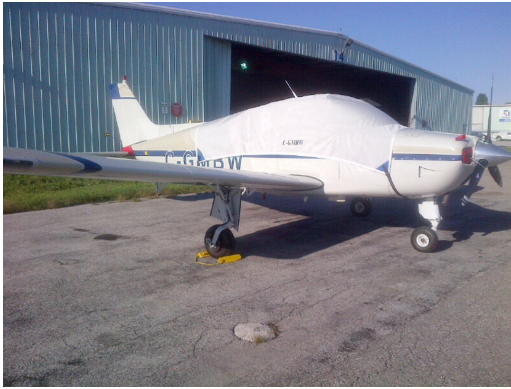
Beech Sierra Canopy Cover, Engine Plugs, Tailcone Cover

plugs have warning flags that are visible from the cockpit or 'remove before flight' streamers sewn onto the face of the plugs. Most plugs are imprinted with the aircraft registration number in black for an extra charge. Storage bag NOT included. Engine plugs may be inserted after flight when the engine is still warm. Engine Inlet Plugs are commonly referred to as Cowl Plugs, Intake Plugs, Cowl Blocks, Engine Blocks, and Engine Bungs.