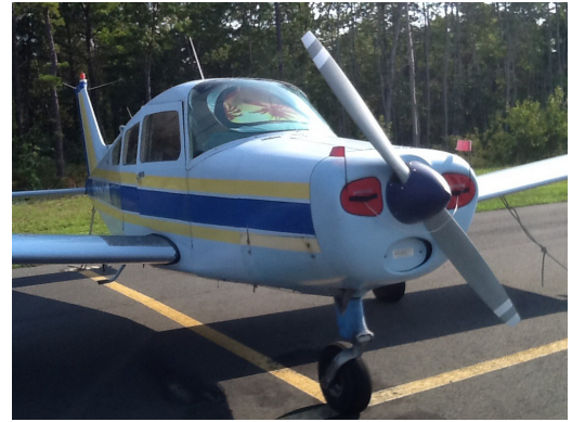
Beech Musketeer Engine Inlet Plugs