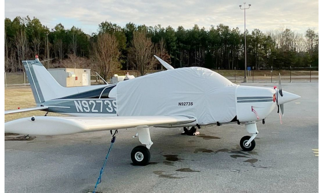
Beech Sundowner Extended Canopy Cover