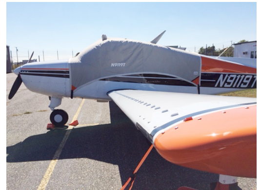
Beech Musketeer Canopy Cover