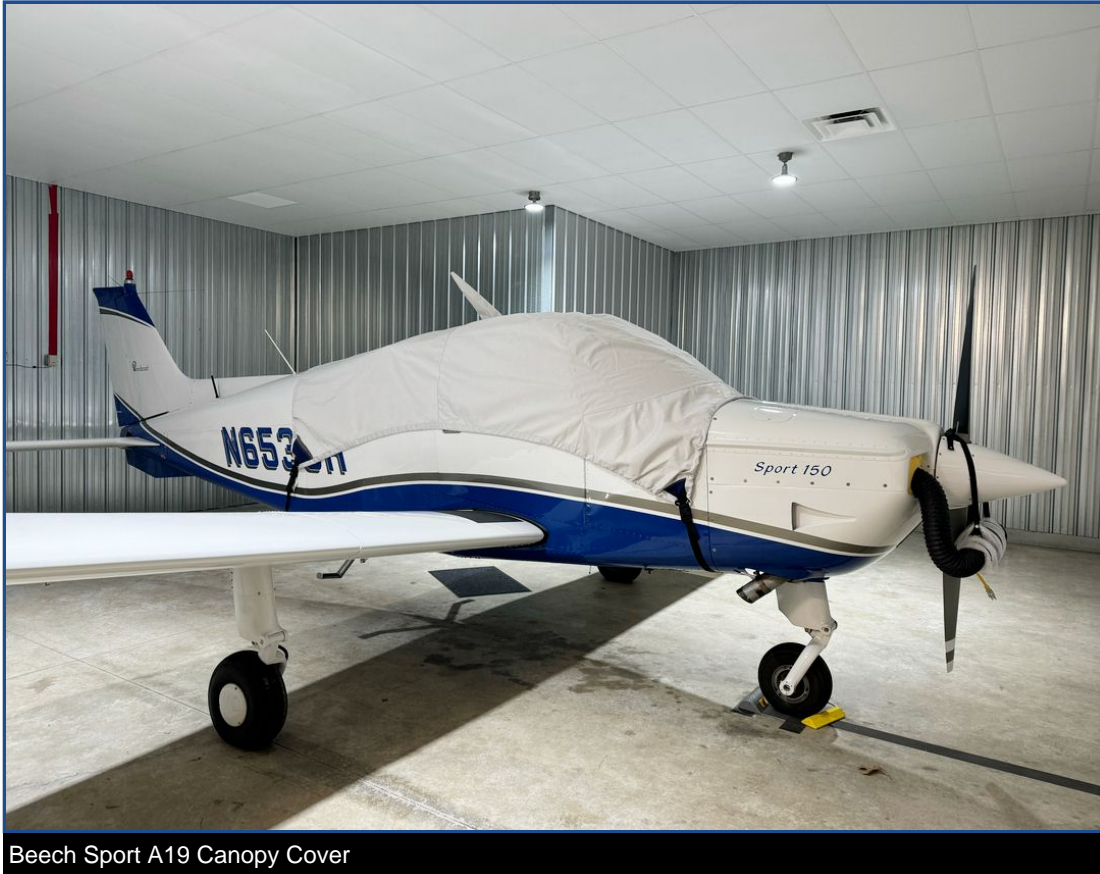
Beech Sport A19 Canopy Cover