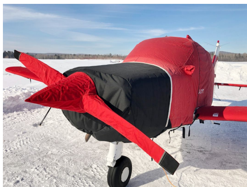
Beech Sundowner Extended Canopy, Wing, Engine & Prop Covers