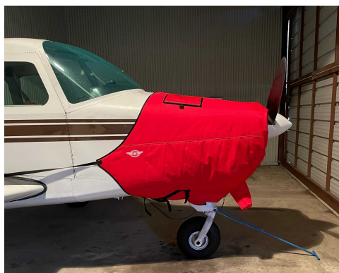
Beech Musketeer Insulated Engine Covers

This cover type is made from Silver Acrylic Sunbrella canvas and is 100% lined with a soft and smooth microfiber. Bruce's Custom Covers developed this material combination especially for aircraft protection. The outer material is medium weight and treated for water resistance, UV resistance and anti-static buildup. The inner lining is a very soft and smooth microfiber to prevent scratching. The material is very reflective, and tests show that the cabin interior temperature can be reduced to near-ambient temperature on the hottest of days. It is water, ice and snow repellent, yet breathable to allow moisture to escape from between the cover and the aircraft surface.