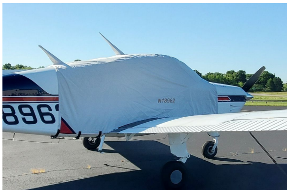
Beech C23 Sundowner Extended Canopy Cover

This cover type is made from Silver Acrylic Sunbrella canvas and is 100% lined with a soft and smooth microfiber. Bruce's Custom Covers developed this material combination especially for aircraft protection. The outer material is medium weight and treated for water resistance, UV resistance and anti-static buildup. The inner lining is a very soft and smooth microfiber to prevent scratching. The material is very reflective, and tests show that the cabin interior temperature can be reduced to near-ambient temperature on the hottest of days. It is water, ice and snow repellent, yet breathable to allow moisture to escape from between the cover and the aircraft surface.