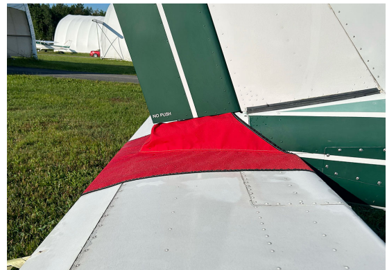
Sundowner C23 Tailcone Cover, fully enclosed