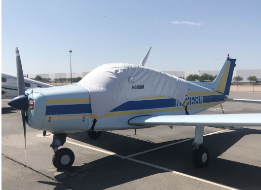
Beech Musketeer Canopy Cover

This cover type is made from Silver Acrylic Sunbrella canvas and is 100% lined with a soft and smooth microfiber. Bruce's Custom Covers developed this material combination especially for aircraft protection. The outer material is medium weight and treated for water resistance, UV resistance and anti-static buildup. The inner lining is a very soft and smooth microfiber to prevent scratching. The material is very reflective, and tests show that the cabin interior temperature can be reduced to near-ambient temperature on the hottest of days. It is water, ice and snow repellent, yet breathable to allow moisture to escape from between the cover and the aircraft surface.