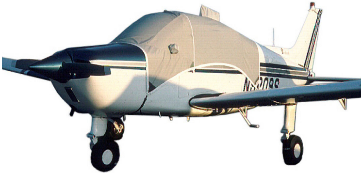
Beech Sport Canopy Cover

Travel Covers are made with Silver Solution-Dyed Polyester fabric and only lined over the windshield to save weight. The material is lightweight and more compact for easy stowage in the aircraft. The polyester material is water resistant, but only intended for occasional use outside. We also have an ultra lightweight material available for fitted hangar dust covers. For daily outdoor use, the non-travel Sunbrella Cover is the best choice.