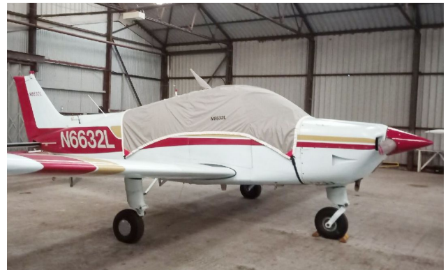
Beech Sundowner Travel Cover, Light Weight Canopy Cover