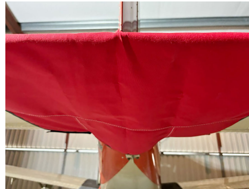
Beech C24R Tailcone Cover, fully enclosed