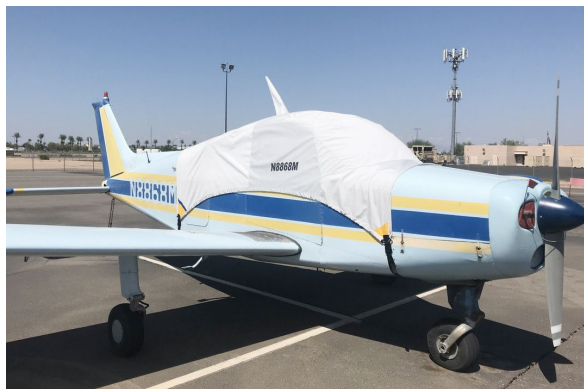
Beech Musketeer Canopy Cover