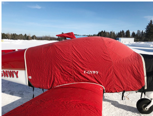
Beech Sundowner Extended Canopy & Wing Covers

WINTER USE MATERIAL - Made with Solution-Dyed Polyester fabric, this option is intended for seasonal use to aid in deicing, rain mitigation, or for occasional travel. The material is lighter and more compact, but more susceptible to UV damage and may have a shorter useful life if used continuously outside than the all-year use material.