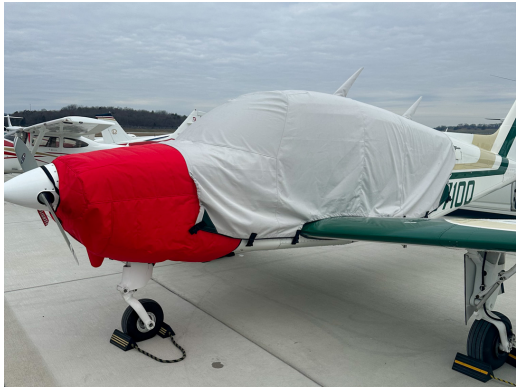
Beech A24R Insulated Engine Cover, fully enclosed

This cover type is made from Silver Acrylic Sunbrella canvas and is 100% lined with a soft and smooth microfiber. Bruce's Custom Covers developed this material combination especially for aircraft protection. The outer material is medium weight and treated for water resistance, UV resistance and anti-static buildup. The inner lining is a very soft and smooth microfiber to prevent scratching. The material is very reflective, and tests show that the cabin interior temperature can be reduced to near-ambient temperature on the hottest of days. It is water, ice and snow repellent, yet breathable to allow moisture to escape from between the cover and the aircraft surface.