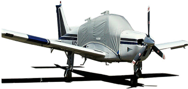
Beech Sport Canopy Cover

Travel Covers are made with Silver Solution-Dyed Polyester fabric and only lined over the windshield to save weight. The material is lightweight and more compact for easy stowage in the aircraft. The polyester material is water resistant, but only intended for occasional use outside. We also have an ultra lightweight material available for fitted hangar dust covers. For daily outdoor use, the non-travel Sunbrella Cover is the best choice.