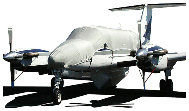
King Air Canopy/Nose Cover