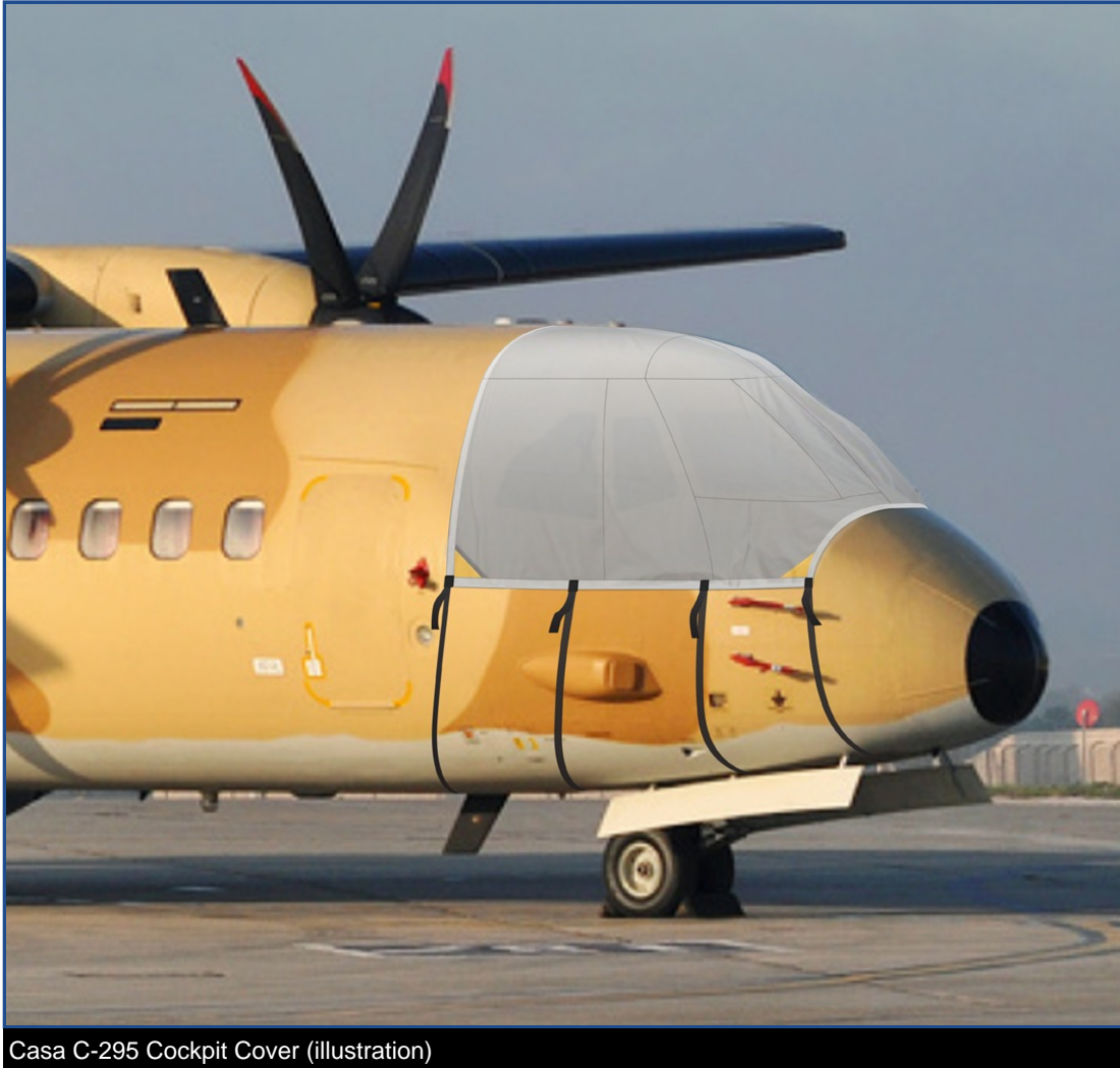
Casa C-295 Cockpit Cover (illustration)