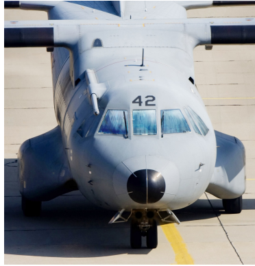
Casa C-295 Cockpit HeatShields (illustration)

for cockpit overheating, but an external fabric cover is more effective for long-term protection.