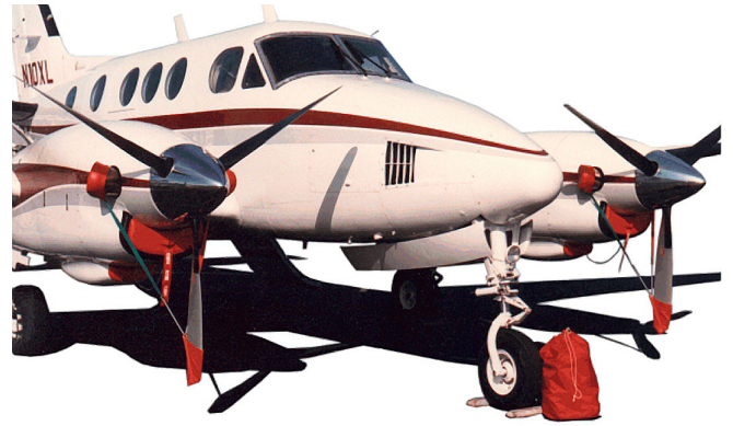
Pitot, Exhaust Covers, Engine Plugs & Prop Ties