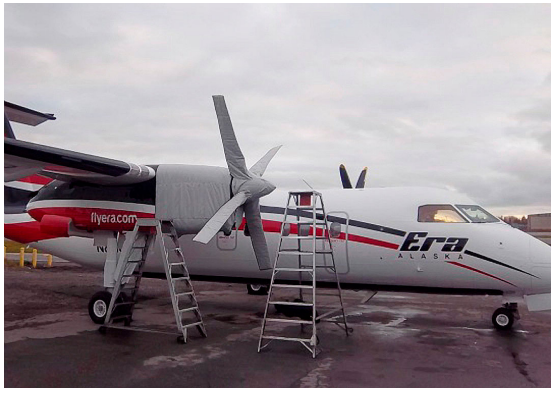
Dash 8 Insulated Engine & Prop Covers