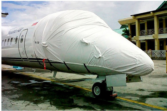
De Havilland Dash 8 Cockpit/Nose Cover

This cover type is made from Silver Acrylic Sunbrella canvas and is 100% lined with a soft and smooth microfiber. Bruce's Custom Covers developed this material combination especially for aircraft protection. The outer material is medium weight and treated for water resistance, UV resistance and anti-static buildup. The inner lining is a very soft and smooth microfiber to prevent scratching. The material is very reflective, and tests show that the cabin interior temperature can be reduced to near-ambient temperature on the hottest of days. It is water, ice and snow repellent, yet breathable to allow moisture to escape from between the cover and the aircraft surface.