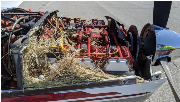
ENGINE PLUGS PREVENT BIRD NEST FOD. Piper Saratoga Engine Cowling Bird's Nest

Engine Inlet Plugs are custom fit for your Casa EADS C-295 intakes, made with heavy-duty vinyl material, and stuffed with a single block of sculpted urethane foam. Each plug has a zipper that allows the foam to be removed and dried if necessary. Engine plugs have warning flags that are visible from the cockpit or 'remove before flight' streamers sewn onto the face of the plugs. Most plugs are imprinted with the aircraft registration number in black for an extra charge. Storage bag NOT included. Engine plugs may be inserted after flight when the engine is still warm. Engine Inlet Plugs are commonly referred to as Cowl Plugs, Intake Plugs, Cowl Blocks, Engine Blocks, and Engine Bungs.