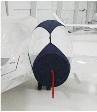
Challenger 300 Intake/Exhaust Cover Set, 3-strap type