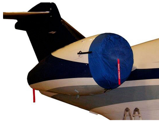
Challenger 300 Intake Covers (set of 2), come in colors