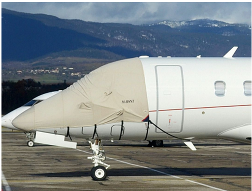
Challenger 300 Cockpit/Nose Cover

This cover type is made from Silver Acrylic Sunbrella canvas and is 100% lined with a soft and smooth microfiber. Bruce's Custom Covers developed this material combination especially for aircraft protection. The outer material is medium weight and treated for water resistance, UV resistance and anti-static buildup. The inner lining is a very soft and smooth microfiber to prevent scratching. The material is very reflective, and tests show that the cabin interior temperature can be reduced to near-ambient temperature on the hottest of days. It is water, ice and snow repellent, yet breathable to allow moisture to escape from between the cover and the aircraft surface.