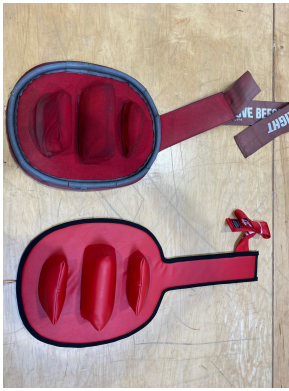
Canadair Challenger 300, 350 Heat Exchanger Exhaust Plug