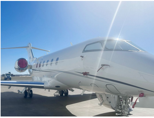
Canadair Challenger 300 Cockpit HeatShields, Intake Plugs