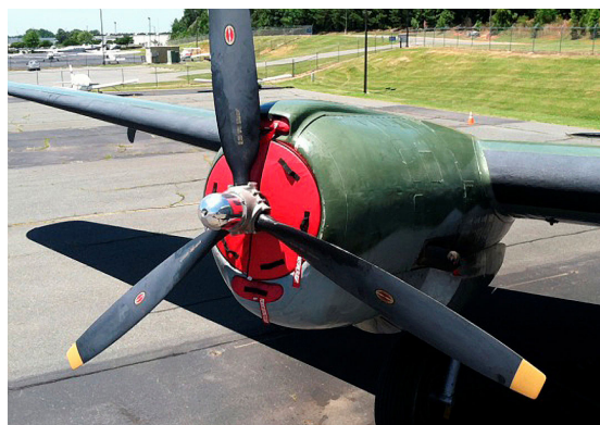
C-46 Radial Engine Intake Plug