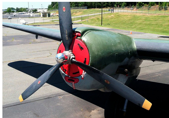
C-46 Radial Engine Intake Plug