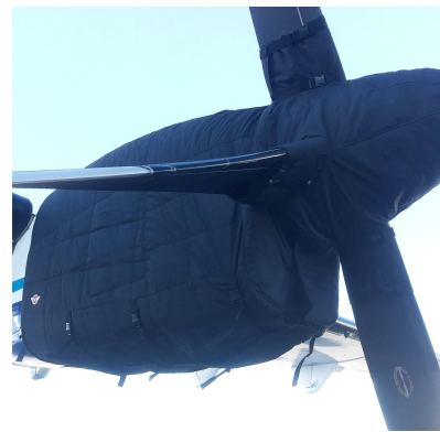
ATR-72-202 Insulated Engine & Prop Hub Covers