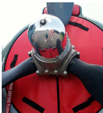
C-46 Radial Engine Intake Plug

Engine Inlet Plugs are custom fit for your Curtiss Wright C-46 Commando intakes, made with heavy-duty vinyl material, and stuffed with a single block of sculpted urethane foam. Each plug has a zipper that allows the foam to be removed and dried if necessary. Engine plugs have warning flags that are visible from the cockpit or 'remove before flight' streamers sewn onto the face of the plugs. Most plugs are imprinted with the aircraft registration number in black for an extra charge. Storage bag NOT included. Engine plugs may be inserted after flight when the engine is still warm. Engine Inlet Plugs are commonly referred to as Cowl Plugs, Intake Plugs, Cowl Blocks, Engine Blocks, and Engine Bunges.