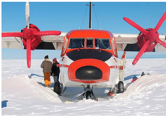
Casa 212 Insulated Engine & Propellor/Spinner Covers