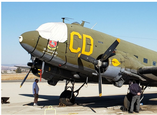
Douglas DC-3 Cockpit Cover