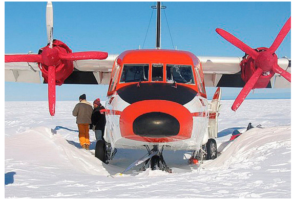
Casa 212 Insulated Engine & Propellor/Spinner Covers