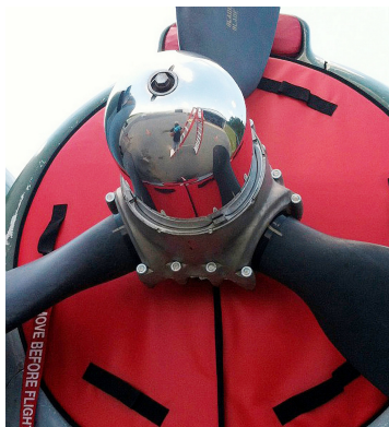
C-46 Radial Engine Intake Plug

Engine Inlet Plugs are custom fit for your Curtiss Wright C-46 Commando intakes, made with heavy-duty vinyl material, and stuffed with a single block of sculpted urethane foam. Each plug has a zipper that allows the foam to be removed and dried if necessary. Engine plugs have warning flags that are visible from the cockpit or 'remove before flight' streamers sewn onto the face of the plugs. Most plugs are imprinted with the aircraft registration number in black for an extra charge. Storage bag NOT included. Engine plugs may be inserted after flight when the engine is still warm. Engine Inlet Plugs are commonly referred to as Cowl Plugs, Intake Plugs, Cowl Blocks, Engine Blocks, and Engine Bunges.