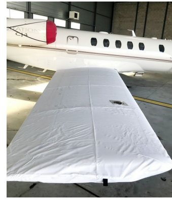
Cessna Citation CJ-4 Wing Covers, test fit cover