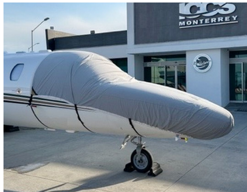
Cessna Citationjet 525B Travel Weight Cockpit/Nose Cover