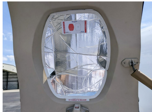
Citationjet Entrance Door Heatshield