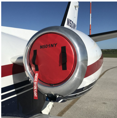
Citation 501 Intake/Exhaust Plug Set

The Engine Inlet Plugs are custom fit for your Cessna Citation I (500/501) intakes, made with heavy-duty vinyl material, and stuffed with a single block of sculpted urethane foam. Each plug has a zipper that allows the foam to be removed and dried if necessary. Engine plugs have 'remove before flight' streamers sewn onto the face of the plugs. Most plugs are imprinted with the aircraft registration number in black for an extra charge. Storage bag NOT included. Engine plugs may be inserted after flight when the engine is still warm. Engine Inlet Plugs are commonly referred to as Cowl Plugs, Intake Plugs, Cowl Blocks, Engine Blocks, and Engine Bungs.