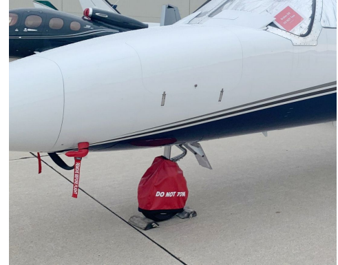
Cessna Citation Nose Tire Cover