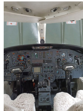
Cessna Citation I & II Cockpit HeatShields