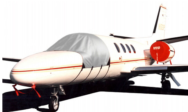
Cessna Citationjet 525B Travel Weight Cockpit/Nose Cover Cessna Citation Windshield Cover, Engine Cover set and Pitot Covers