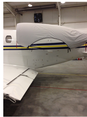
Cessna Citation 560XL Upper Nacelle/Brightwork Covers