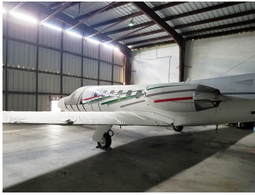
Cessna Citation II Cockpit Cover, Wing Covers