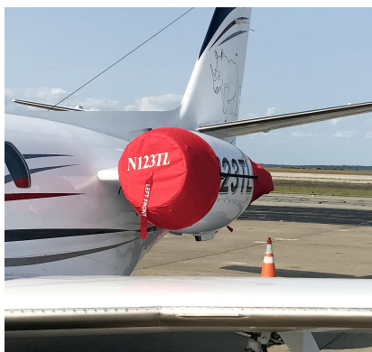
Cessna Citation S/II (S550) Engine Covers (With Tr's)

The Cessna Citation I (500/501) Intake Covers are designed to install easily yet be completely storable. A spring steel hoop is sewn into the hem of each cover, allowing them to be installed without climbing onto the wing or using a stepladder. To store the covers the spring steel hoop folds like a band-saw blade into three nesting rings. Each cover folds into a compact circular bundle which is stored in the included duffle bag, yet they unfold quickly for use. The Tri-Fold Ring cover is made of medium weight nylon which is available in a variety of colors to match the paint trim. Each cover set comes complete with installation and folding instructions. The aircraft's registration number can be silkscreened onto the cover for an extra charge.