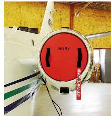
Cessna Citation S2 Intake Plugs