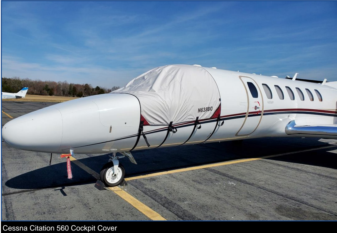
Cessna Citation 560 Cockpit Cover