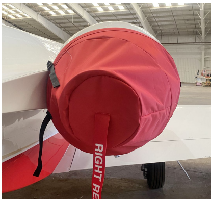
Cessna 501 Engine Covers NO TR's

The Cessna Citation I (500/501) Intake Covers are designed to install easily yet be completely storable. A spring steel hoop is sewn into the hem of each cover, allowing them to be installed without climbing onto the wing or using a stepladder. To store the covers the spring steel hoop folds like a band-saw blade into three nesting rings. Each cover folds into a compact circular bundle which is stored in the included duffle bag, yet they unfold quickly for use. The Tri-Fold Ring cover is made of medium weight nylon which is available in a variety of colors to match the paint trim. Each cover set comes complete with installation and folding instructions. The aircraft's registration number can be silkscreened onto the cover for an extra charge.