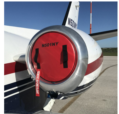
Citation 501 Intake/Exhaust Plug Set