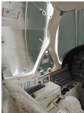
Cessna Citation I & II Cockpit HeatShields

Custom-made Heatshield Sunshades are available for almost any window in the jet. Side windows, Skylights, and Emergency Exits are all custom-made. The product is a unique composite of closed-cell foam with a silver mylar finish. The set is easily stored in the included storage sleeve. Some designs may require velcro and suction cups. Our Heatshields are offered white side out since aircraft manufacturers have issued advisories against reflective window inserts due to potential heat damage.