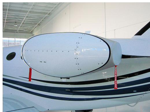
Cessna 510 Mustang Bikini Type Engine Cover