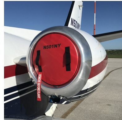
Citation 501 Intake/Exhaust Plug Set