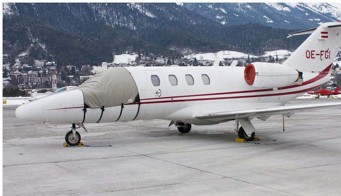
Cessna Citationjet CJ1 Cockpit Cover

Travel Covers are made with Silver Solution-Dyed Polyester fabric and only lined over the windshield to save weight. The material is lightweight and more compact for easy stowage in the aircraft. The polyester material is water resistant, but only intended for occasional use outside. We also have an ultra lightweight material available for fitted hangar dust covers. For daily outdoor use, the non-travel Sunbrella Cover is the best choice.