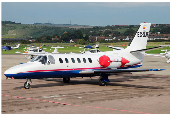
Cessna Citation II Engine Covers, Pitot Covers

The Cessna Citation I (500/501) Intake Covers are designed to install easily yet be completely storable. A spring steel hoop is sewn into the hem of each cover, allowing them to be installed without climbing onto the wing or using a stepladder. To store the covers the spring steel hoop folds like a band-saw blade into three nesting rings. Each cover folds into a compact circular bundle which is stored in the included duffel bag, yet they unfold quickly for use. The Tri-Fold Ring cover is made of medium weight nylon which is available in a variety of colors to match the paint trim. Each cover set comes complete with installation and folding instructions. The aircraft's registration number can be silkscreened onto the cover for an extra charge.