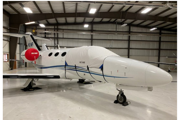
Cessna 510 Cockpit Cover extends to cover door