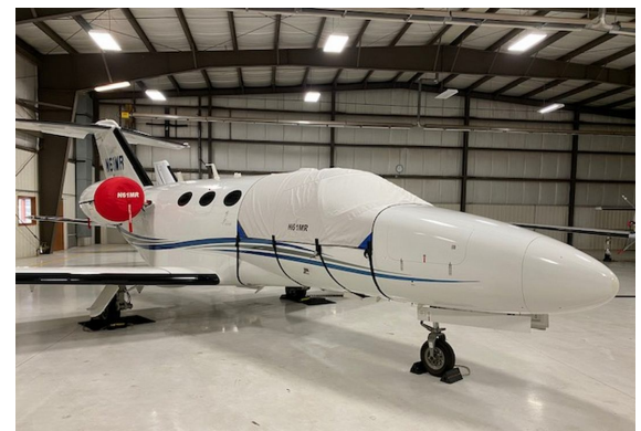
Citation Mustang Windshield Cover, Intake Cover/Exhaust Plug Set, Pitot Covers Cessna 510 Cockpit Cover extends to cover door