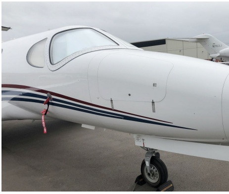
Cessna Mustang 510 Cockpit Heatshields, Pitot Cover/AOA