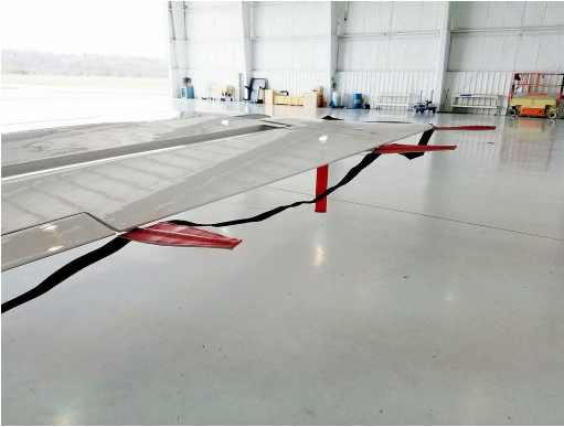
Hawker Beechcraft 800, 800XP, 850XP Static Wick Protectors

Designed to prevent damage to the aircraft extremities in crowded hangars, these products are made of bright red Naugahyde and thickly padded with a sandwich of closed cell foam.