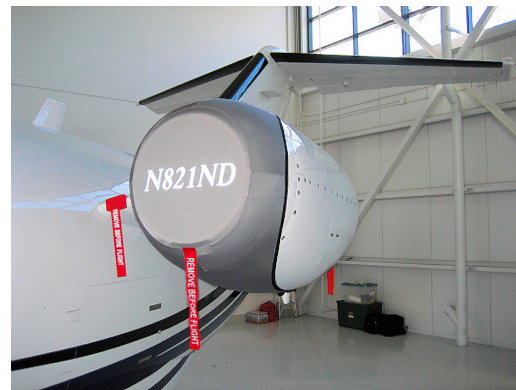
Citation Mustang Intake/Exhaust Cover, "Bikini" Type and leading edge Pylon inlet plugs