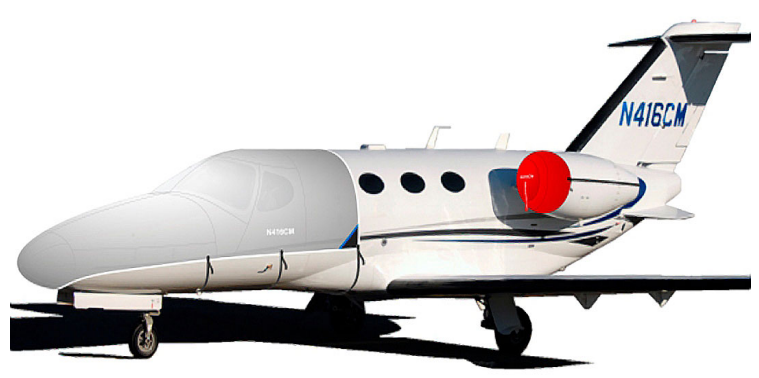
Citation Mustang Light Weight Travel Windshield Cover, "Bikini" type Engine Cover Set Citation Mustang Cockpit/Door/Nose Cover, Engine Inlet Cover