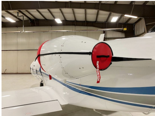
Cessna 510 Engine Inlet Covers &amp; Exhaust Plugs

The Engine Inlet Plugs are custom fit for your Cessna Mustang 510 intakes, made with heavy-duty vinyl material, and stuffed with a single block of sculpted urethane foam. Each plug has a zipper that allows the foam to be removed and dried if necessary. Engine plugs have 'remove before flight' streamers sewn onto the face of the plugs. Most plugs are imprinted with the aircraft registration number in black for an extra charge. Storage bag NOT included. Engine plugs may be inserted after flight when the engine is still warm. Engine Inlet Plugs are commonly referred to as Cowl Plugs, Intake Plugs, Cowl Blocks, Engine Blocks, and Engine Bunges.