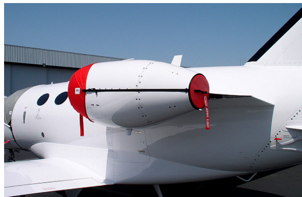
Citation Mustang Intake Cover/Exhaust Plug Set