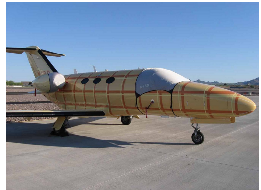
Citation Mustang Windshield Cover, Intake Cover/Exhaust Plug Set, Pitot Covers