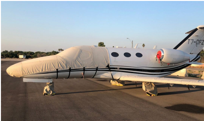
Cessna 510 Mustang Cockpit/Nose Cover, Engine Inlet Plugs