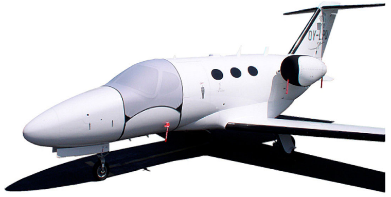
Citation Mustang Windshield Cover, Intake Cover/Exhaust Plug Set, Pitot Covers