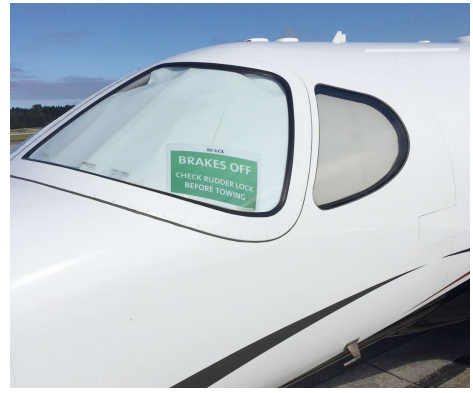
Cessna Mustang 510 Cockpit Heatshields