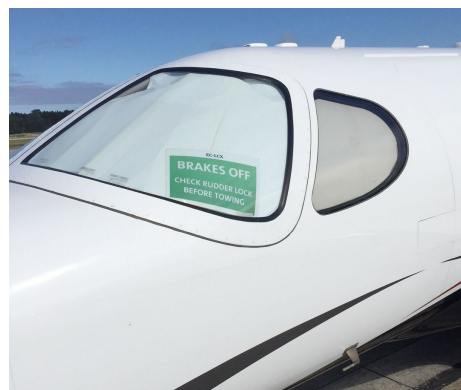
Cessna Mustang 510 Cockpit Heatshields