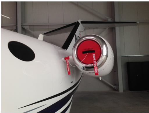
Citation Mustang Engine Intake Plugs

The Engine Inlet Plugs are custom fit for your Cessna Mustang 510 intakes, made with heavy-duty vinyl material, and stuffed with a single block of sculpted urethane foam. Each plug has a zipper that allows the foam to be removed and dried if necessary. Engine plugs have 'remove before flight' streamers sewn onto the face of the plugs. Most plugs are imprinted with the aircraft registration number in black for an extra charge. Storage bag NOT included. Engine plugs may be inserted after flight when the engine is still warm. Engine Inlet Plugs are commonly referred to as Cowl Plugs, Intake Plugs, Cowl Blocks, Engine Blocks, and Engine Bungs.