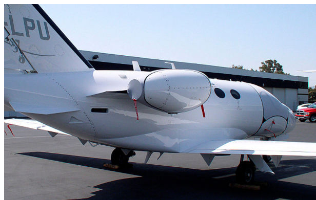
Citation Mustang Light Weight Engine Cover, Light Weight Windshield Cover, Pitot/AOA Cover