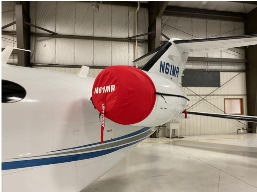
Cessna 510 Engine Inlet Covers & Exhaust Plugs

The Cessna Mustang 510 Intake/Exhaust Plugs are custom fit for the intake and exhaust openings, made with heavy-duty vinyl material, and stuffed with a single block of sculpted urethane foam. Each plug has a zipper that allows the foam to be removed and dried if necessary. Engine plugs have 'remove before flight' streamers sewn onto the face of the plugs. Most plugs are imprinted with the aircraft registration number in black. Engine plugs may be inserted after flight when the engine is still warm. Engine Inlet Plugs are commonly referred to as Cowl Plugs, Intake Plugs, Cowl Blocks, Engine Blocks, and Engine Bungs.