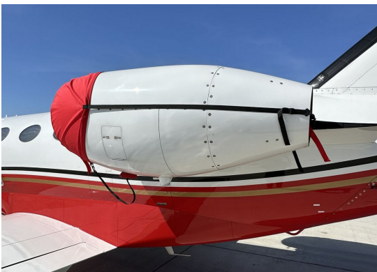
Cessna Citation Mustang 510 Intake Cover/Exhaust Plug Set

The Cessna Mustang 510 Intake/Exhaust Plugs are custom fit for the intake and exhaust openings, made with heavy-duty vinyl material, and stuffed with a single block of sculpted urethane foam. Each plug has a zipper that allows the foam to be removed and dried if necessary. Engine plugs have 'remove before flight' streamers sewn onto the face of the plugs. Most plugs are imprinted with the aircraft registration number in black. Engine plugs may be inserted after flight when the engine is still warm. Engine Inlet Plugs are commonly referred to as Cowl Plugs, Intake Plugs, Cowl Blocks, Engine Blocks, and Engine Bungs.