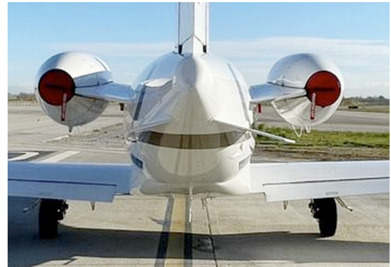
Cessna Mustang Exhaust Plugs