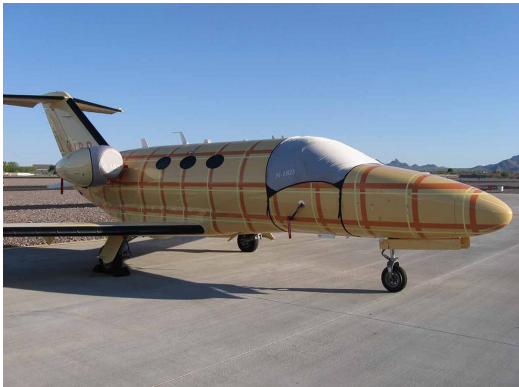
Citation Mustang Light Weight Windshield & Engine Covers

This cover type is made from Silver Acrylic Sunbrella canvas and is 100% lined with a soft and smooth microfiber. Bruce's Custom Covers developed this material combination especially for aircraft protection. The outer material is medium weight and treated for water resistance, UV resistance and anti-static buildup. The inner lining is a very soft and smooth microfiber to prevent scratching. The material is very reflective, and tests show that the cabin interior temperature can be reduced to near-ambient temperature on the hottest of days. It is water, ice and snow repellent, yet breathable to allow moisture to escape from between the cover and the aircraft surface.