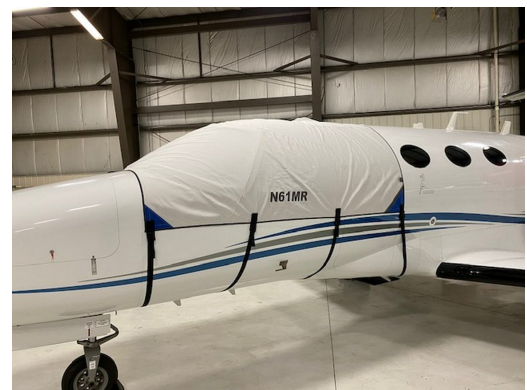
Cessna 510 Cockpit Cover extends to cover door