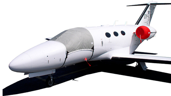
Cessna 510 Cockpit Cover extends to cover door Citation Mustang Windshield Cover, Intake Cover/Exhaust Plug Set, Pitot Covers