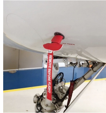
Grumman Gulfstream G-V Rosemont/TAT Cover