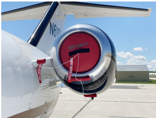
Cessna Citation Mustang 510 Engine Inlet Plugs, set of 8

The Engine Inlet Plugs are custom fit for your Cessna Mustang 510 intakes, made with heavy-duty vinyl material, and stuffed with a single block of sculpted urethane foam. Each plug has a zipper that allows the foam to be removed and dried if necessary. Engine plugs have 'remove before flight' streamers sewn onto the face of the plugs. Most plugs are imprinted with the aircraft registration number in black for an extra charge. Storage bag NOT included. Engine plugs may be inserted after flight when the engine is still warm. Engine Inlet Plugs are commonly referred to as Cowl Plugs, Intake Plugs, Cowl Blocks, Engine Blocks, and Engine Bungs.