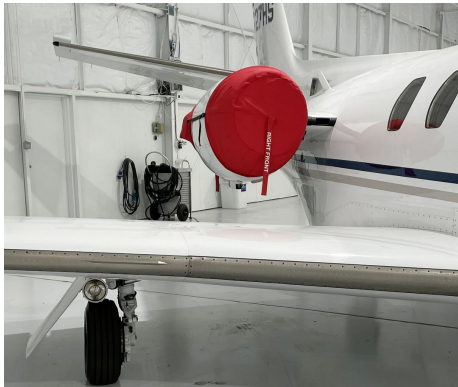
Cessna Citation S550 Intake/Exhaust Covers

The Cessna Citation II (550, 551, UC-35A, with JT15D) Intake Covers are designed to install easily yet be completely storable. A spring steel hoop is sewn into the hem of each cover, allowing them to be installed without climbing onto the wing or using a stepladder. To store the covers the spring steel hoop folds like a band-saw blade into three nesting rings. Each cover folds into a compact circular bundle which is stored in the included duffle bag, yet they unfold quickly for use. The Tri-Fold Ring cover is made of medium weight nylon which is available in a variety of colors to match the paint trim. Each cover set comes complete with installation and folding instructions. The aircraft's registration number can be silkscreened onto the cover for an extra charge.