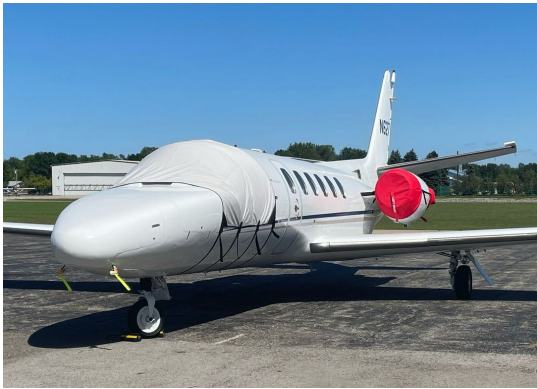
Cessna 550 Citation II

This cover type is made from Silver Acrylic Sunbrella canvas and is 100% lined with a soft and smooth microfiber. Bruce's Custom Covers developed this material combination especially for aircraft protection. The outer material is medium weight and treated for water resistance, UV resistance and anti-static buildup. The inner lining is a very soft and smooth microfiber to prevent scratching. The material is very reflective, and tests show that the cabin interior temperature can be reduced to near-ambient temperature on the hottest of days. It is water, ice and snow repellent, yet breathable to allow moisture to escape from between the cover and the aircraft surface.