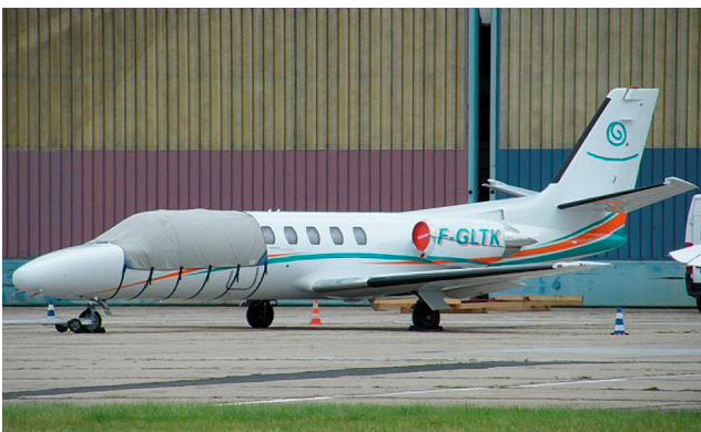
Citation Windshield Cover, to back of door

This cover type is made from Silver Acrylic Sunbrella canvas and is 100% lined with a soft and smooth microfiber. Bruce's Custom Covers developed this material combination especially for aircraft protection. The outer material is medium weight and treated for water resistance, UV resistance and anti-static buildup. The inner lining is a very soft and smooth microfiber to prevent scratching. The material is very reflective, and tests show that the cabin interior temperature can be reduced to near-ambient temperature on the hottest of days. It is water, ice and snow repellent, yet breathable to allow moisture to escape from between the cover and the aircraft surface.