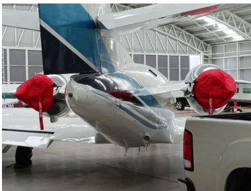
Cessna 551 Citation II SP Engine covers (with thrust reversers, smooth gen. inlet)

The Cessna Citation II (550, 551, UC-35A, with JT15D) Intake Covers are designed to install easily yet be completely storable. A spring steel hoop is sewn into the hem of each cover, allowing them to be installed without climbing onto the wing or using a stepladder. To store the covers the spring steel hoop folds like a band-saw blade into three nesting rings. Each cover folds into a compact circular bundle which is stored in the included duffle bag, yet they unfold quickly for use. The Tri-Fold Ring cover is made of medium weight nylon which is available in a variety of colors to match the paint trim. Each cover set comes complete with installation and folding instructions. The aircraft's registration number can be silkscreened onto the cover for an extra charge.