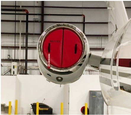
Embraer Legacy 500 Engine Inlet Plugs, folding type

The Engine Inlet Plugs are custom fit for your Cessna Citation II (550, 551, UC-35A, with JT15D) intakes, made with heavy-duty vinyl material, and stuffed with a single block of sculpted urethane foam. Each plug has a zipper that allows the foam to be removed and dried if necessary. Engine plugs have 'remove before flight' streamers sewn onto the face of the plugs. Most plugs are imprinted with the aircraft registration number in black for an extra charge. Storage bag NOT included. Engine plugs may be inserted after flight when the engine is still warm. Engine Inlet Plugs are commonly referred to as Cowl Plugs, Intake Plugs, Cowl Blocks, Engine Blocks, and Engine Bungs.