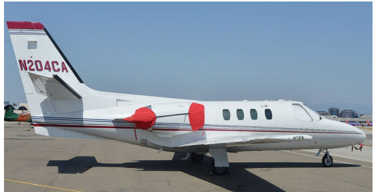
Cessna Citation Engine Covers and Heatshields