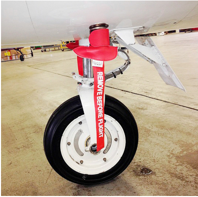
Rosemount Probe Cover

The Engine Inlet Plugs are custom fit for your Cessna Citationjet V Ultra (560) intakes, made with heavy-duty vinyl material, and stuffed with a single block of sculpted urethane foam. Each plug has a zipper that allows the foam to be removed and dried if necessary. Engine plugs have 'remove before flight' streamers sewn onto the face of the plugs. Most plugs are imprinted with the aircraft registration number in black for an extra charge. Storage bag NOT included. Engine plugs may be inserted after flight when the engine is still warm. Engine Inlet Plugs are commonly referred to as Cowl Plugs, Intake Plugs, Cowl Blocks, Engine Blocks, and Engine Bungs.