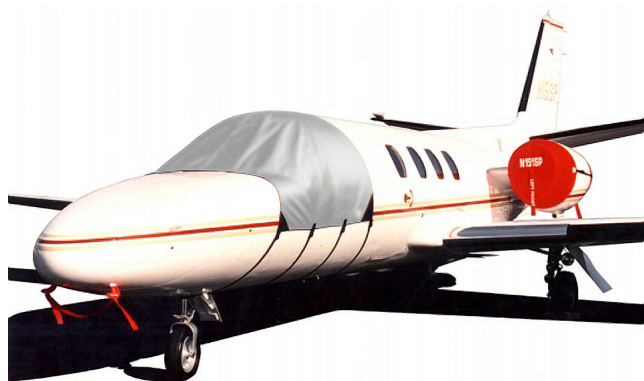
Cessna Citation Windshield Cover, Engine Cover set and Pitot Covers

This cover type is made from Silver Acrylic Sunbrella canvas and is 100% lined with a soft and smooth microfiber. Bruce's Custom Covers developed this material combination especially for aircraft protection. The outer material is medium weight and treated for water resistance, UV resistance and anti-static buildup. The inner lining is a very soft and smooth microfiber to prevent scratching. The material is very reflective, and tests show that the cabin interior temperature can be reduced to near-ambient temperature on the hottest of days. It is water, ice and snow repellent, yet breathable to allow moisture to escape from between the cover and the aircraft surface.