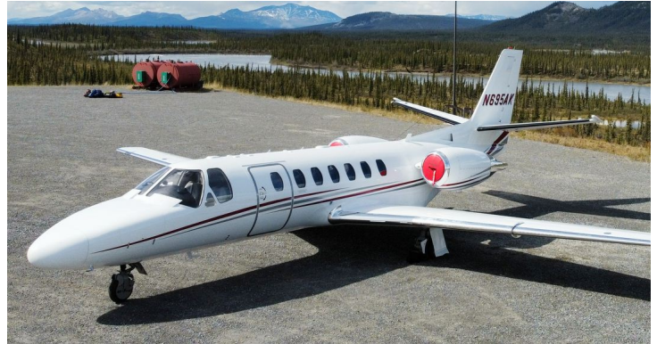
Citation Windshield Cover, Engine Cover set and Pitot Covers