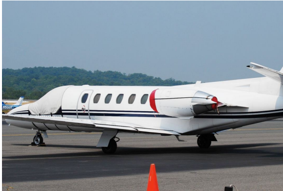
Cessna Citation S2 Cockpit Cover, Intake Covers & Exhaust Plugs

The Cessna Citationjet V Ultra & Encore Models Intake/Exhaust Plugs are custom fit for the intake and exhaust openings, made with heavy-duty vinyl material, and stuffed with a single block of sculpted urethane foam. Each plug has a zipper that allows the foam to be removed and dried if necessary. Engine plugs have 'remove before flight' streamers sewn onto the face of the plugs. Most plugs are imprinted with the aircraft registration number in black. Engine plugs may be inserted after flight when the engine is still warm. Engine Inlet Plugs are commonly referred to as Cowl Plugs, Intake Plugs, Cowl Blocks, Engine Blocks, and Engine Bungs.