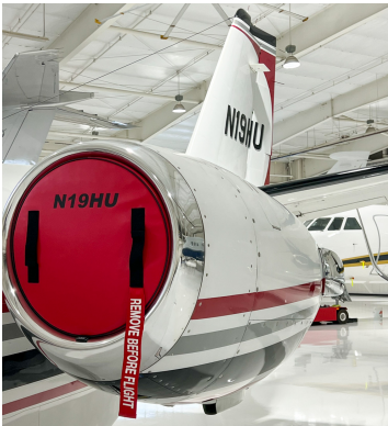
Citationjet V Ultra (560) Exhaust Plugs (set of 2)