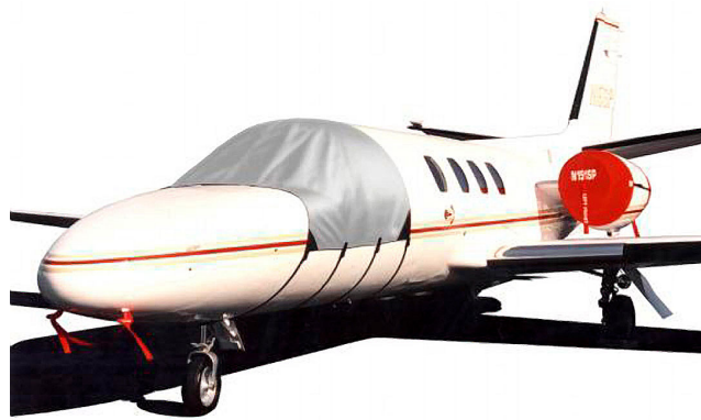
Citation Windshield Cover, Engine Cover set and Pitot Covers