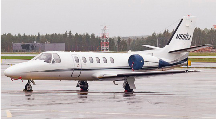
Cessna Citation Bravo Engine Covers and Pitot Covers sets