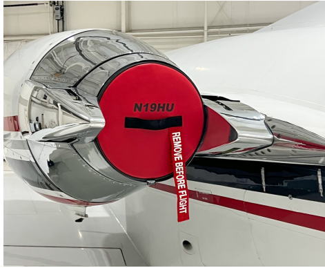
Citationjet V Ultra (560) Exhaust Plugs (set of 2)

The Engine Inlet Plugs are custom fit for your Cessna Citationjet V Ultra & Encore Models intakes, made with heavy-duty vinyl material, and stuffed with a single block of sculpted urethane foam. Each plug has a zipper that allows the foam to be removed and dried if necessary. Engine plugs have 'remove before flight' streamers sewn onto the face of the plugs. Most plugs are imprinted with the aircraft registration number in black for an extra charge. Storage bag NOT included. Engine plugs may be inserted after flight when the engine is still warm. Engine Inlet Plugs are commonly referred to as Cowl Plugs, Intake Plugs, Cowl Blocks, Engine Blocks, and Engine Bungs.