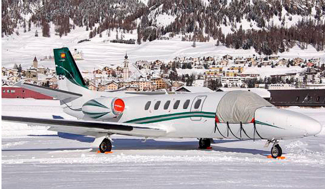
Cessna Citation 550 Windshield Cover

This cover type is made from Silver Acrylic Sunbrella canvas and is 100% lined with a soft and smooth microfiber. Bruce's Custom Covers developed this material combination especially for aircraft protection. The outer material is medium weight and treated for water resistance, UV resistance and anti-static buildup. The inner lining is a very soft and smooth microfiber to prevent scratching. The material is very reflective, and tests show that the cabin interior temperature can be reduced to near-ambient temperature on the hottest of days. It is water, ice and snow repellent, yet breathable to allow moisture to escape from between the cover and the aircraft surface.