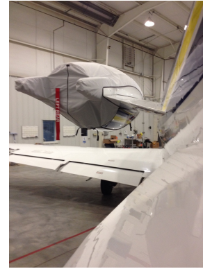
Cessna Citation 560XL Upper Nacelle/Brightwork Covers