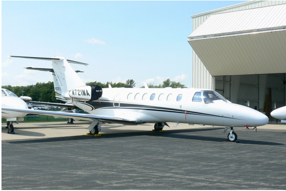
Cessna Citation CJ3 Bikini Style Engine Covers

The Cessna Citation II Bravo Intake/Exhaust Plugs are custom fit for the intake and exhaust openings, made with heavy-duty vinyl material, and stuffed with a single block of sculpted urethane foam. Each plug has a zipper that allows the foam to be removed and dried if necessary. Engine plugs have 'remove before flight' streamers sewn onto the face of the plugs. Most plugs are imprinted with the aircraft registration number in black. Engine plugs may be inserted after flight when the engine is still warm. Engine Inlet Plugs are commonly referred to as Cowl Plugs, Intake Plugs, Cowl Blocks, Engine Blocks, and Engine Bungs.