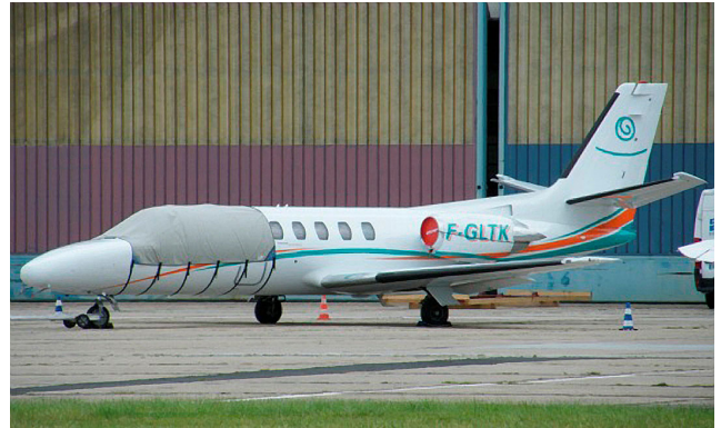
Citation Windshield Cover, to back of door