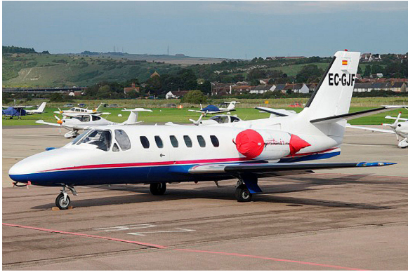
Cessna Citation II Engine Covers, Pitot Covers

The Cessna Citation II Bravo Intake/Exhaust Plugs are custom fit for the intake and exhaust openings, made with heavy-duty vinyl material, and stuffed with a single block of sculpted urethane foam. Each plug has a zipper that allows the foam to be removed and dried if necessary. Engine plugs have 'remove before flight' streamers sewn onto the face of the plugs. Most plugs are imprinted with the aircraft registration number in black. Engine plugs may be inserted after flight when the engine is still warm. Engine Inlet Plugs are commonly referred to as Cowl Plugs, Intake Plugs, Cowl Blocks, Engine Blocks, and Engine Bungs.