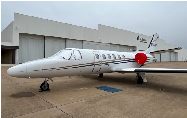
Cessna 550 Intake Covers & Exhaust Plugs, includes wedge plug for nacelle recommended (set of 6)