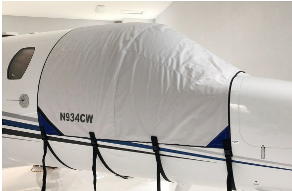
Cessna Citation M2 Cockpit Cover

This cover type is made from Silver Acrylic Sunbrella canvas and is 100% lined with a soft and smooth microfiber. Bruce's Custom Covers developed this material combination especially for aircraft protection. The outer material is medium weight and treated for water resistance, UV resistance and anti-static buildup. The inner lining is a very soft and smooth microfiber to prevent scratching. The material is very reflective, and tests show that the cabin interior temperature can be reduced to near-ambient temperature on the hottest of days. It is water, ice and snow repellent, yet breathable to allow moisture to escape from between the cover and the aircraft surface.