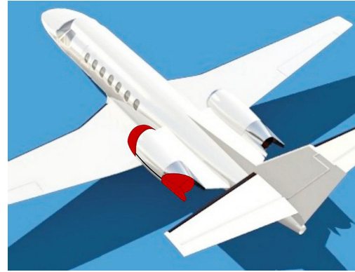
Cessna Citation II with TR's Exhaust Cover Illustration