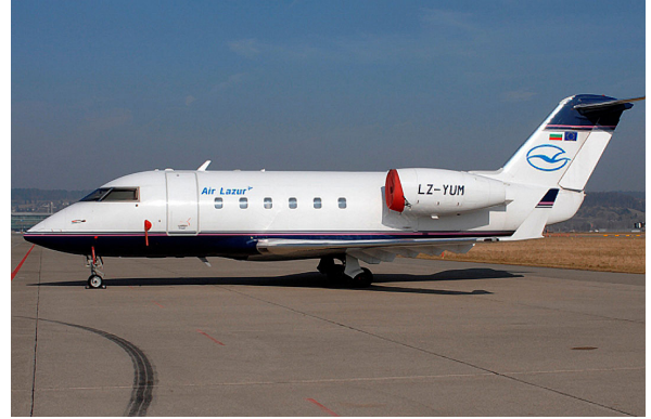
Challenger 600 Intake Covers