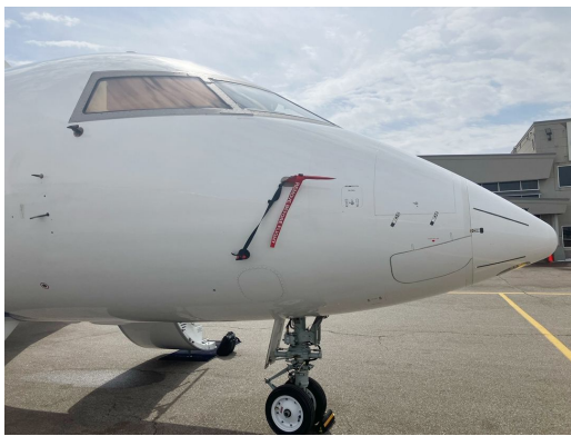
Challenger 650 Pitot & Ice Detector Covers