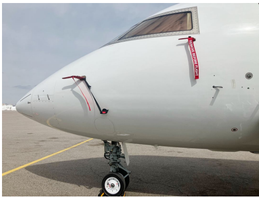
Challenger 650 Pitot & Ice Detector Covers