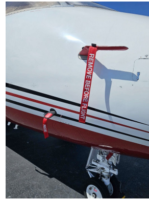
Canadair Challenger 601 Pitot Covers, Heat Resistant Type