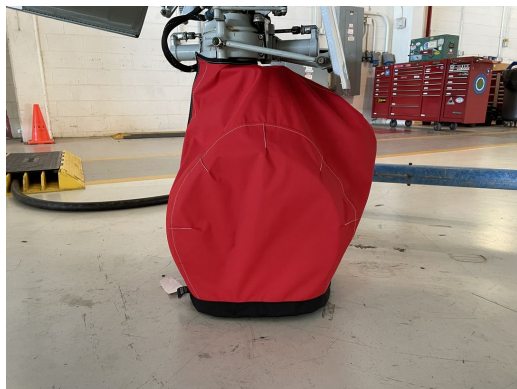
Canadair Challenger 605 Nose Gear Tire Cover

ALL-YEAR USE MATERIAL - Made with Silver Acrylic Sunbrella canvas, the all-year use material is the best option for sun protection and cover longevity. This heavier more durable material is intended for all weather conditions, such as rain and snow or lots of sun.