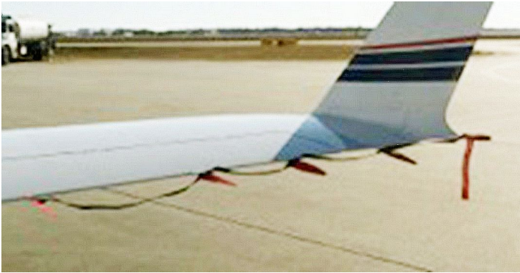
Static Wick Covers

with the aircraft registration number in black for an extra charge. Storage bag NOT included. Engine plugs may be inserted after flight when the engine is still warm. Engine Inlet Plugs are commonly referred to as Cowl Plugs, Intake Plugs, Cowl Blocks, Engine Blocks, and Engine Bungs.