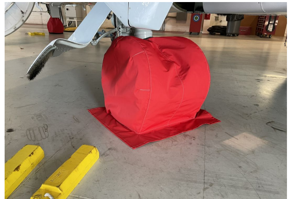
Canadair Challenger 605 Main Gear Tire Covers