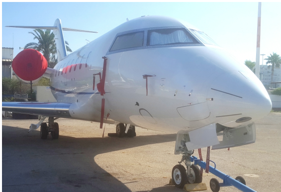
Canadair Challenger 604, 605, 650, 850 Intake Covers

The Canadair Challenger 604, 605, 650, 850 Intake Covers are designed to install easily yet be completely storable. A spring steel hoop is sewn into the hem of each cover, allowing them to be installed without climbing onto the wing or using a stepladder. To store the covers the spring steel hoop folds like a band-saw blade into three nesting rings. Each cover folds into a compact circular bundle which is stored in the included duffle bag, yet they unfold quickly for use. The Tri-Fold Ring cover is made of medium weight nylon which is available in a variety of colors to match the paint trim. Each cover set comes complete with installation and folding instructions. The aircraft's registration number can be silkscreened onto the cover for an extra charge.