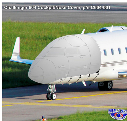
Challenger 601/604 Cockpit/Nose Cover, illustration

This cover type is made from Silver Acrylic Sunbrella canvas and is 100% lined with a soft and smooth microfiber. Bruce's Custom Covers developed this material combination especially for aircraft protection. The outer material is medium weight and treated for water resistance, UV resistance and anti-static buildup. The inner lining is a very soft and smooth microfiber to prevent scratching. The material is very reflective, and tests show that the cabin interior temperature can be reduced to near-ambient temperature on the hottest of days. It is water, ice and snow repellent, yet breathable to allow moisture to escape from between the cover and the aircraft surface.