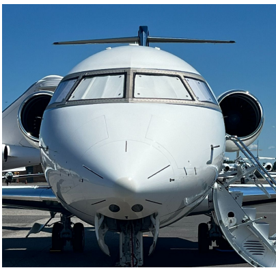
Bombardier CL-600-2B16 Cockpit Heatshields