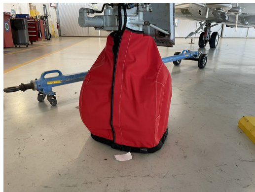
Canadair Challenger 605 Nose Gear Tire Cover