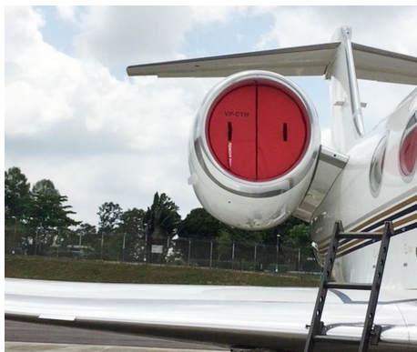
Grumman Gulfstream G450 Intake Plugs

dried if necessary. Engine plugs have 'remove before flight' streamers sewn onto the face of the plugs. Most plugs are imprinted with the aircraft registration number in black for an extra charge. Storage bag NOT included. Engine plugs may be inserted after flight when the engine is still warm. Engine Inlet Plugs are commonly referred to as Cowl Plugs, Intake Plugs, Cowl Blocks, Engine Blocks, and Engine Bungs.