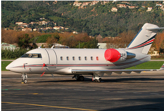
Challenger 601 Intake Covers, standard design

The Canadair Challenger 604, 605, 650, 850 Intake Covers are designed to install easily yet be completely storable. A spring steel hoop is sewn into the hem of each cover, allowing them to be installed without climbing onto the wing or using a stepladder. To store the covers the spring steel hoop folds like a band-saw blade into three nesting rings. Each cover folds into a compact circular bundle which is stored in the included duffle bag, yet they unfold quickly for use. The Tri-Fold Ring cover is made of medium weight nylon which is available in a variety of colors to match the paint trim. Each cover set comes complete with installation and folding instructions. The aircraft's registration number can be silkscreened onto the cover for an extra charge.