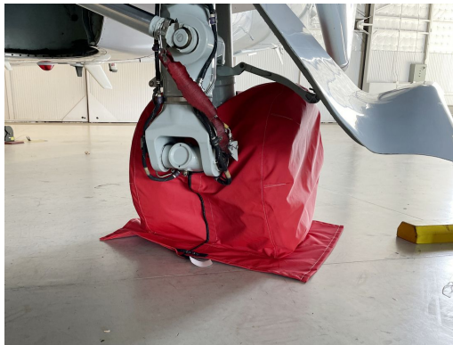
Canadair Challenger 605 Main Gear Tire Covers

ALL-YEAR USE MATERIAL - Made with Silver Acrylic Sunbrella canvas, the all-year use material is the best option for sun protection and cover longevity. This heavier more durable material is intended for all weather conditions, such as rain and snow or lots of sun.