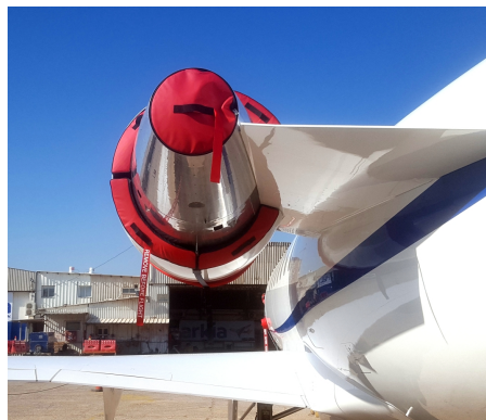
Canadair Challenger 604, 605, 650, 850 Exhaust Plugs