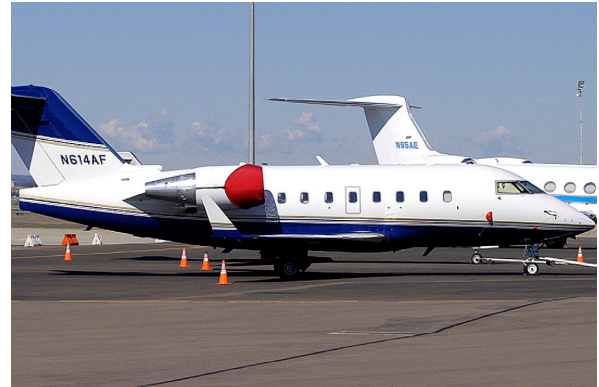
Challenger 604 Intake Covers, standard design