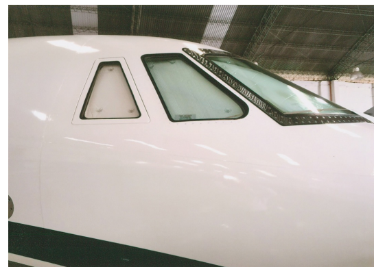
Citation XL Cockpit HeatShields