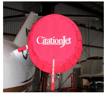
Cessna Citation Engine Cover Set