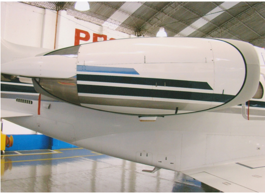
Citation XL Bikini Style Engine Covers