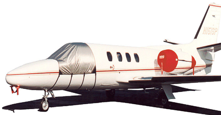
Cessna Citation I Windshield, Pitot and Engine Covers

This cover type is made from Silver Acrylic Sunbrella canvas and is 100% lined with a soft and smooth microfiber. Bruce's Custom Covers developed this material combination especially for aircraft protection. The outer material is medium weight and treated for water resistance, UV resistance and anti-static buildup. The inner lining is a very soft and smooth microfiber to prevent scratching. The material is very reflective, and tests show that the cabin interior temperature can be reduced to near-ambient temperature on the hottest of days. It is water, ice and snow repellent, yet breathable to allow moisture to escape from between the cover and the aircraft surface.